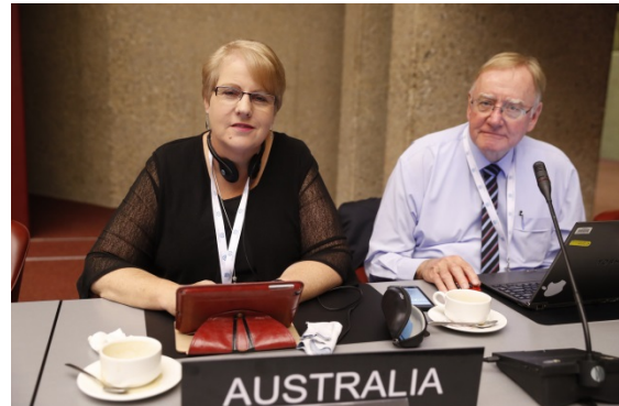
Senator Catryna Bilyk and Senator the Hon Ian Macdonald attending a meeting of the Forum of Women Parliamentarians

Attending statutory assemblies of the IPU offers members of the Australian Parliament the unique opportunity to meet informally with other parliamentarians to discuss and share information about issues of mutual interest, and build on parliament-to-parliament relationships. Bilateral and multilateral meetings complement this opportunity. During the 138 th Assembly, bilateral meetings were held with delegations from Israel the Ukraine, Canada, the United Kingdom and New Zealand. The Australian and New Zealand delegations met with delegates from Pacific Island nations, including delegates from the Marshall Islands, Fiji, Vanuatu and the Federated States of Micronesia.