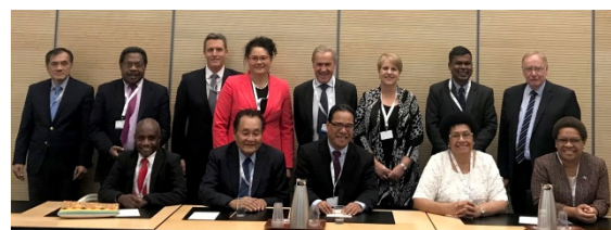
Mr Josh Wilson MP, Senator Catryna Bilyk and Senator the Hon Ian Macdonald and the New Zealand delegation meeting with delegates from Pacific Island nations

Attending statutory assemblies of the IPU offers members of the Australian Parliament the unique opportunity to meet informally with other parliamentarians to discuss and share information about issues of mutual interest, and build on parliament-to-parliament relationships. Bilateral and multilateral meetings complement this opportunity. During the 138 th Assembly, bilateral meetings were held with delegations from Israel the Ukraine, Canada, the United Kingdom and New Zealand. The Australian and New Zealand delegations met with delegates from Pacific Island nations, including delegates from the Marshall Islands, Fiji, Vanuatu and the Federated States of Micronesia.