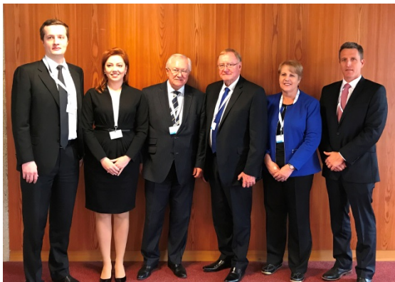
Senator the Hon Ian Macdonald, Senator Catryna Bilyk and Mr Josh Wilson MP meeting with the delegation from Ukraine

In addition to the Forum of Women Parliamentarians and the four standing committees, a number of other subsidiary bodies to the IPU met during the Assembly: