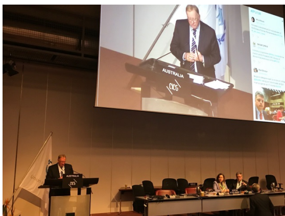
Senator the Hon Ian Macdonald (above) and Senator Catryna Bilyk (below) speaking during the general debate