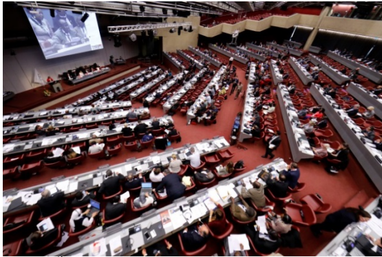
The 138 th Inter-Parliamentary Union Assembly