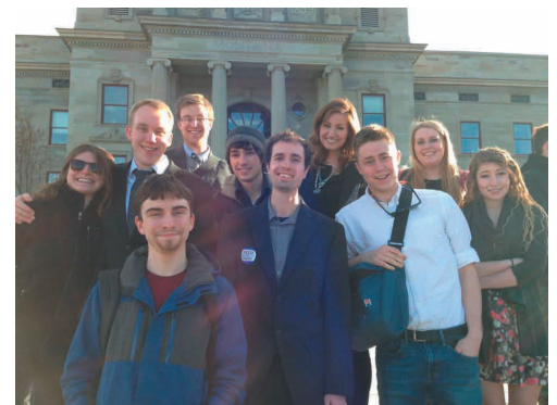
MontPIRG students at the Capitol for a lobby day

HB 30 Repealing same day voter registration (Ted Washburn, R-Bozeman) Would have eliminated same day voter registration. Same day registration is an important tool that protects voting rights by ensuring that no one is denied the right to vote due to an administrative error or a lost voter registration card. Without same day voter registration, thousands of Montanans would be turned away at the polls each election. MontPIRG opposed. Senate Vote: 3rd reading passed 29-21. House Vote: 2nd reading passed 61-39. Status: Bill vetoed by the Governor.