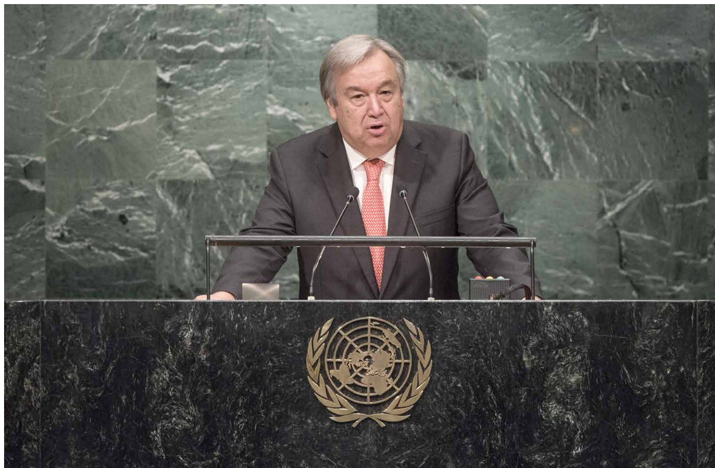
ABOVE: Incoming UN Secretary-General António Guterres addresses the General Assembly, October 2016.

The Security Council's selection of António Guterres to be the next United Nations Secretary-General was broadly welcomed within the organization and outside, even if there was some disappointment that a woman did not get the post. Secretary-General Ban Ki-moon called Mr. Guterres, a former UN High Commissioner for Refugees, a “superb choice”, saying his past experience as Prime Minister of Portugal, among other qualities, would serve him well in leading the United Nations in a crucial period.