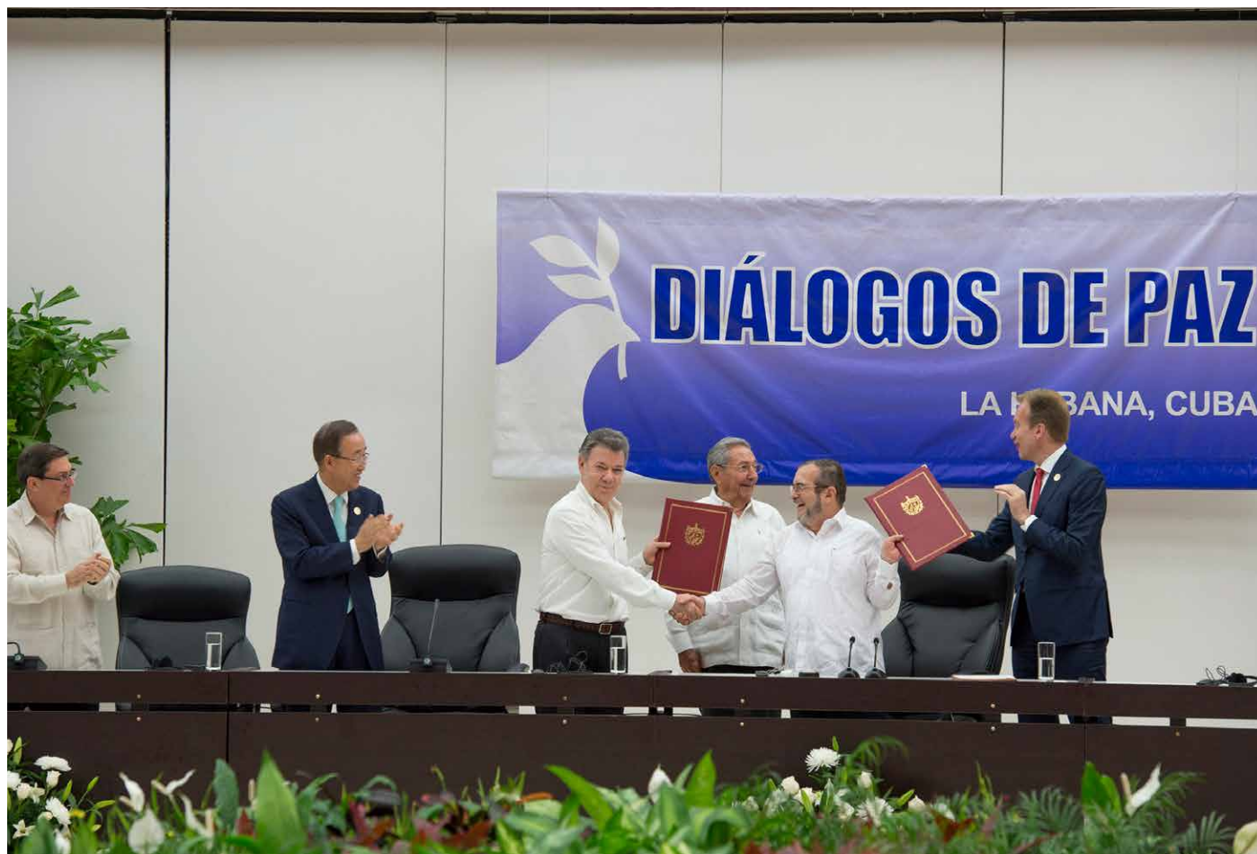
ABOVE: Preliminary Conclusion of Colombia Peace Agreement, Havana, Cuba, June 2016.