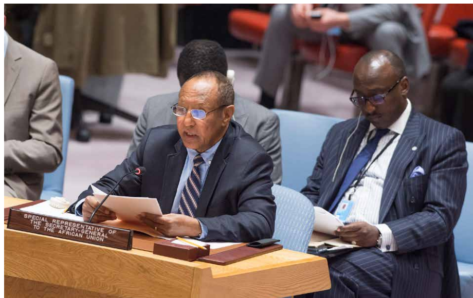
ABOVE: Special Representative Haile Menkerios.

The Department of Political Affairs describes its work using three nouns: diplomacy, prevention and action. This tag line cannot possibly encapsulate all of DPAs activities, but it does capture key elements of its core work of preventive diplomacy. As we highlight below, those elements were in evidence the Comoros islands earlier this year, when UN and DPA action, taken together with the African Union, proved instrumental in helping reduce tensions during and after key elections.