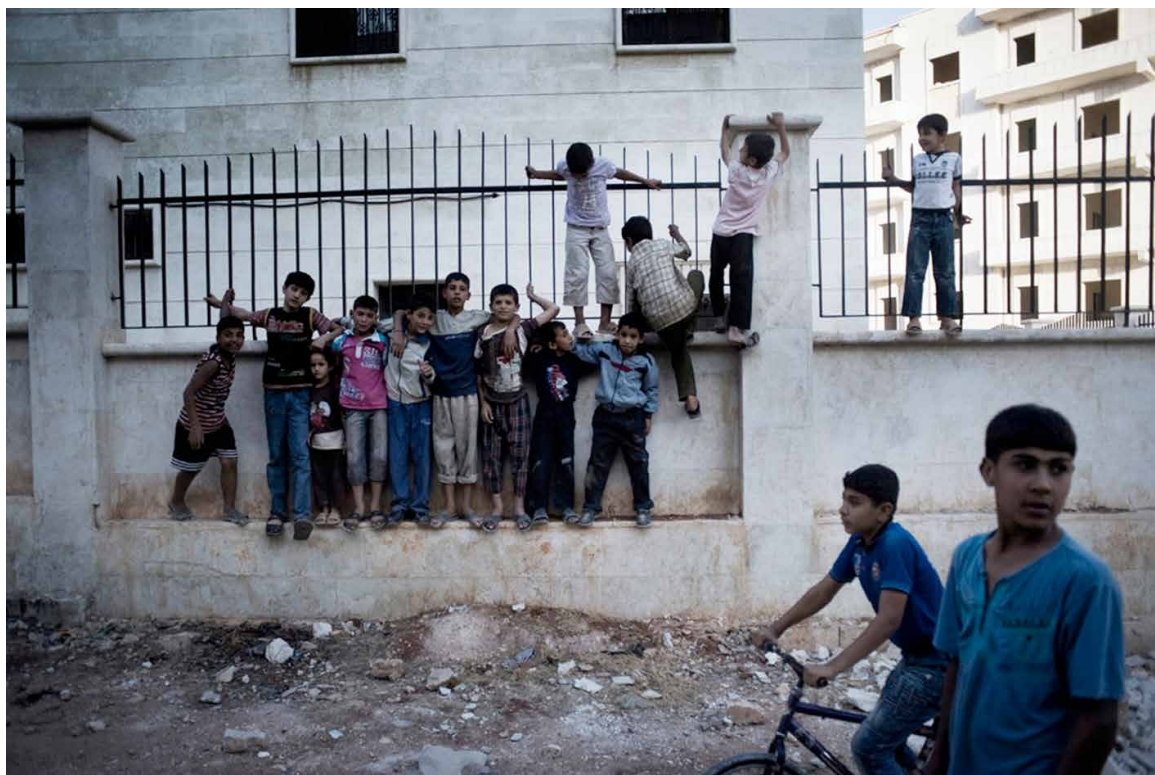
LEFT: Boys play on the streets of Aleppo, capital of the north-western Aleppo Governorate, Syria.

And thirdly, and importantly, challenges are increasingly interconnected. Demographic shifts and resource scarcity continue to create enormous development and political challenges, as do threats emanating from rapid urbanization and climate change. The world is expected to go from 7 billion people today to 9 billion 2050. This will add to already tremendous stresses on infrastructure and resources, as well as a vulnerable pool of disaffected youth.