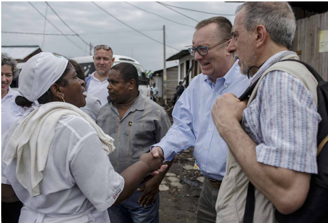
ABOVE: Under-Secretary-General for Political Affairs Jeffrey Feltman in Tumaco, Colombia, 2015.

The UN system operated on a simple premise: that peace can be built locally even in the most violent scenarios, if emphasis is placed on addressing the political, social, economic and racial causes of conflict.