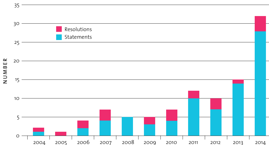
FIGURE 1: Number of UNSC resolutions and presidential statements with reference to “organized crime,” 2004 – 2014