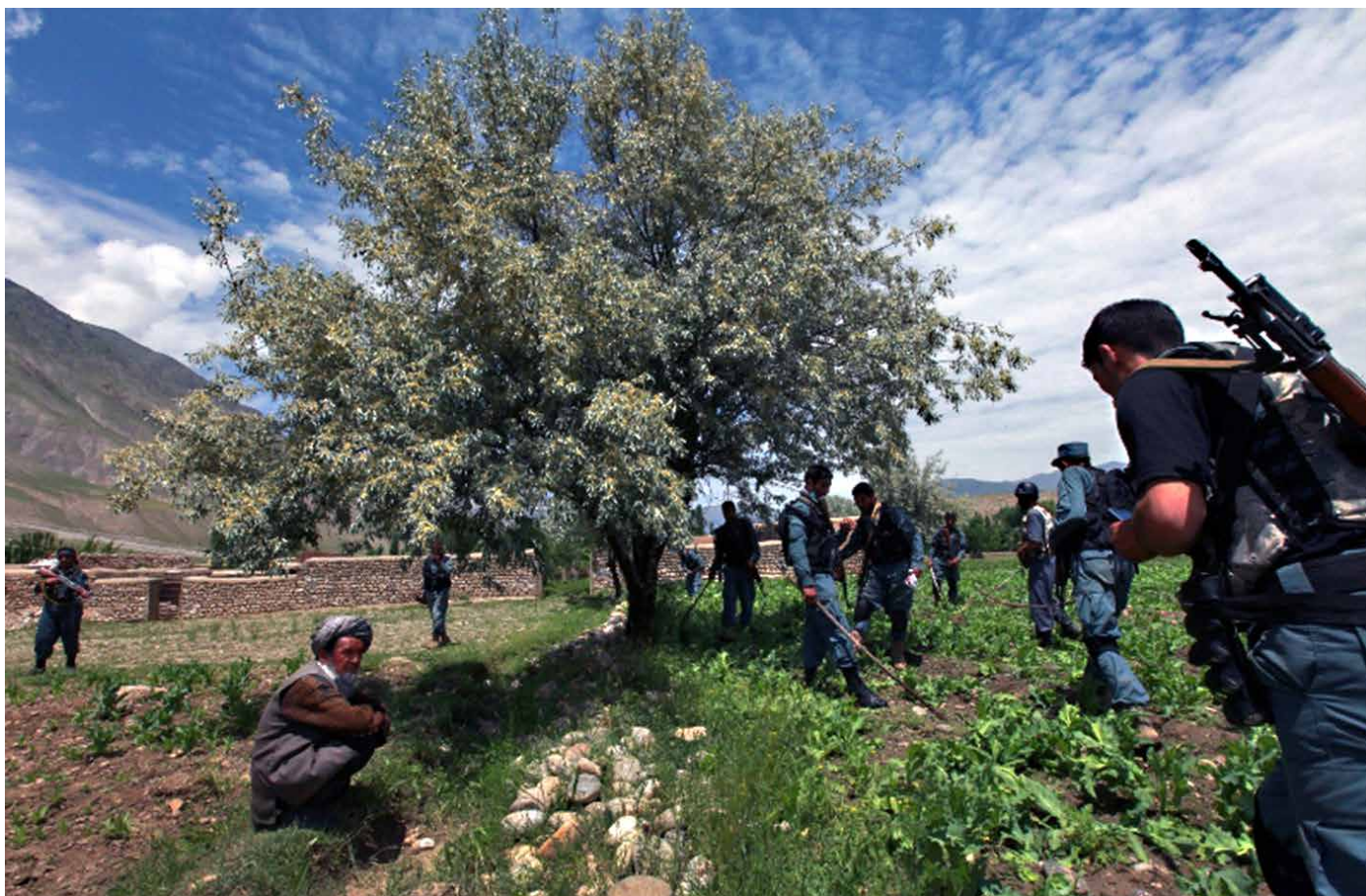
ABOVE: Poppy eradication campaign in north-eastern Afghan province of Badakhshan.