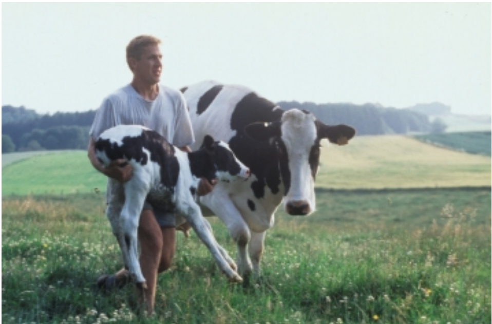
One important item on the EU's budget is support for environment-friendly farming that treats animals well and produces healthy food. Auditors check that this money, like the rest of the budget, is used properly.

The Court of Auditors has no legal powers of its own. If auditors discover fraud or irregularities they pass the information as quickly as possible to the EU bodies responsible, so they can take the appropriate action.