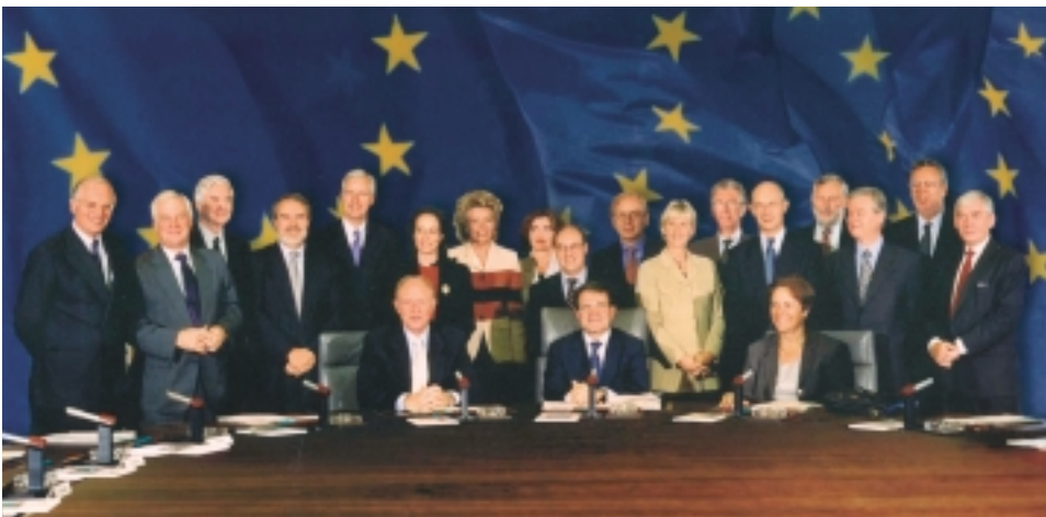
The Members of the European Commission come from all EU countries but are independent of national governments. They meet once a week to discuss EU policies and to propose new European legislation.

So, from the date when the 2004–09 Commission takes office (1 November 2004), there will be only one Commissioner per country. Once the Union has 27 member states, the Council – by a unanimous decision – will fix the maximum number of Commissioners. There must be fewer than 27 of them, and their nationality will be determined by a system of rotation that is absolutely fair to all countries.