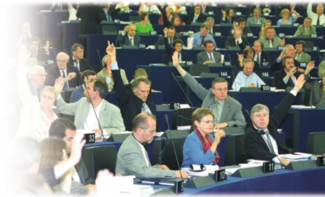
The directly elected representatives of the EU's citizens meet in Strasbourg to debate and vote on Europe-wide legislation that affects everyone.

Other items on the agenda may include Council or Commission 'communications' or questions about what is going on in the European Union or the wider world.