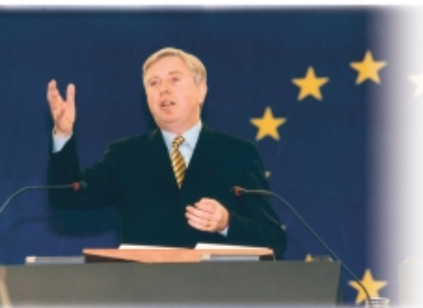
In 2002, Pat Cox was elected President of the European Parliament.