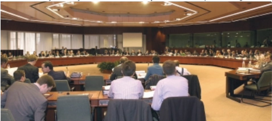
Ministers from every EU country meet in the Council to take joint decisions on EU policies and legislation.

Each year the Council 'concludes' (i.e. officially signs) a number of agreements between the European Union and non-EU countries, as well as with international organisations. These agreements may cover