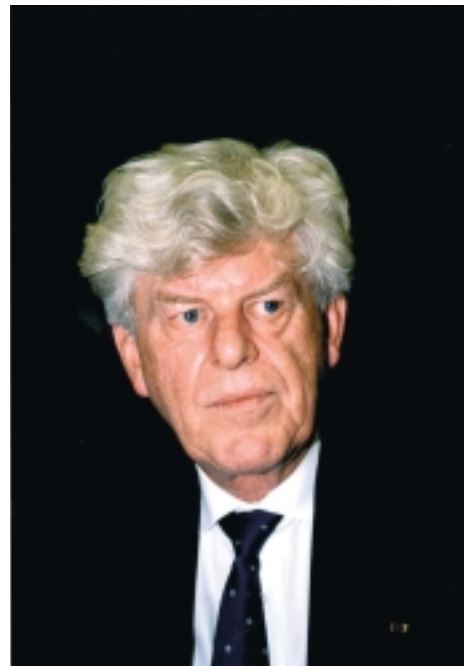
Wim Duisenberg was appointed ECB President in 1998. The Bank's main job is keeping inflation under control.

The General Council is the ECB's third decision-making body. It comprises the ECB's President and the Vice-President and the governors of the national central banks of all 15 EU member states. The General Council contributes to the ECB's advisory and co-ordination work and helps prepare for the future enlargement of the euro zone.