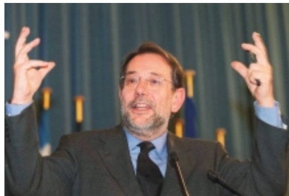
Javier Solana, as the EU's foreign policy chief, acts for Europe on the world stage.

The Secretary-General is assisted by a Deputy Secretary-General in charge of managing the General Secretariat.