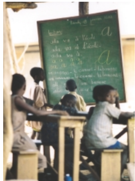
The European Union is the world's leading donor of development aid, including aid for education and for building schools.

Suppose, for example, that the Commission sees a need for EU legislation to prevent pollution of Europe's rivers. The Directorate-General for the Environment will draw up a proposal, based on extensive consultations