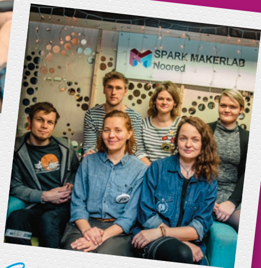
Spark Makerlab team