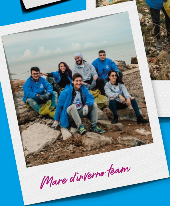
Mare d'inverno team