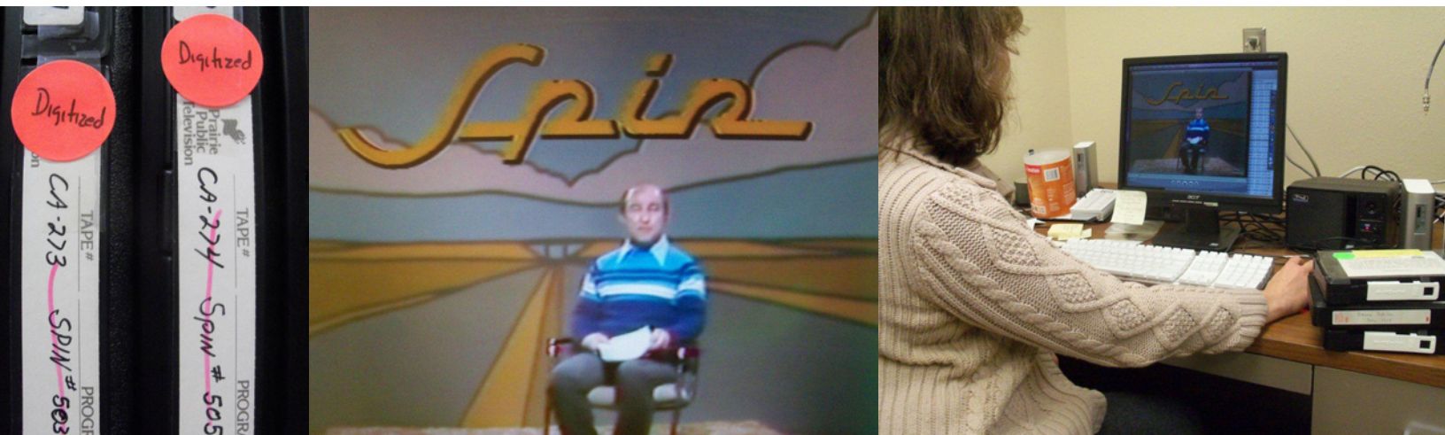
SPIN videotapes were recently digitized from their ¾" format.

If the work gets done right and does not need to be fixed, it is considered a great success.