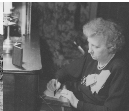
Bess Truman in March, 1946, writing a note at a desk. This photo is from the collection of Truman Papers, Family, Business and Personal Affairs, which was described by a volunteer.