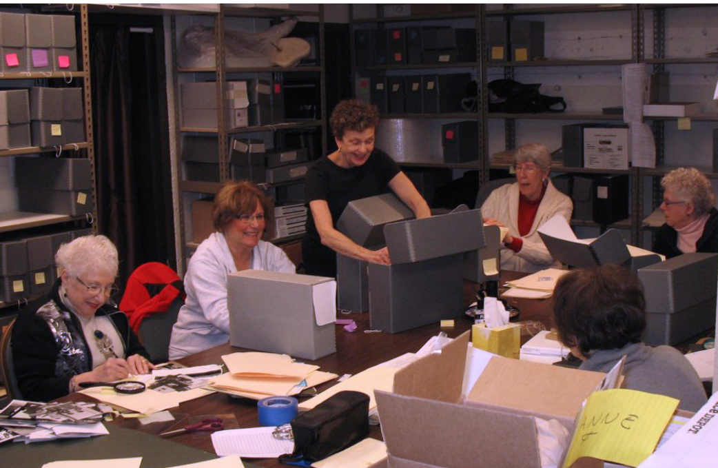
Members of the National Council of Jewish Women, who are assisting with the Congregation Beth Israel Project.

We consider the project a success once the collection has been entirely processed and turned over to the archivist for final arrangement and description.