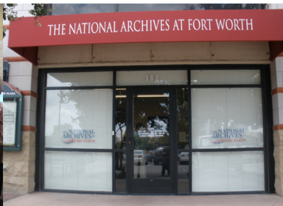
The Montgomery Plaza facility of the National Archives at Fort Worth.