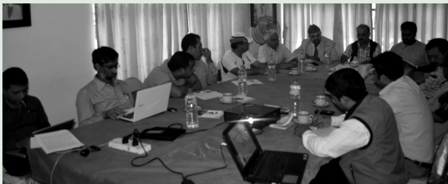
Discussion on national mass communication policy.

F reedom Forum has come up with the stand that the National Mass Communications Policy the government approved in the third week of July is faulty, incomplete, and guided by authoritarian principles.