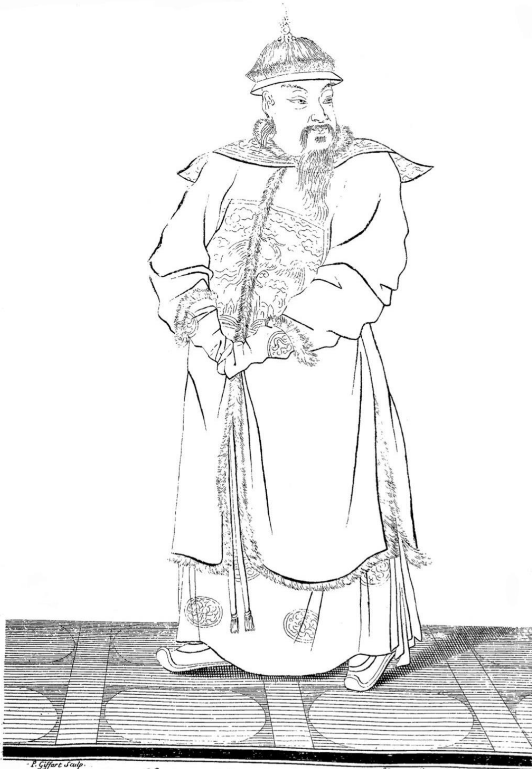
Joachim Bouvet, Costumes des principaux personnages du gouvernement Chinois (Paris, 1686). Eton College Library, Bl.3.01.