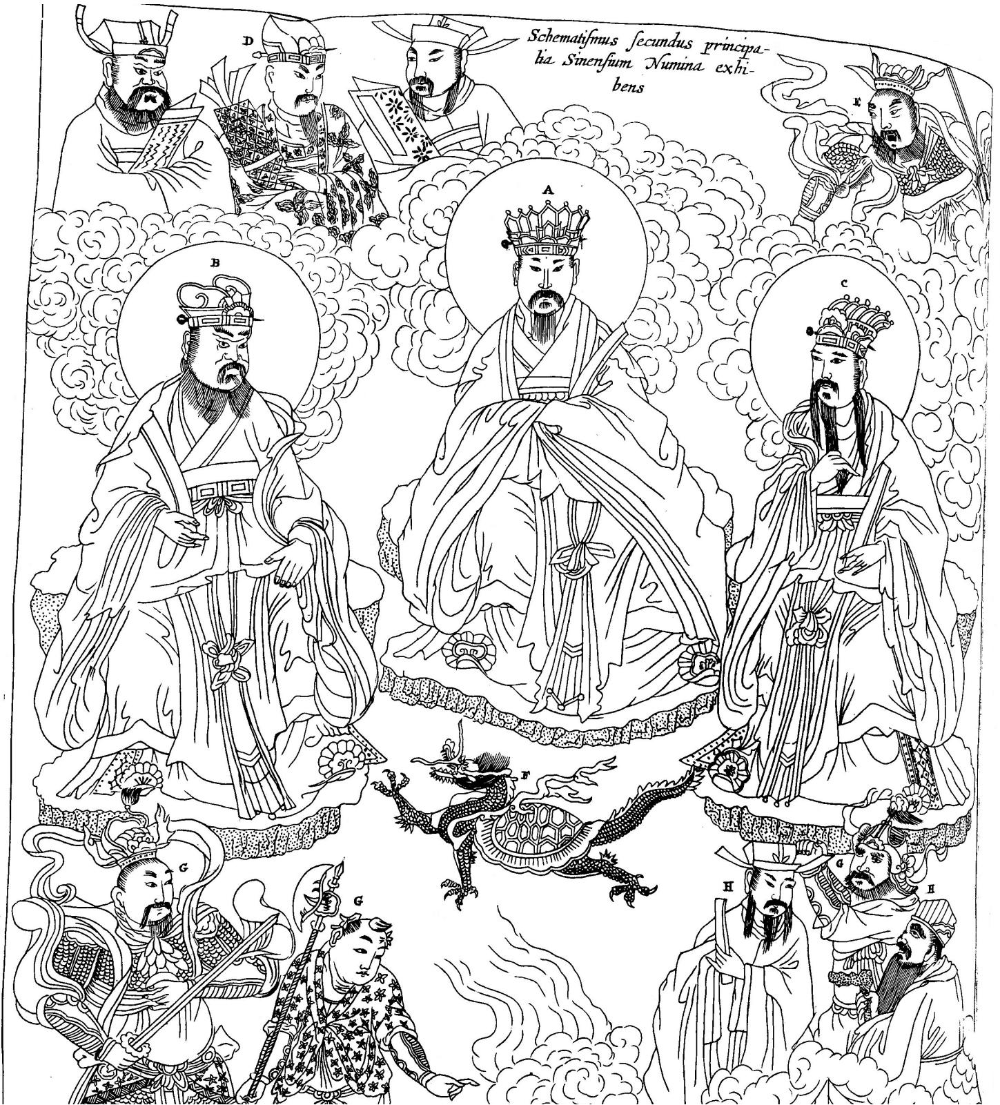
Engraving from Athanasius Kircker, China monumentis qua sacris qua profanes (Amsterdam, 1667). Eton College Library, Bl.2.05