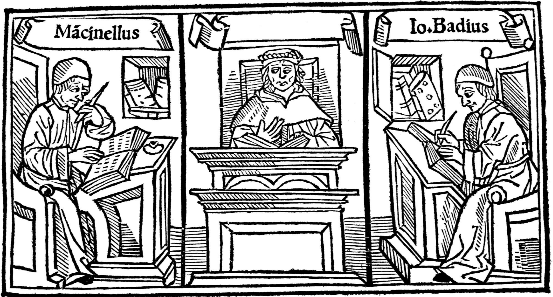
Woodcut from Juvenal, Works (Lyon, 1498). Eton College Library, DDf.5.02, f.[i] recto.