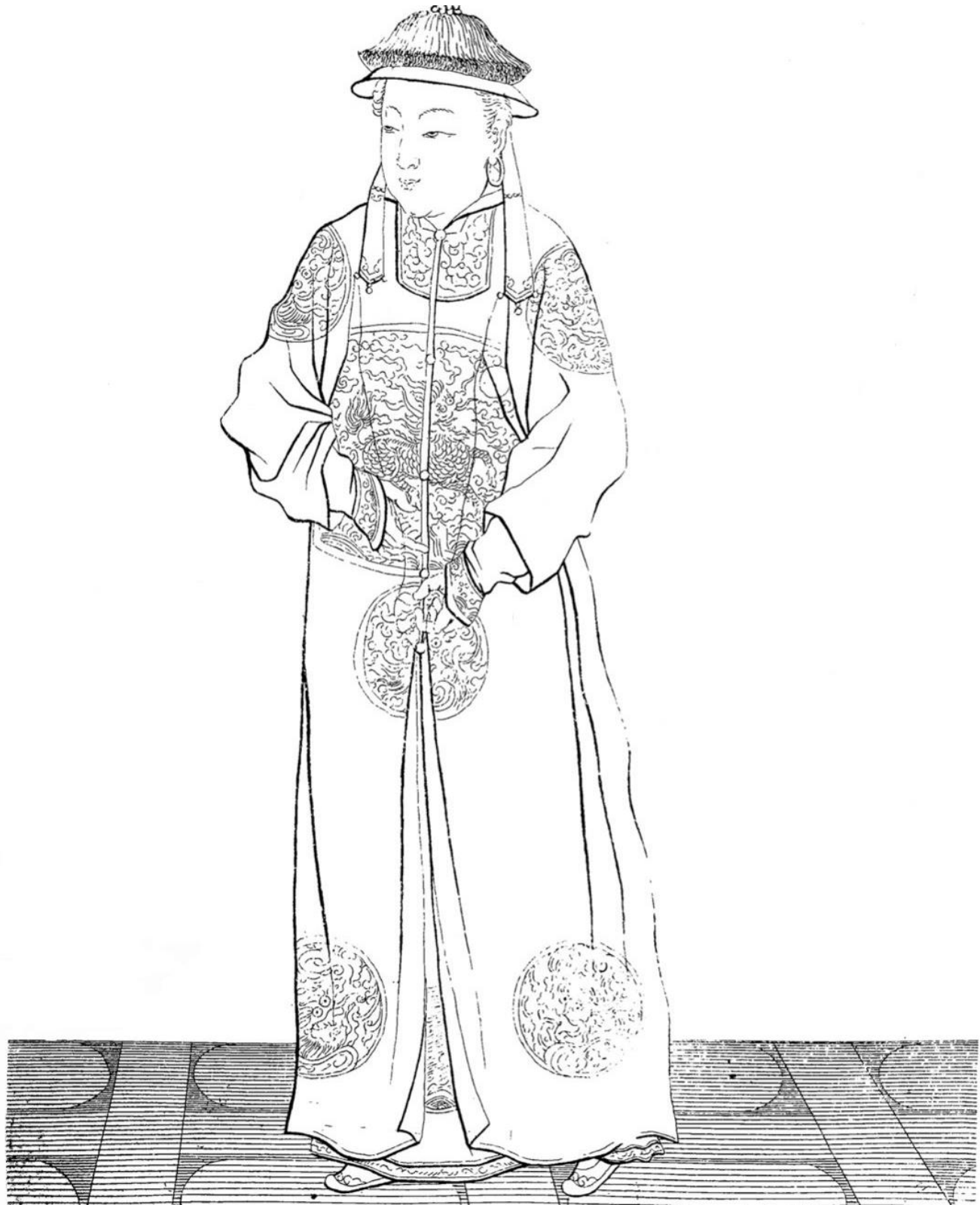
Joachim Bouvet, Costumes des principaux personnages du gouvernement Chinois (Paris, 1686). Eton College Library, Bl.3.01.