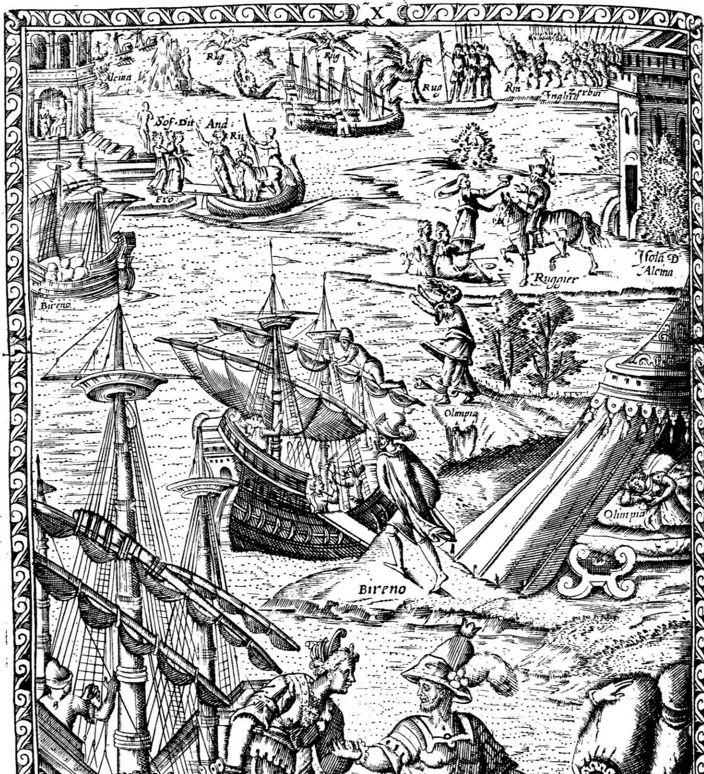
Etching from Lodovico Ariosto, Orlando Furioso translated into English by John Harington (London, 1634). Eton College Library, DDi.4.06.