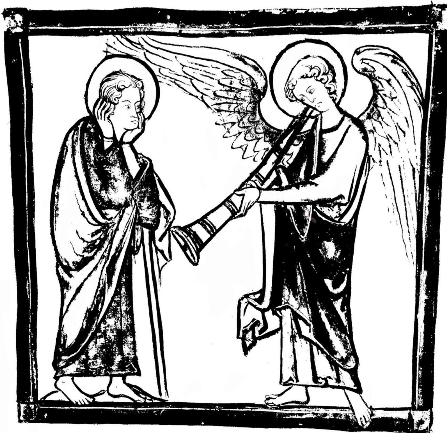
Half-page miniature from a 13th-century illuminated Apocalypse. Eton College Library, MS 177 (part 2).