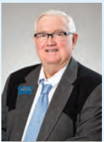
Rep. Mike Cuffe (R-Ekalaka) & Sen. Chas Vincent (R-Libby)

SB 201 would allow people with net metering systems and multiple electricity meters to tie those meters together so all the meters get credit for using clean energy. This only applies to meters on the same or adjacent property. Right now, Montana only allows for a net metering system to credit a single meter but family farmers and ranchers often have separate meters for the family house, barn, machine shop, etc. Jedediah worked hard to get Republican support but the bill was tabled in the Senate Energy Committee. He attempted to "blast" the bill to the Senate floor where 10 Republicans joined 15 Democrats but the motion failed on a 25-25 vote, just one vote short.