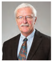
Sen. Dick Barrett (D-Missoula)

We value all of our conservation allies in the legislature, but these legislators deserve special recognition for achieving perfect MCV ratings over multiple sessions. Not included are freshmen who earned 100% in their first terms, but we thank them, too!