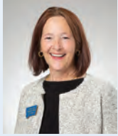
Rep. Moffie Funk (D-Helena)

Kim's HB 532 would have let Montanans register to vote online. So much of our lives are already done online (you can even check your ballot status online), and Kim's bill would have modernized and simplified our voter registration system. Unfortunately, the bill was tabled in committee and an effort to bring it to the House floor failed on a 44-56 vote with all Democrats and 3 Republicans supporting.