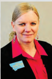
Senator Jennifer Fielder (R-Thompson Falls)

Senator Fielder is not only the CEO of the American Lands Council, the leading organization working to sell off federal public lands, but she brought her special interest bias to the legislature when she actually tried to gut Virginia Court's HB 491 to honor Montana's public lands by designating March 1st as Montana's Public Lands Day and replace it with her own anti-public lands agenda. Fielder's efforts killed the bill in committee.