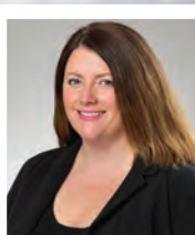
Sen. Cynthia Wolken (D-Missoula)