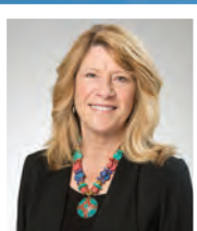
Sen. Sue Malek (D-Missoula)