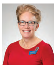
Sen. JP Pomnichowski (D-Bozeman)