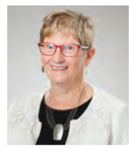
Rep. Virginia Court (D-Billings)