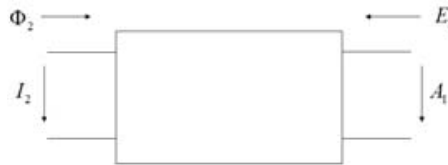
Fig. 3 The information transforms into a knowledge-based action and energy flow.

cars' flows). There are many possibilities, but we expected that the model \Phi_2, \mathbf{I}_2 has recommended to us the best variant 5 of how to optimize (Fig. 3) the saved energy flow E_1 (minimum air pollution, minimal cars' stops, maximal speed of traffic flow, etc.) of the urban area.