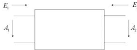
Fig. 4 The model of changes on the side of the real system.

The model transforms the original values E_1, A_1 into the new ones E_2, A_2 .