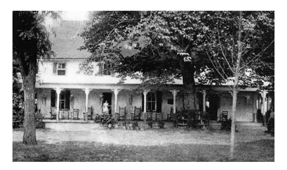
View of Marshall Hall, c.1900.

Today the 18<sup>th</sup> century Marshall Hall estate defines the southern boundary of the Piscataway Park historic district. The estate contains the ruins of the Marshall Hall mansion. The Marshall Hall mansion is notable as the largest dwelling in southern Maryland known to date before 1740 and historically included many "high-style" features that are the earliest datable examples recorded in Maryland. It was also associated with the Marshall family, one of southern Maryland's most socially prominent and affluent families during the colonial, early republic, and antebellum periods. Because of its historic significance, Marshall Hall was listed in the National Register of Historic Places (NRHP) in 1976.<sup>60</sup>