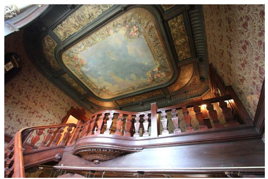
Image 5: Stairs, landing, and trompe l'oeil (di sotto in sù) ceiling of the upper level of the Koberwitz Chateau.

The full text of Steiner's Agriculture Course is available free from the Rudolf Steiner Archive at: <a href="http://www.rsarchive.org/">http://www.rsarchive.org/</a>