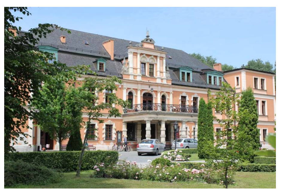
Image 1: The Chateau at Koberwitz, venue for Steiner's Agriculture Course, with the main entrance in the centre and the vestibule entrance on left.

Koberwitz can fairly be regarded as the birthplace of biodynamic agriculture. Rudolf Steiner delivered eight lectures there in German in the summer of 1924 (7-16 June). There were 111 attendees listed, 30 women and 81 men, who came from six countries: Germany, Poland, Austria, Switzerland, France, and Sweden. The audience included farmers, estate managers, doctors, priests, teachers, artists, and engineers who all came to hear Steiner's vision for agriculture (Paull, 2011a).