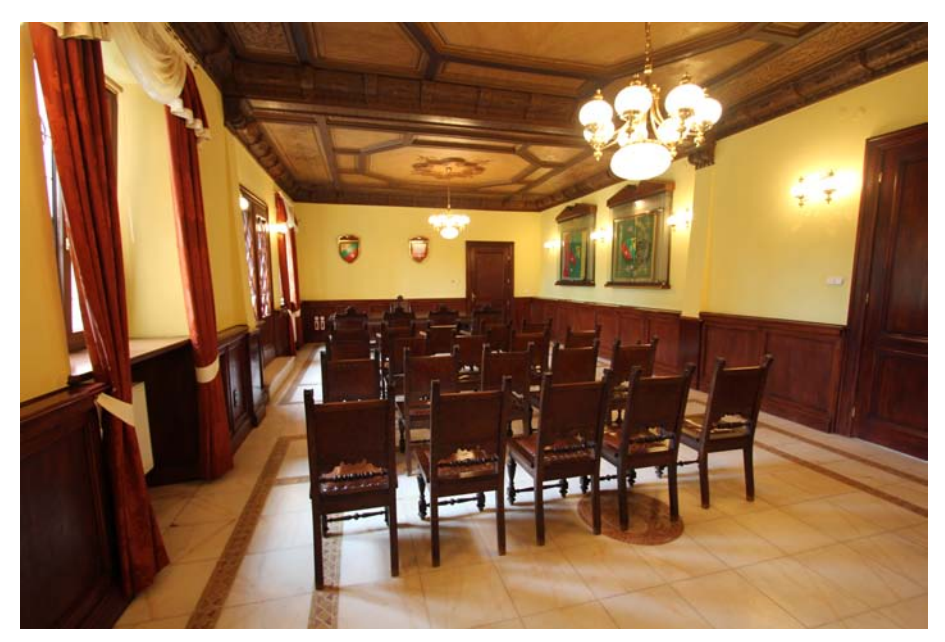
Image 2: The meeting room of the Koberwitz Chateau with the door to the vestibule on the right.

Of the course location, Steiner wrote: "Count Carl Keyserlingk manages a large agricultural estate on model lines ... It seemed only natural to speak about agriculture just there, where those who had assembled for the meetings were surrounded on every hand with the things and processes to which allusion was being made. This gives tone and colour to such a gathering" (1924b, p.9).