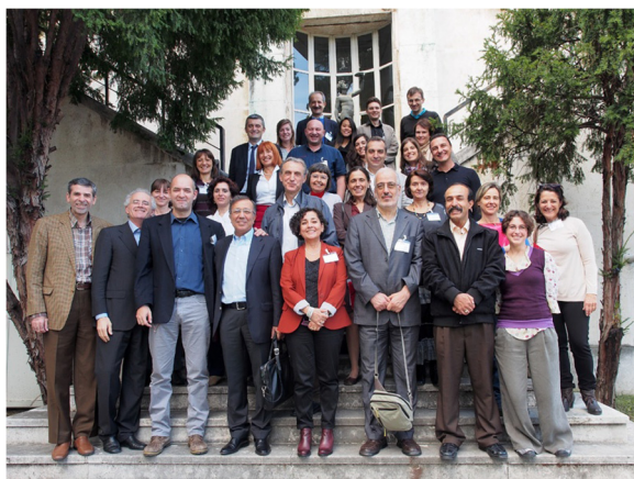
Fig. 2 The participants of the European Register of Cystic Echinococcosis (ERCE). Representatives of the centres from 16 European and Asian countries (Albania, Austria, Bulgaria, France, Georgia, Greece, Hungary, Iran, Italy, Palestine, Poland, Romania, Serbia, The Netherlands, Spain and Turkey) at the official launch meeting on ERCE. The meeting was held at the Italian National Institute of Health (Istituto Superiore di Sanità, ISS) in Rome, Italy, between 12 and 13 November 2015

ERCE is a single multicentre database located within the secured IT network of ISS, in Rome, where patient data, including demographic information, CE-related clinical