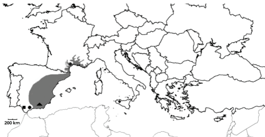
Fig. 10. Map of Europe showing the distribution of Buthus occitanus (dashed area) and the type localities of the known species: B. elongatus (circle); B. ibericus (square); B. kunti (asterisk); B. montanus (triangle); B. occitanus (cross potent); B. trinacrius sp. n. (rhombus).

We disregarded this hypothesis for two main reasons: a. The Sicilian new species is not co-specific to any known African population of Buthus from North Africa, and in particular to those distributed in Tunisia. To recall that most North African species of Buthus have recently been revised by the first author (Lourenço, 2003). b. If some scorpion species can ‘travel’ via human agency and create newborn colonies such as examples from the genera Isometrus , Centruroides and Euscorpius , others are only sporadically transported by humans. A few cases of transportation from Africa to Europe are detected every year, but to our knowledge they did not concern the species of Buthus , Androctonus or Leiurus . This is probably due to the low opportunistic capacity of the large species of these genera (Lourenço, 1991).