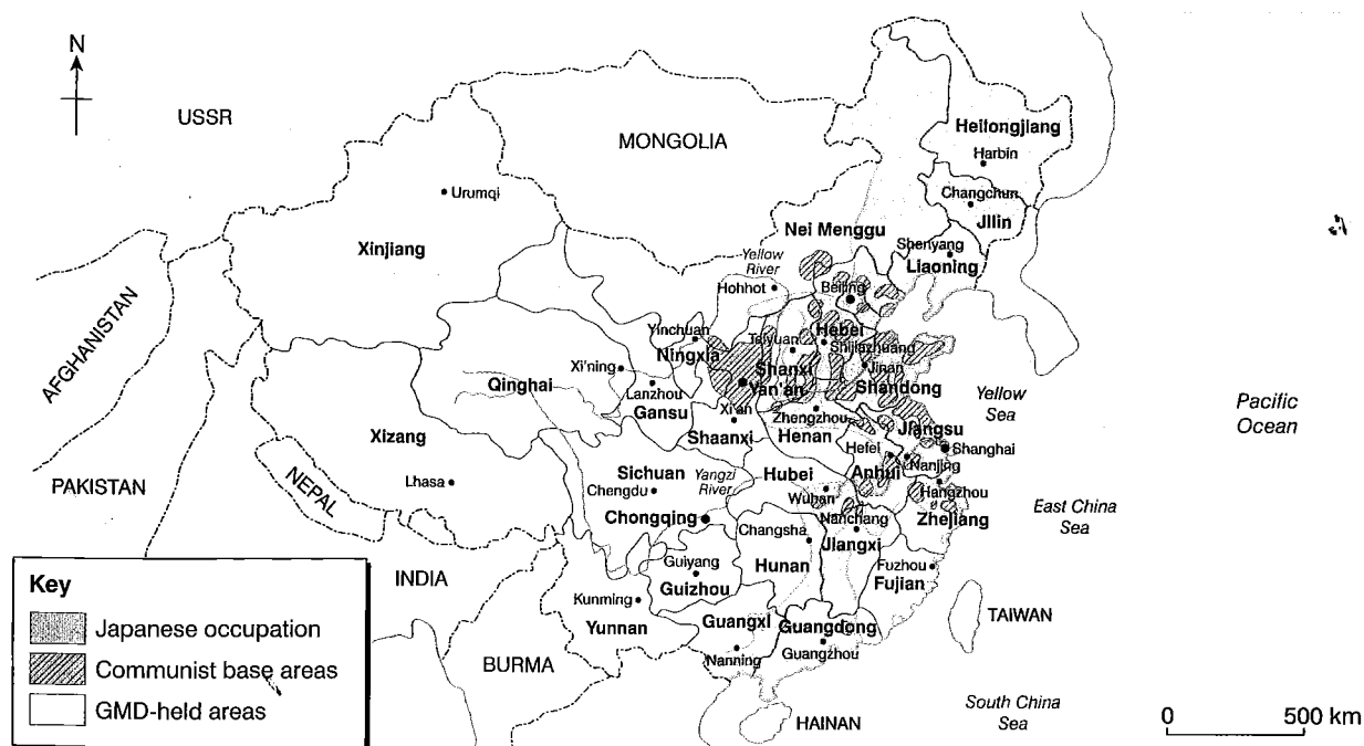
Fig. 2 The situation in China at the end of the Second World War

China is a vast country riven by major cultural and ethnic divisions. The challenge facing both Chiang Kai-shek and Mao Zedong was how to unite this huge territory under their own political system. The struggle to do so would create one of the bloodiest civil wars in history.