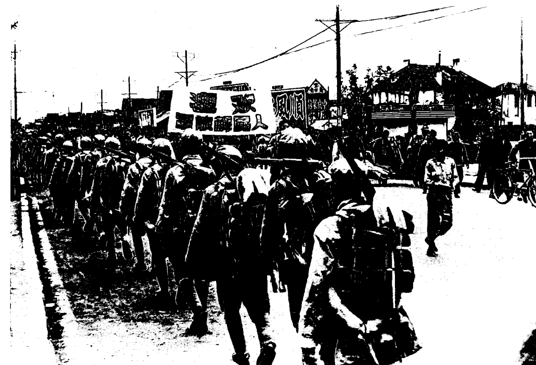
Fig. 9 PLA forces march into Nanjing in April 1949

After the capture of Wuhan in May, the PLA forces were divided for the final assault on GMD territory. One force, led by Peng Dehuai, struck westwards from Wuhan towards Xi'an and Lanzhou, both of which were taken in August 1949. Another PLA force led by Lin Biao marched south towards Guangzhou (Canton) which was captured in October, while part of Lin Biao's force was sent south-westwards to mop up the remaining GMD resistance in Guizhou and Chongqing, both of which were taken in November.