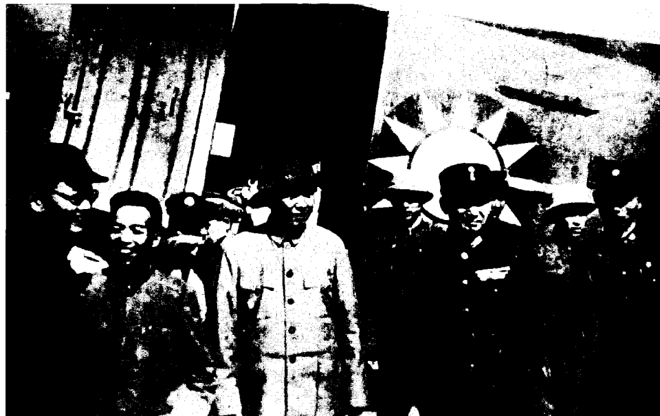
Fig. 5 Mao Zedong (centre) about to board his plane taking him back to Yan'an in October 1945, after peace talks in Chongqing with Chiang Kai-shek