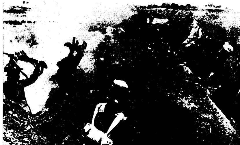
Fig. 1 Guomindang soldiers surrender to communist forces during the Civil War