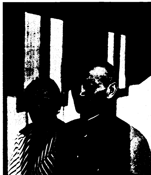
Fig. 4 The Guomindang leader, Chiang Kai-shek, with his wife

Which of the two sides in China's internal conflict, the Nationalists or the Communists, had gained the most from the war against the Japanese?