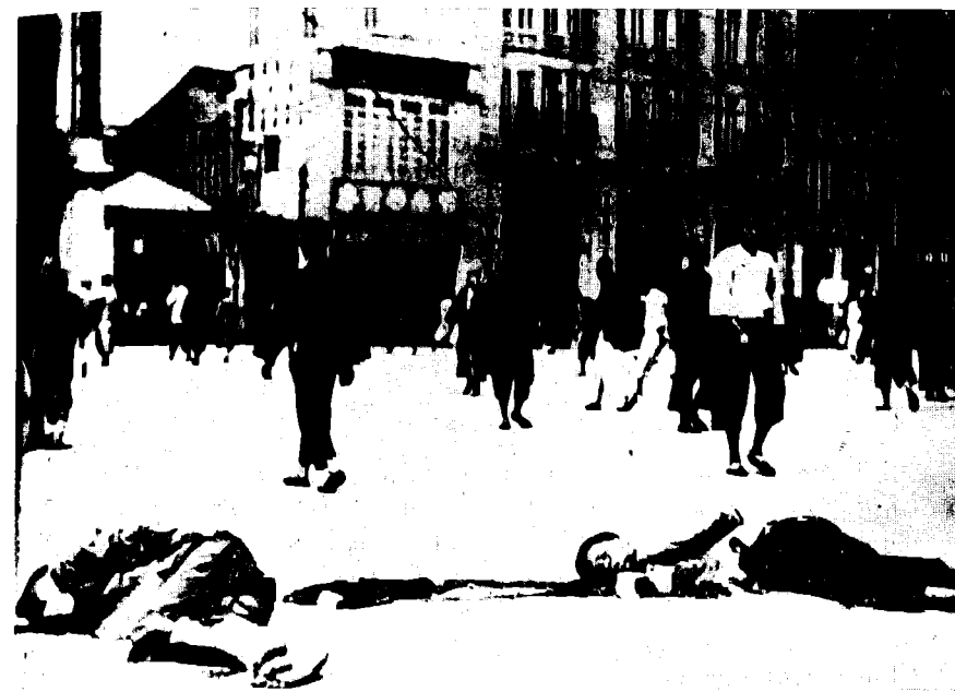
Fig. 3 Dead and wounded Chinese lie in the street after fighting between Guomindang and communist forces in Guangzhou, 1927

The Chinese Civil War, which began in 1946 as a struggle for control of China, had its roots in the conflict between Communists and Nationalists that had begun in 1927. Throughout the years 1927–37, the nationalist government of Chiang Kai-shek had tried to eradicate the Communist Party and impose one-party rule on the whole of China. By 1937, after the episode of the Long March, the Communists were confined largely to the area around Yan'an. The Japanese invasion of parts of China in 1937 led to a temporary cessation of hostilities between the Nationalists and the Communists, who formed a United Front against the invaders. Chiang Kai-shek, however, was still unwilling to accept the Communists as partners in the struggle against the Japanese. In 1941, Chiang's NRA forces launched an attack against communist forces in the south of China, thereby breaching the United Front. Despite this being a military setback for the Communists, politically they gained from this incident. Their propaganda was able to portray Chiang as being more interested in fighting his fellow Chinese and thus dividing the nation, whereas the Communists were able to present themselves as the true Chinese patriots in concentrating on the fight against the Japanese. The stage was set for a full-scale renewal of hostilities between the two forces once the war against Japan was over.