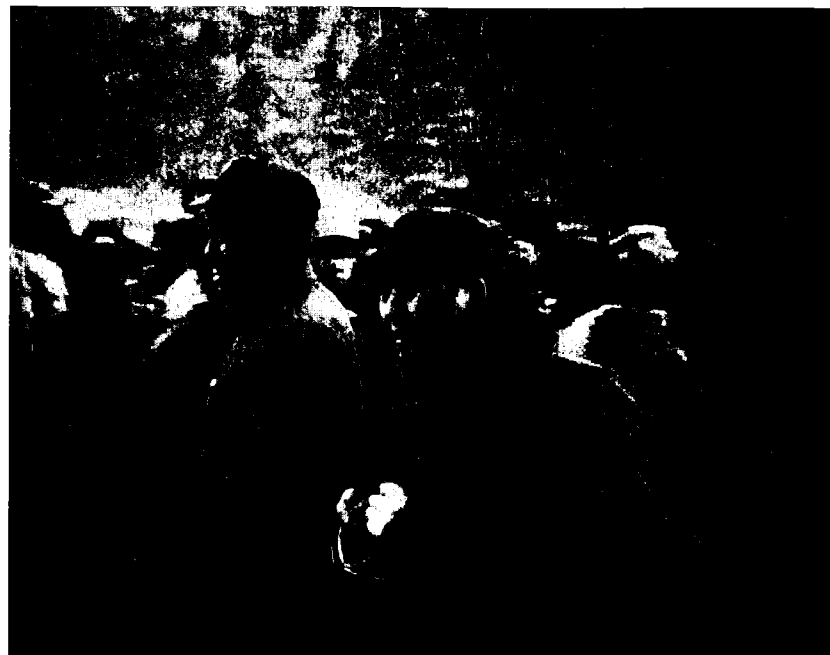
Fig. 6 Mao Zedong (right) attends a military strategy conference in December 1946