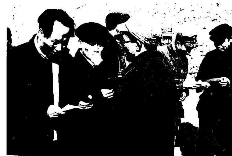
Fig. 1 Mao Zedong (left) and other leading communists at the Seventh Party Congress of the CPC in 1945

Table 1 shows that, at the end of the Second World War, the nationalist forces in China had an overwhelming advantage over the Communists in both numbers of troops and equipment. You should note also that the Nationalists had an air force with aircraft supplied by their American allies whereas the Communists had no aircraft. The communist forces were concentrated in 19 base areas including their main base in Yan'an, over the country as a whole the CPC ruled over some 90 million people in a country of about 600 million. During the course of 1945 and early 1946, nationalist forces drove the Communists out of most of their base areas. From a military point of view, therefore, it appeared that the Nationalists had the best chance of winning the Civil War. There were, however, a number of political and military factors that strengthened the Communists' position.