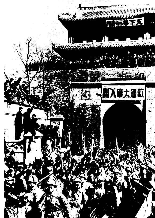
Fig. 8 After the PLA's victory in Manchuria in autumn 1948, PLA forces began to move south into northern China. In this photograph, a PLA force is seen marching through the Great Wall at Shanhaiguan