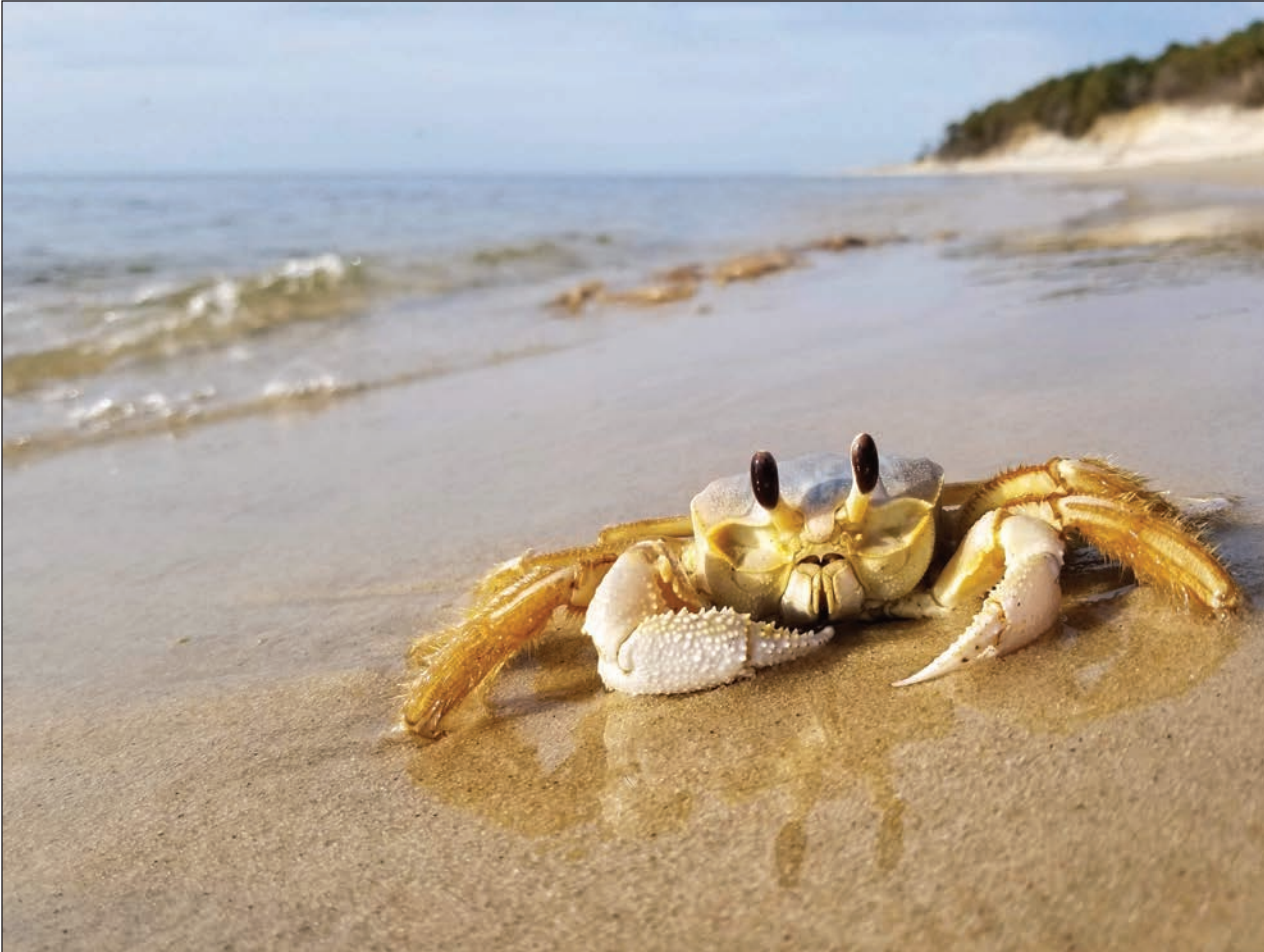
Photo Credit: Such a Fine Fellow by Kevin Divins of Henrico | Courtesy of Scenic Virginia

within 24 hours of the spill. DEQ was then only required to notify the public via a local newspaper if they determined the discharge could be detrimental to use of state waters. Beyond that, there was no time period within which spill information must be made public.