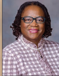
Sen. Mamie Locke