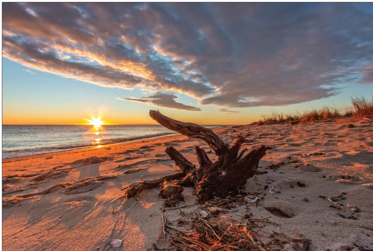
Sunrise at Bethel Beach