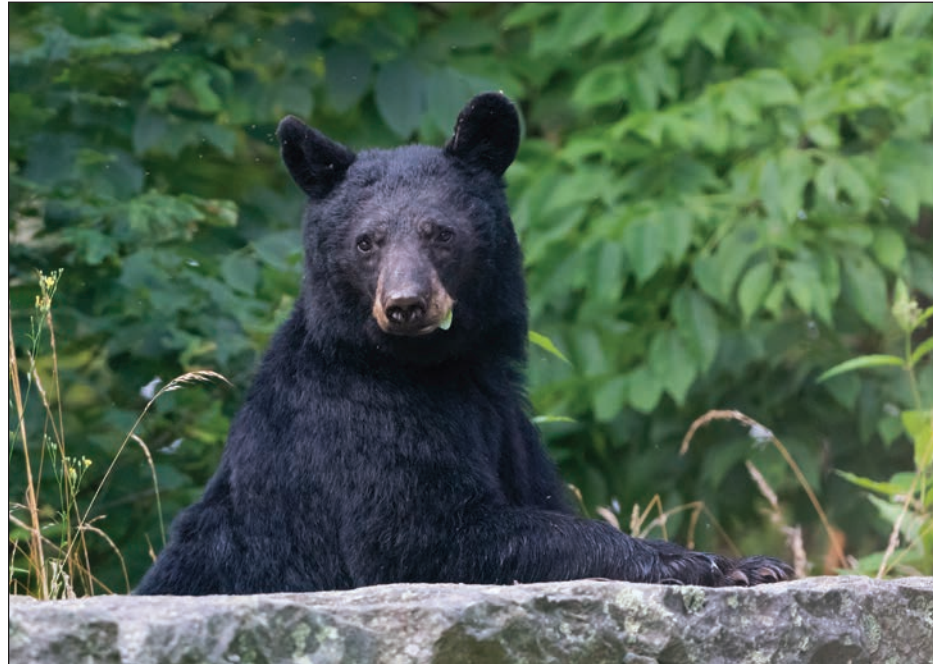
Photo Credit: Watchful Mother Bear by Matthew Huntley of Fredericksburg | Courtesy of Scenic Virginia

The legislation passed 55-42 in the House of Delegates and 23-17 in the Senate.