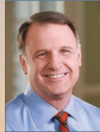
Sen. Creigh Deeds