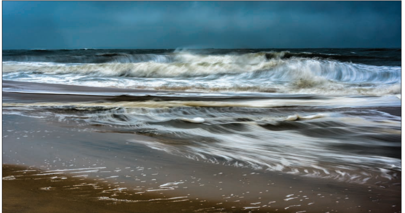
Photo Credit: Hurricane Jose Offshore at Chincoteague by Anne Bell Scott of Charlottesville | Courtesy of Scenic Virginia

The legislation gets us to the 100 percent clean energy benchmark by requiring utility investments in energy efficiency programs first, instead of expensive infrastructure; aggressive benchmarks for utility deployed wind and solar