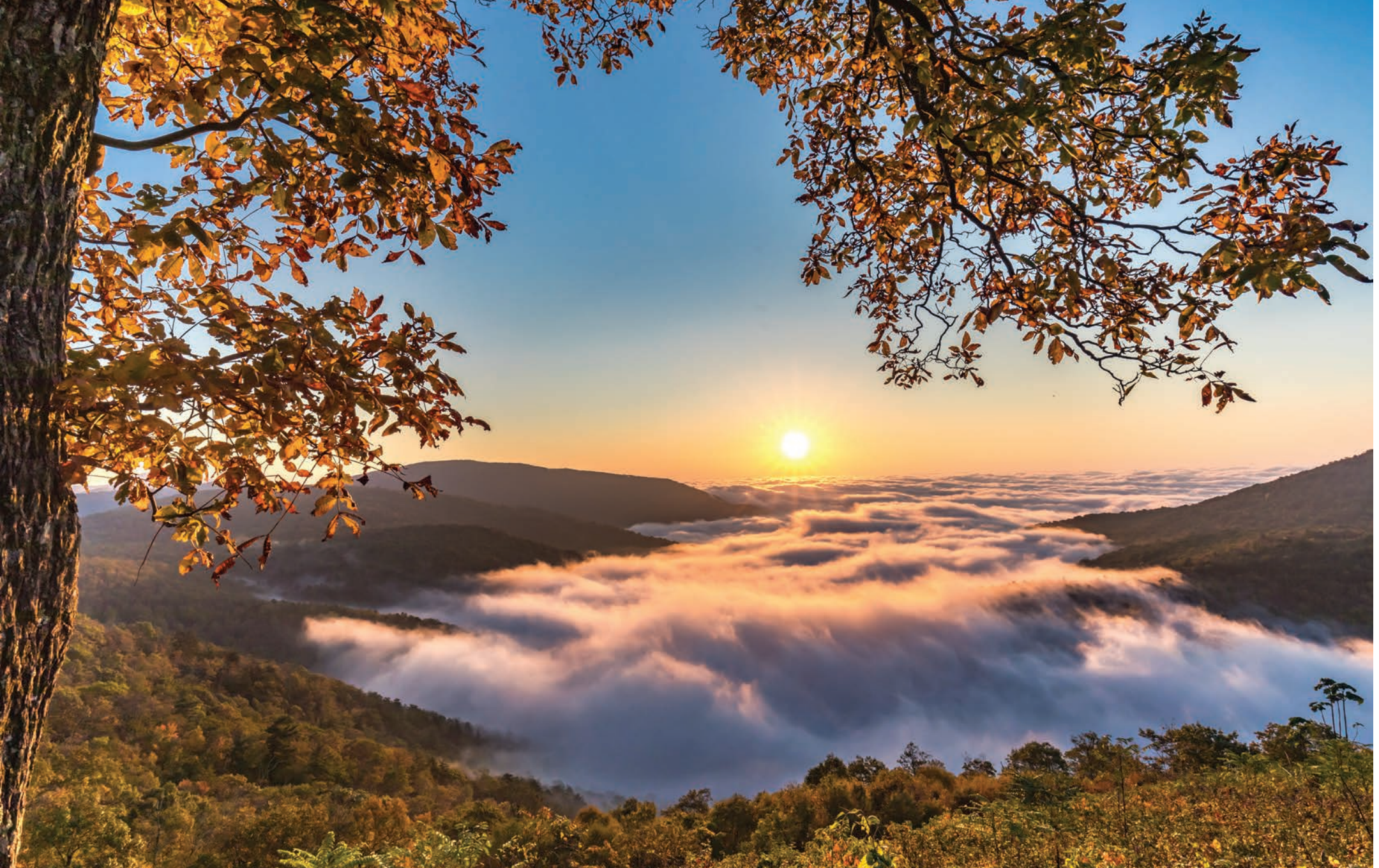
Photo Credit: Sunrise over Fog in the Shenandoah by Thomas Hennessy of Mechanicsville | Courtesy of Scenic Virginia

The Virginia League of Conservation Voters is the political voice of conservation in the Commonwealth. We work tirelessly to protect all of Virginia's treasured natural resources – clean air and water, thriving communities and rural landscapes, productive farms and forests, historic battlefields and Main Streets, and ample public lands and open spaces.