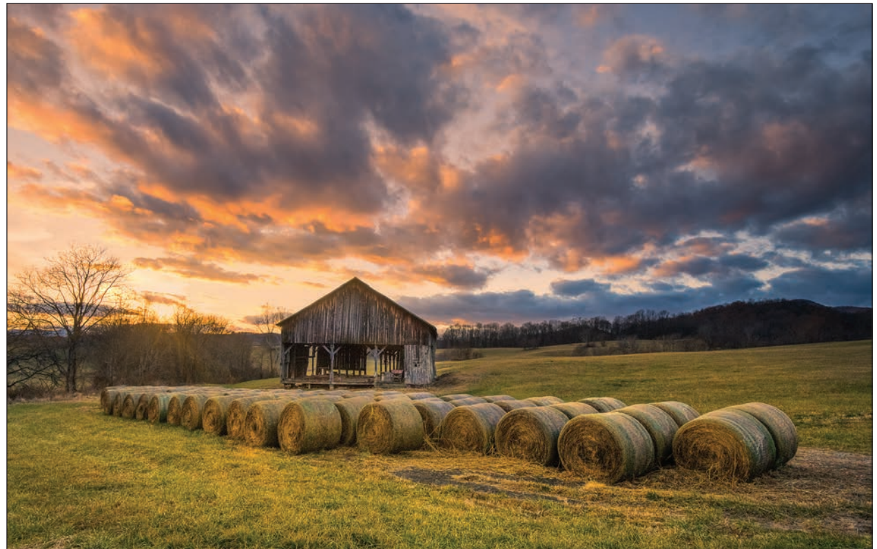
Photo Credit: Old Barn Sunset by Robert Golub of Culpeper | Courtesy of Scenic Virginia

This legislation removes barriers to solar renewable energy and amends the Commonwealth Energy Policy to support distributed solar generation. These changes to the Commonwealth Energy Policy hope to promote solar energy by encouraging private sector investment in distributed renewable energy, supporting distributed renewable energy projects to increase security and reliability, and supporting landowners' right to generate their own renewable energy. The included reforms give local governments more opportunities to install solar on government property and help residents and businesses invest in solar. This can create savings for taxpayers, decrease the need for fossil fuels, help meet local sustainability goals, ensure access to solar by low-income apartment tenants, and support local jobs and economic development.