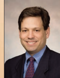
Sen. Scott Surovell