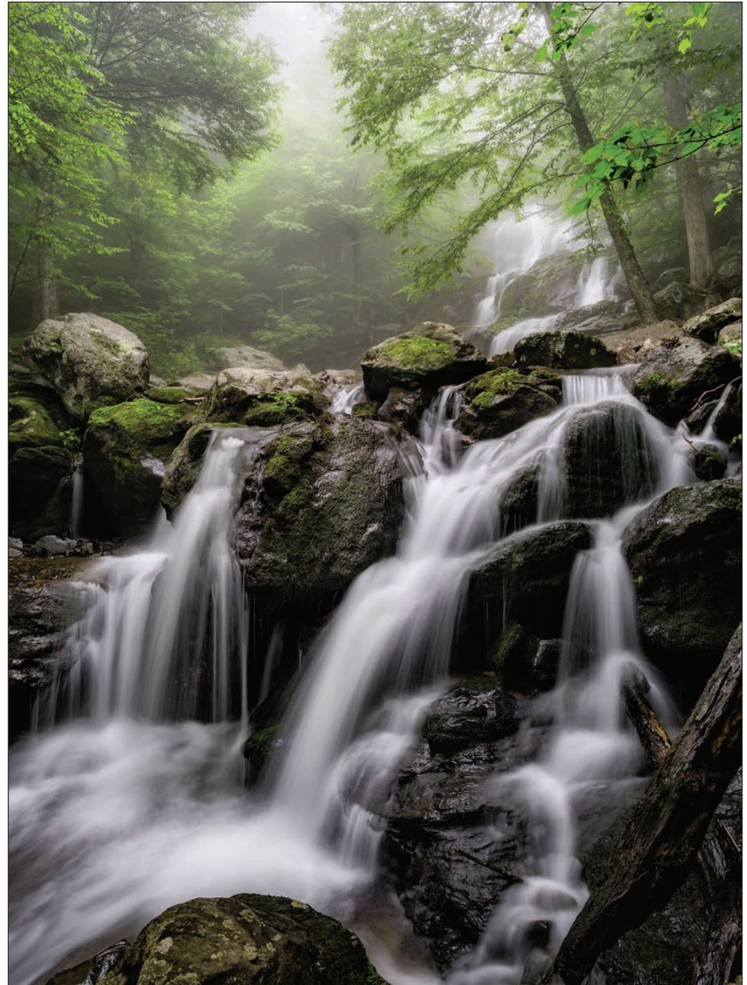
Dark Hollow Falls