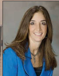
Del. Eileen Filler-Corn