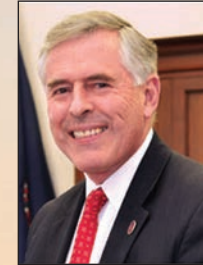
Sen. John Edwards