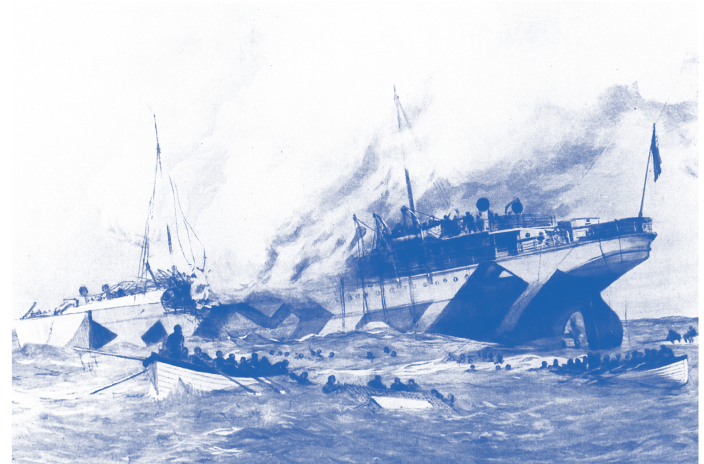
'A contemporary drawing showing the sinking of the RMS Leinster. Reproduced as the cover for Torpedoed! The RMS Leinster Disaster by Philip Lecane.'

Venue: Dublin's Pro-Cathedral, Marlborough Street, Dublin 1 at 11:00