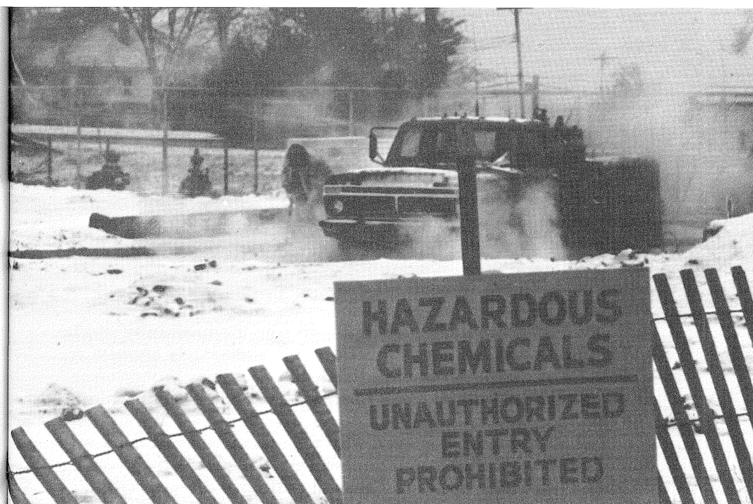
After dioxin was found, the state ordered all vehicles to be washed before leaving the construction area.

The first meeting we had with the state after the February 8 order