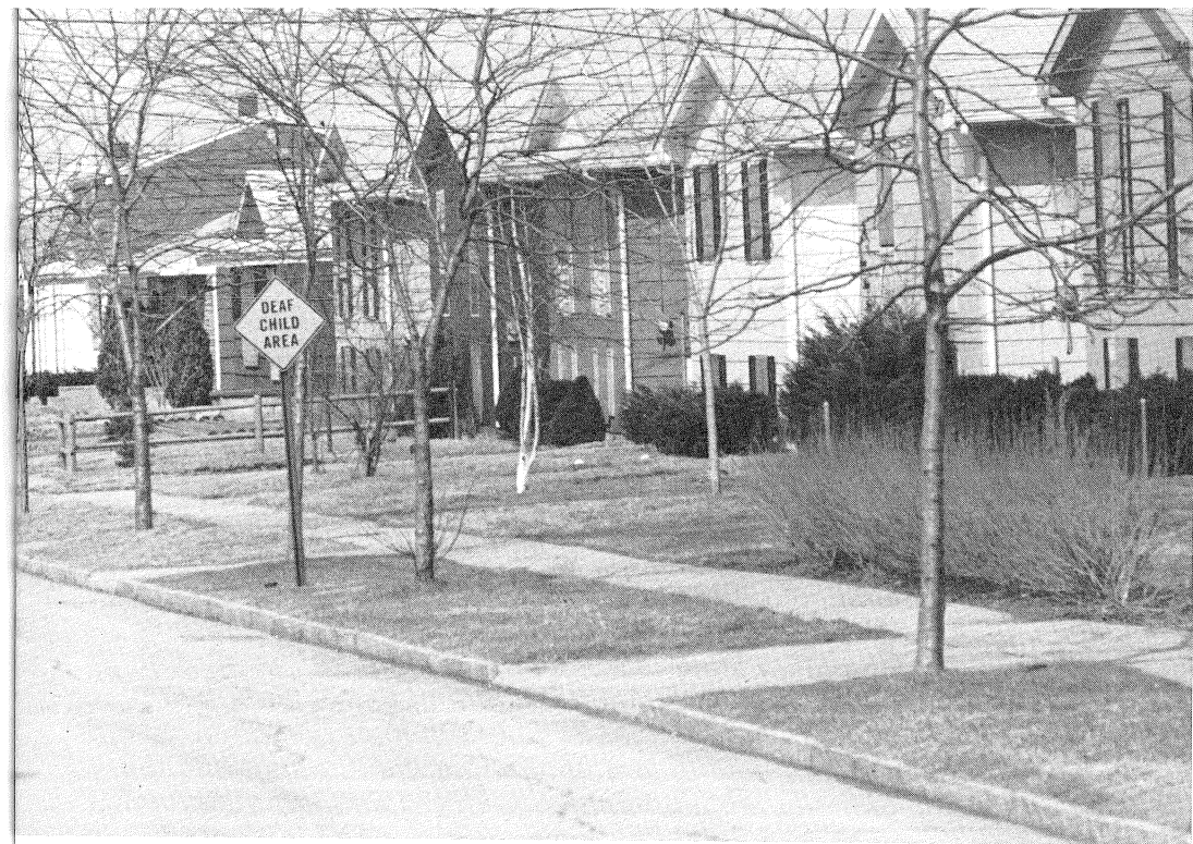
Deaf Child Area—a sign in the Love Canal neighborhood indicates one of many kinds of birth defects resulting from contamination.