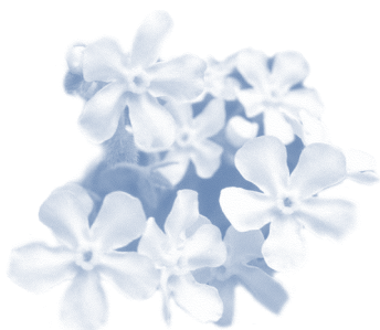
Hackelia venusta , Showy Stickseed U.S. ESA: Endangered

Information on the genetics and population biology of rare plants and their relation to conservation is available on the Center for Plant Conservation website, www.centerforplantconservation.org