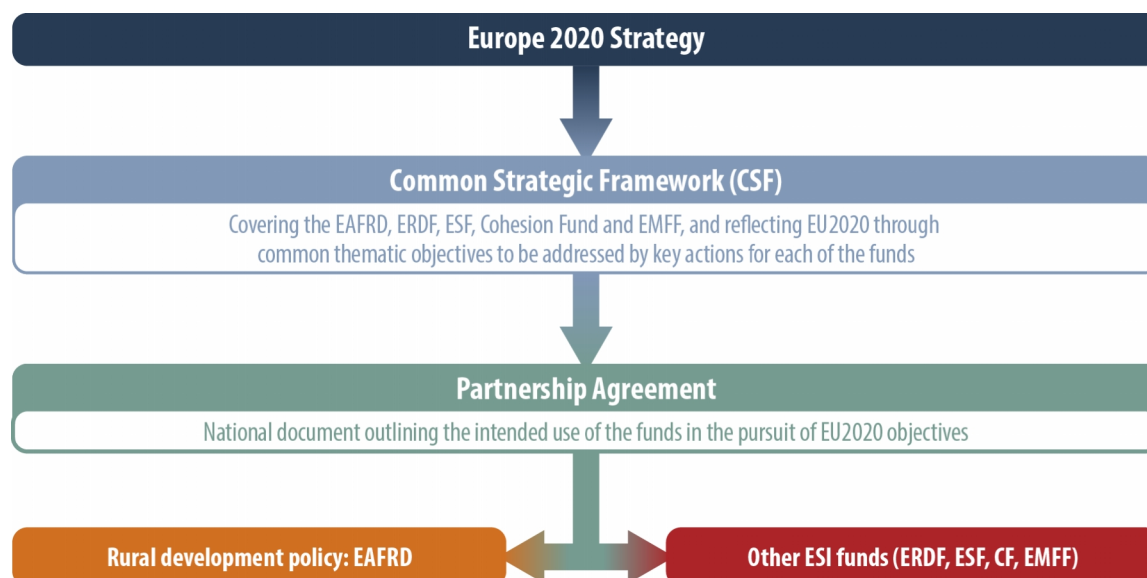
Figure 2 – Common strategic framework for the 2014-2020 programming period

The importance of integrated territorial development to which rural-urban partnerships are contributing, is generally reflected in the integration of the five ESI funds (see box 1 above) within the common strategic framework. The EAFRD (supporting rural development), the ERDF (supporting, inter alia, urban development) and the three remaining funds are now governed by a single set of rules (the Common Provisions Regulation , CPR) which ensures improved coordination and harmonisation in terms of implementation to maximise the impact of investments.