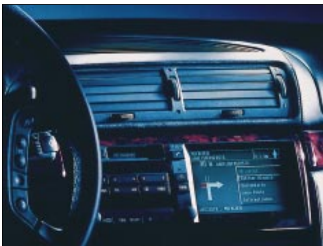
Originally conceived as a navigational tool for the military, the Global Positioning System has spawned many commercial applications in an industry that some predict will reach $30 billion in annual revenues in the next decade: here, a built-in locator device for automobiles.

The press would hail O’Grady as a hero, and O’Grady himself would give credit and thanks to the Marines who “risked their lives to get me out.” But another factor allowed the Marines to perform their crucial role in the rescue operation with surgical precision. When O’Grady had gone down, his life vest contained a portable radio receiver tuned in to a network of 24 satellites known as the Global Positioning System (GPS). O’Grady was able to determine his position behind enemy lines—longitude, latitude, and altitude—to within a few hundred feet, and he was then able to signal that position to the Air Force fliers overhead and to the Marines who were sent in to rescue him. One cannot help wondering whether O’Grady and his rescuers knew that some of the technology that made this