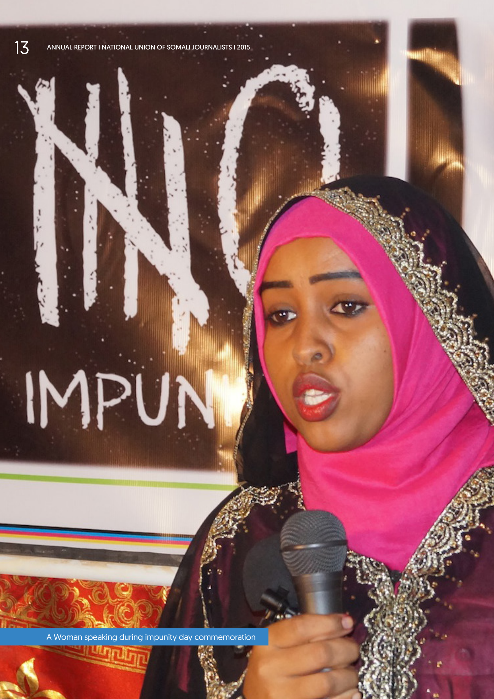
A Woman speaking during impunity day commemoration