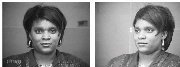
Figure 1. Frontal and 30-degree to the side views available in CMU-Pittsburgh AU-Coded Facial Expression Database.

apex and not from beginning to end, we are performing additional coding. We also are increasing the number of action units that have been coded for intensity.