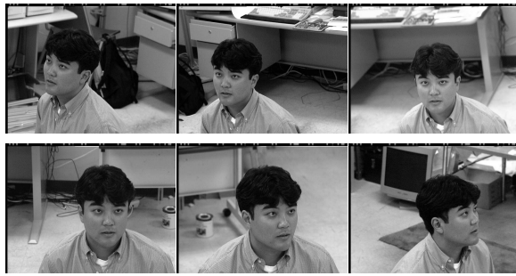
Figure 4. Face images obtained from omniview camera. (6 images are shown here out of 50 that were available).

characteristics, and relation to other non-verbal behavior. Development of robust methods of facial expression analysis requires access to databases that adequately sample from this problem space. The CMU-Pittsburgh AU-Coded Facial Expression Image Database provides a valuable test-bed with which multiple approaches to facial expression analysis may be tested. In current and new work, we will further increase the generalizability of this database.