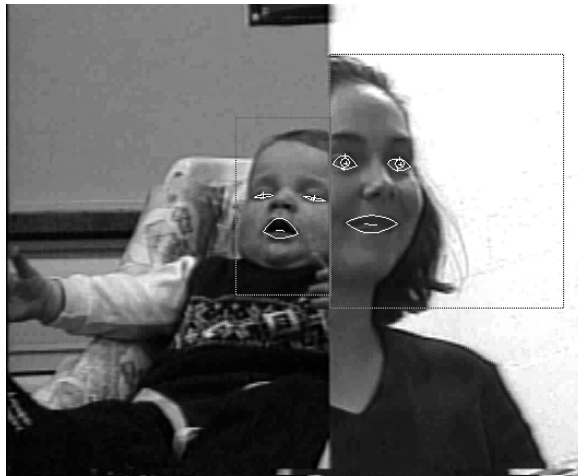
Figure 2. Automated face detection and facial-feature and eye tracking in image sequence obtained from synchronized cameras and split-screen generator.

One solution, which we are pursuing, is to examine our videotapes for instances of spontaneously occurring action units that occurred during the experimental session. We now have a large sample of spontaneous smiles (AU 12) and related action units (e.g., AU 6), and these will be added to the database.