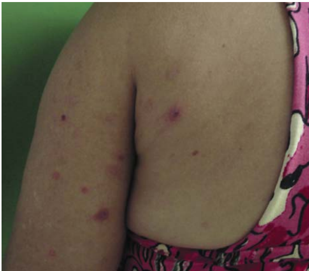
FIGURE 3: Dermatitis herpetiformis. Erythematous papules and urticarial plaques, vesicles with hemorrhagic content, denuded, exulcerated areas and scabs, with residual hypopigmentation on the back and upper limb

contain starch, lipids and proteins (gliadin, glutenin, albumin and globulin). Wheat protein specifically is composed of 68% gliadin and 32% glutamin, therefore it is commonly referred to as wheat gluten. Examples of food products that contain this protein are flour, chocolate milk, which contains malt, processed cheese, beer, whiskey, vodka, mustard, ketchup, mayonnaise and salami. 20,21