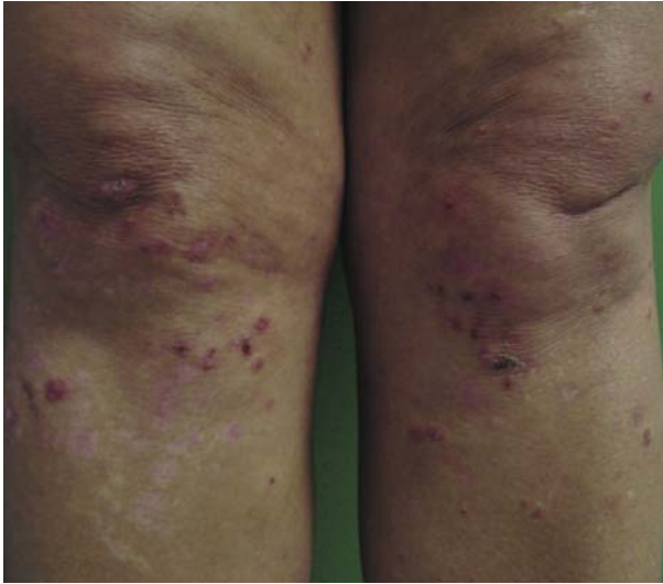
FIGURE 2: Dermatitis herpetiformis. Vesicles dissected with crusts and residual hypopigmented macules on the knees