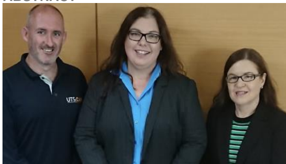
The CAIK Team, UTS