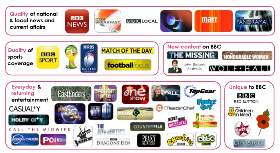
NB: the poppy icon refers to the BBC's Remembrance Sunday coverage

There was consistency in the types of TV that households missed across the waves. The content most often referenced included: