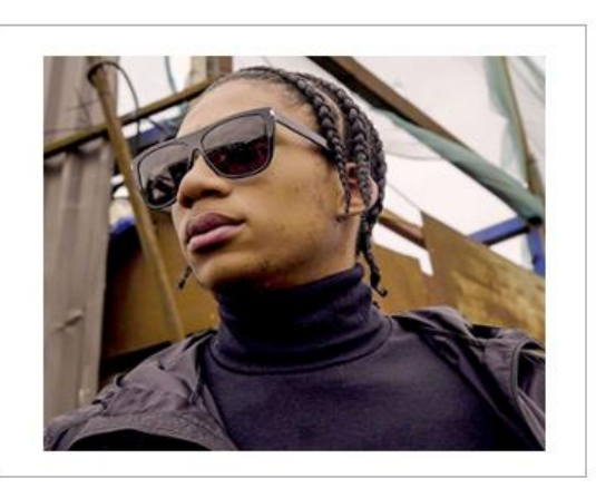
Maya Jama in Glow Up; Defending Digga D