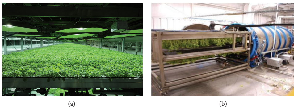
FIGURE 2: N. benthamiana plant growth (a) and agroinfiltration (b) at commercial production scale at Kentucky Bioprocessing LLC.

regardless of whether they were produced under scale-up conditions or with the desiccator [16–19]. This pilot-scale system has enabled us to produce the norovirus vaccine candidate under current good manufacturing practice (cGMP) regulations which is sufficient both in quality and quantity for a phase I human clinical trial [16, 20, 21]. Biotechnology companies have further explored the scalability of this method. For example, a fully automated vacuum system was developed with the capability to agroinfiltrate up to 1.2 tons of plant biomass per day, allowing for the production of up to 75 g of MAb-based therapeutics per greenhouse lot (Figure 2) [1, 15, 22]. This process can be further scaled up, but its requirement of inverting plants grown in pots or trays may impose limitations on the ways the plants can be cultivated and may confine the use of vacuum infiltration to high-value RPs, such as vaccines and therapeutics.