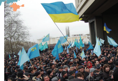
26 February 2014: Crimean Tatars stage huge rally against occupation of their native Crimea