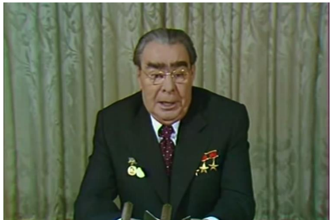
Brezhnev's 1979 address to Russia's youth. An example of ineffective television use by Soviet leadership

Russian politicians and academics did not know how to adopt the television personality, choosing instead to read off of a piece of paper and often covering their faces and hunching out of the frame. 92 They declared television ineffective because they were ineffective