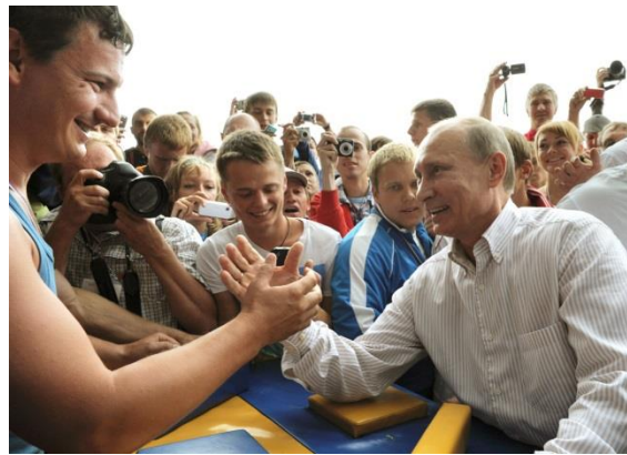
Putin arm wrestles Nashi member.

Another way that Nashi propagates Putin is by making him, not only a hero to its members, but a relatable father figure and friend. Putin is a regular speaker and guest at Nashi 's summer retreat in Seliger, where he does usual things that a head of state visiting a youth camp would do, such as speak, but also participates in some of the same events as Nashi members. Before Putin announced his candidacy for the 2011 election, he visited the