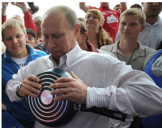
Putin attempts to bend a metal pan.

summer camp and participated in a strong-man like feats of strength, attempting to crush a metal frying pan with his own two hands. Later that same day, then Prime Minister Putin participated in an arm wrestling tournament 57 and climbed a rock wall. This clearly cultivates an image of