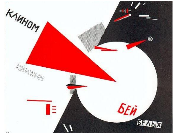
Figure 2. An example of futurist Plakati

In contrast to lubok , other artists tended towards the futurist side of artistic modernism, using impactful shapes instead of figures and choosing sharp and distinct images over realistic ones. Perhaps some of the most unique and impactful images from the revolutionary period were created by El Lissitzki, who seamlessly integrated modern art with propaganda (fig. 2, 1919). Figure 2 is, without a doubt, Lissitzki's most iconic poster. It reads "Beat the Whites with