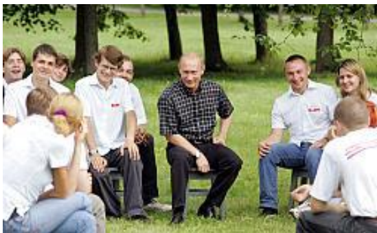
Putin with Nashi members in Zavidovo

Many of the advantages of modern television lie in the changing nature of Russian politics. Putin is much more effective at presenting the image of a powerful yet relatable leader, than Soviet Leaders. Modern Russian leadership has embraced television to present their views and, furthermore, understands what their viewers and their audience wants to see. In 2005,