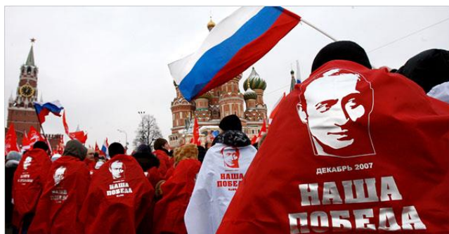
Nashi members celebrate Putin's victory.

Often times around elections, Putin or Medvedev's faces have been shown on banners, posters or even clothing during rallies and demonstrations.