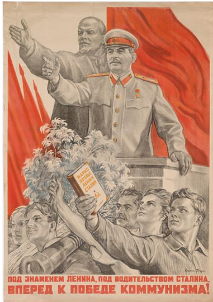
Figure 4, Retrieved from: theblaze.com

size of the flags and banners to the people. The people are simply a faceless mass. Dominating them are the flags and banners, symbols of the party itself. Obviously, though the Party and Lenin are one, the people are not as important as the Party itself.