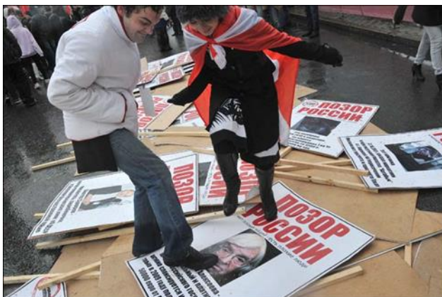
Nashi destroy the "Shame of Russia".

A way that Nashi indirectly propped up Putin's image is by attacking any real or