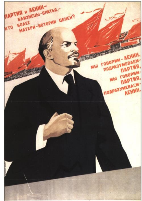
Figure 3, retrieved from: Sovietposters.com

While the posters of the USSR all focused on the issues of the time, whether that be the October Revolution in the late 1910's, World War II or even the atomic bomb in the 70's and 80's, an interesting feature of visual propaganda made in the style of socialist realism that did not survive past the thaw is its portrayal of the current leader as a symbol of the country itself. Though revolutionary propaganda often featured Lenin as a hero, it did not go so far as to equate him to, essentially, the god of