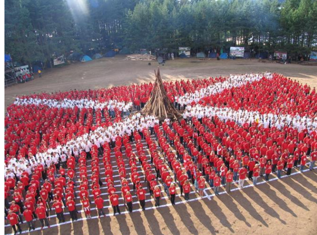
Nashi members gather for a picture and bonfire at their summer camp in Seliger.

way that proves their point, but neither the inherent bias nor the priming can be detected by the audience. If detected, the propaganda is highly ineffective. 55 Nashi makes absolutely no attempt to hide their manipulation of framing issues nor their unerring support of Putin, therefore, it must be inferred that they are not producing propaganda to convince others, but rather that the leaders of the group and those connected to Nashi in Putin's administration are using the group's actions to radicalize members of the group itself and produce lifelong supporters of the administration. Nashi not only cultivates Putin's cult of personality, but also creates a cult to Putin