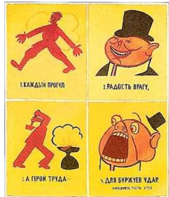
Figure 1, Lubok Plakati

Some modernist artists embraced lubok , the ancient Russian style of unrefined drawings with short text, sometimes even using ancient instead of modern Russian to caption their posters. Artists saw this as a way to easily connect themselves with the uneducated proletariat and call up the idea of the communists being part of the everyday common people. An example of this feature of modernist style is Mayakovski's multi-