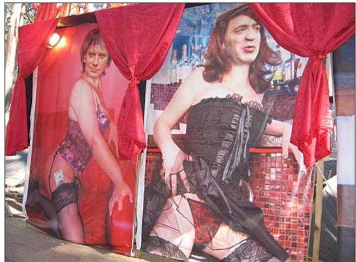
Kasparov and Kasyanov as political prostitutes.

This method of shaming was very common in Nashi . One year at camp Seliger, the group set up huge posters of opposition politicians cross-dressed in skimpy lingerie in a sort of "red light district. Among those mocked were opposition politician Gary Kasparov and former Prime Minister Mikhail Kasyanov who were deemed by Nashi political prostitutes for their beliefs. 63 Having events and displays such as these