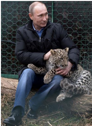
Putin as the brave, tender conservationist, Retrieved from: dailymail.co.uk

Television also shows Putin as a soft, tender, but ever masculine, man. Putin is also