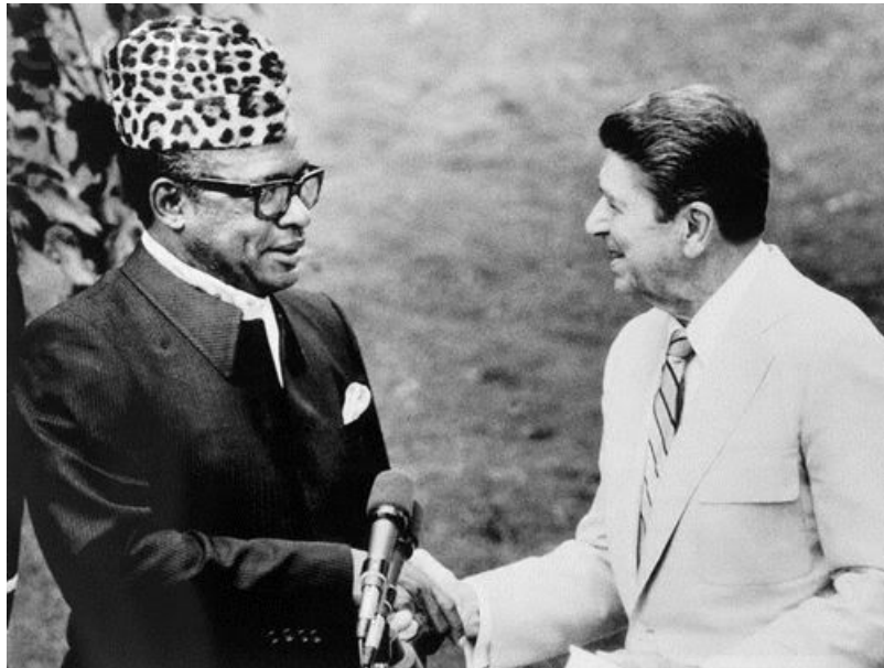
Figure 1 Western support for tyrant rulers: (a) Mobutu and (b) Bokassa

(a) For the US, Mobutu Sese Seko was a “friendly tyrant” and as far as the cold war is concerned, he was a reliable ally in Africa. As a reliable ally, it was necessary to saturate his tyrant ruling system with aid even though it never reached the poor Zairian people it was intended for. Visits to Washington were regular on his schedule and a series of US presidents including Ronald Reagan (photo) were amongst his foreign and Western “friends”.