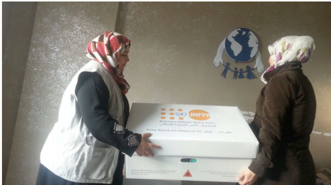
Distribution of mother's kits in Batman, Turkey.

Economic problems faced by Syrian refugees still hinder them from reaching or participating in activities.