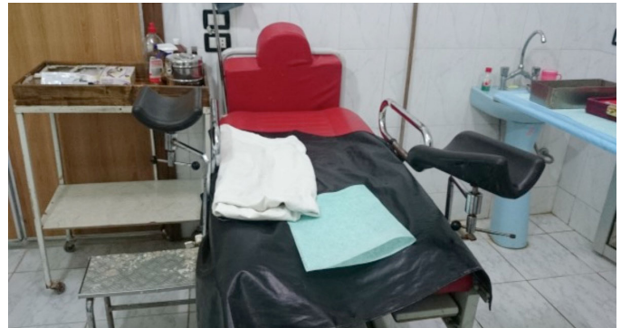
An operation room at a UNFPA-supported hospital in Homs