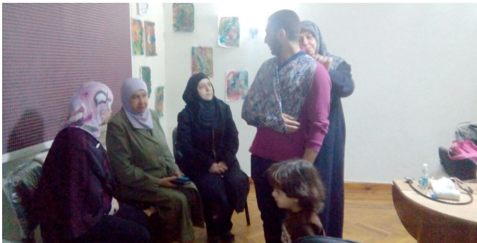
Women attend a "first aid" training organised in Giza women safe space, Egypt

"I can't describe how happy I am... you boosted my self-confidence, to an extent that my husband and my children felt that my happiness is reflected on them after I was desperate and sad," said one Syrian woman who attends activities at one of the women safe spaces in Egypt.