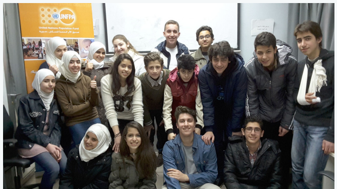
Participants in "Change Makers" initiative.

"According to studies, almost half of the routine jobs will disappear in the future. Young people should be aware of that to choose what they want to continue their education in," he added.