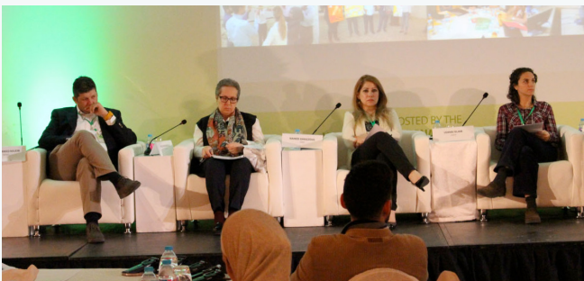
UNFPA Youth center presented in a panel titled 'Innovations from the Field'.