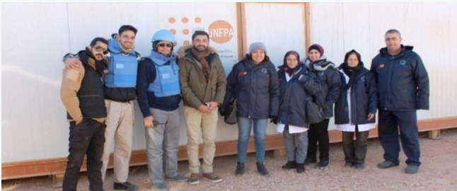
UNFPA supported clinic at the "berm" in no man's land between Jordan and Syria.