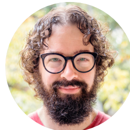
Michael Young Visiting Fellow