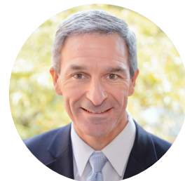
Ken Cuccinelli Senior Fellow for Immigration and Homeland Security