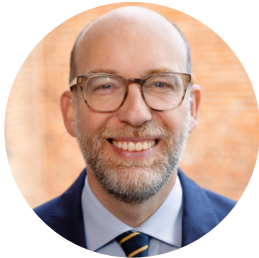
Russ Vought President