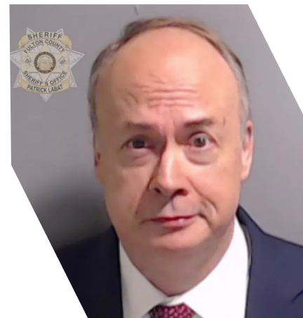
Jeffrey Clark's mugshot Fulton County Jail, GA

Jeff's work and expertise as a Constitutional lawyer at the Center in 2023 was also indispensable to our mission. In September, Jeff's primer, " Why The Fourteenth Amendment, Section 3 Does Not Bar Presidential Candidates from Running for the Presidency ," debunked cases made in Colorado, Maine, and numerous other states on eligibility to be on the presidential ballot. Additionally, his legal paradigm shifting paper, " The U.S. Justice Department Is Not Independent ," has caught the attention of the Left and laid important groundwork for the next conservative administration.