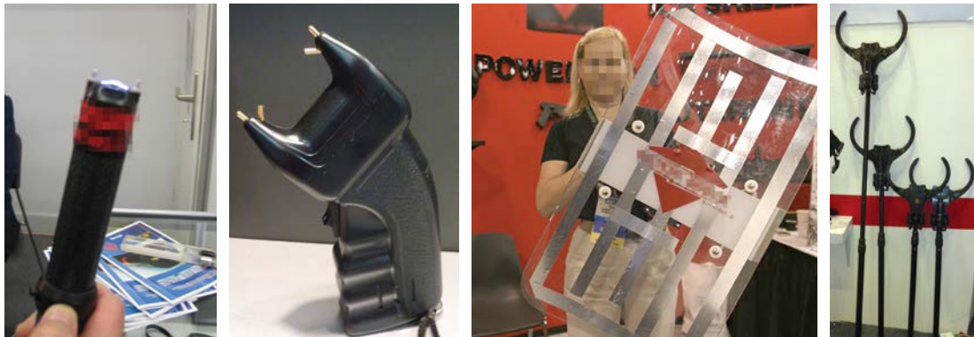
Images (from left to right) of an electric shock baton, electric shock stun gun, electric shock shield and electric shock grabbing device.

INCLUDING STUN GUNS, SHOCK BATONS, SHOCK SHIELDS