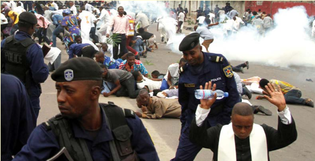
Riot policemen fire tear gas to disperse a Catholic priest and other demonstrators during a protest against President Joseph Kabila, organized by the Catholic church in Kinshasa, Democratic Republic of Congo 21 January 2018.

Between December 2017 and February 2018, the Lay Co-ordination Committee, a group affiliated to the Catholic Church, carried out peaceful protests once a month, after Sunday mass to demand the implementation of the 31 December 2016 Agreement 36 which provided confidence building measures including the opening of the civic space. Protests were held across the DRC on 31 December 2017, 21 January and 25 February 2018. These protests were met with brutal and systematic repression by the security forces. In many cases, the security forces did not engage in any dialogue with the protesters. In some instances, they blocked the parishioners' access to the church. Security forces used tear gas and live bullets against unarmed protesters. Fifteen peaceful protesters were killed, dozens were injured and many more arbitrarily arrested. 37