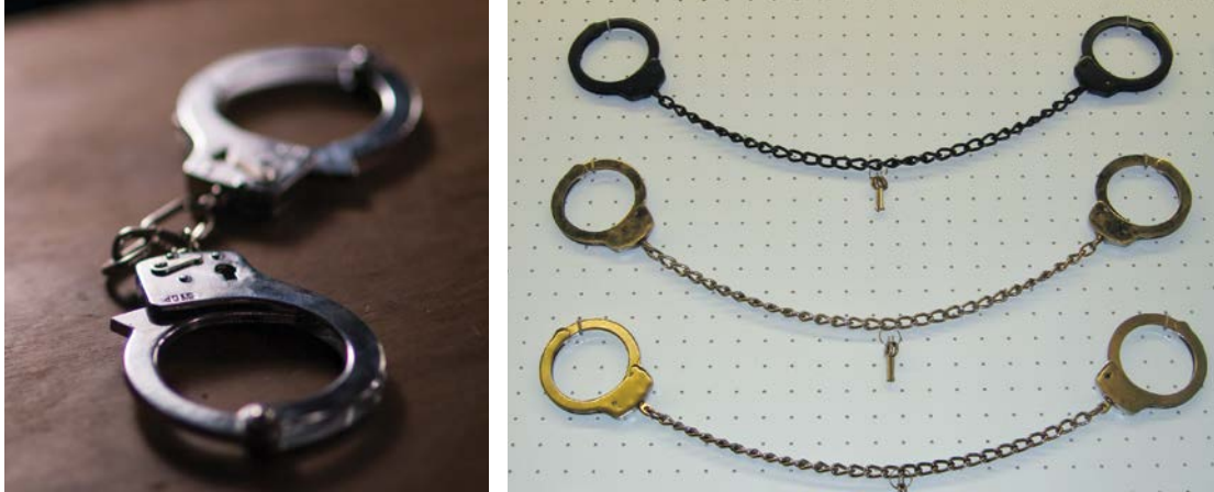
Image of standard handcuffs (left) and leg restraints (right) (both images© Robin Ballantyne/Omega Research Foundation).

One of the most common types of law enforcement equipment, mechanical restraints, are applied to the body to restrict the movement of an individual. If used appropriately, in conformity with international human rights law and standards, certain mechanical restraints such as ordinary handcuffs and leg cuffs can be legitimately used to ensure the safe detention and restraint of prisoners. The circumstances and limits within which these restraints are used should be consistent with international and regional human rights standards, notably but not exclusively, the Nelson Mandela Rules (see above). Whilst their use is common in law enforcement, UN and regional monitoring bodies, and anti-torture NGOs, have frequently documented the abuse of handcuffs and leg restraints to increase the level of suffering caused to individuals already under control, for example through excessive tightening; attachment to fixed objects; prolonged use; employment in suspension of prisoners; to place and maintain prisoners in stress positions; or used in conjunction with other means of force e.g. hand-held batons or pepper spray.