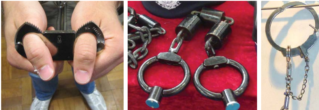
Images (from left to right) of thumb cuffs, weighted leg irons and neck restraint.

INCLUDING THUMB CUFFS, LEG IRONS, BAR FETTERS, NECK RESTRAINTS, WEIGHTED RESTRAINTS AND FIXED RESTRAINTS