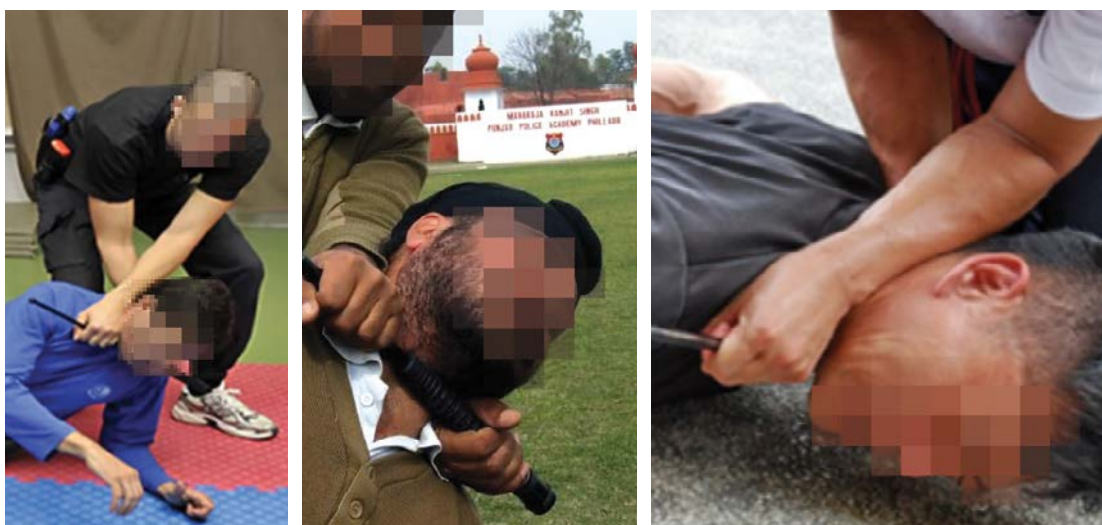
Images of training in the use of neck-hold baton technique, taken from a company website.

States should control the supply of technical assistance including instruction, advice, training and the transmission of working knowledge or skills that could aid the commission of torture and other ill-treatment. Such controls should ensure that the supply of technical assistance related to goods or working knowledge or skills which have no practical use other than for torture or other ill-treatment is prohibited. In addition, prior state authorisation should be required for any provision of training or other technical assistance relating to goods that have a legitimate law enforcement use but which could be abused for torture or ill-treatment or other human rights violations.