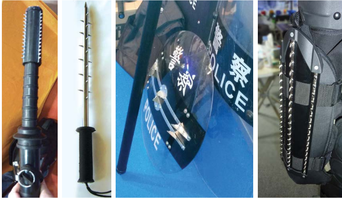
Images of spiked batons (far left and left), a spiked shield (centre), image of spiked arm armour (right)

INCLUDING SPIKED BATONS, SPIKED SHIELDS AND SPIKED ASSAULTIVE ARM ARMOUR; SJAMBOKS AND OTHER STRENGTHENED WHIPS; WEIGHTED GLOVES AND WEIGHTED BATONS