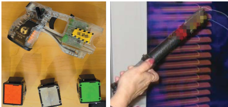
Images of projectile electric shock weapons (© Robin Ballantyne/Omega Research Foundation).

Projectile electric shock weapons fire darts – connected by electrical wires to the launch device – at an individual and can be used from a distance of several metres. The darts attach to a person’s body, delivering an incapacitating high-voltage electric shock that causes the subject to lose muscle control (neuro-muscular incapacitation). Projectile electric shock weapons should be strictly limited to “stand-off” situations where the only alternative is the use of lethal force or firearms when an officer is facing or trying to prevent an imminent threat of death or serious injury. Regulations should require officers to avoid additional shocks and prohibit continuous or simultaneous shocks with multiple weapons. Regulations should also prohibit the use of such weapons on subjects who are restrained, and on individuals who are more vulnerable, including children, the elderly, and pregnant women.