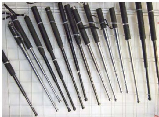
Image of range of batons.

INCLUDING BATONS, PLASTIC AND RUBBER BULLETS