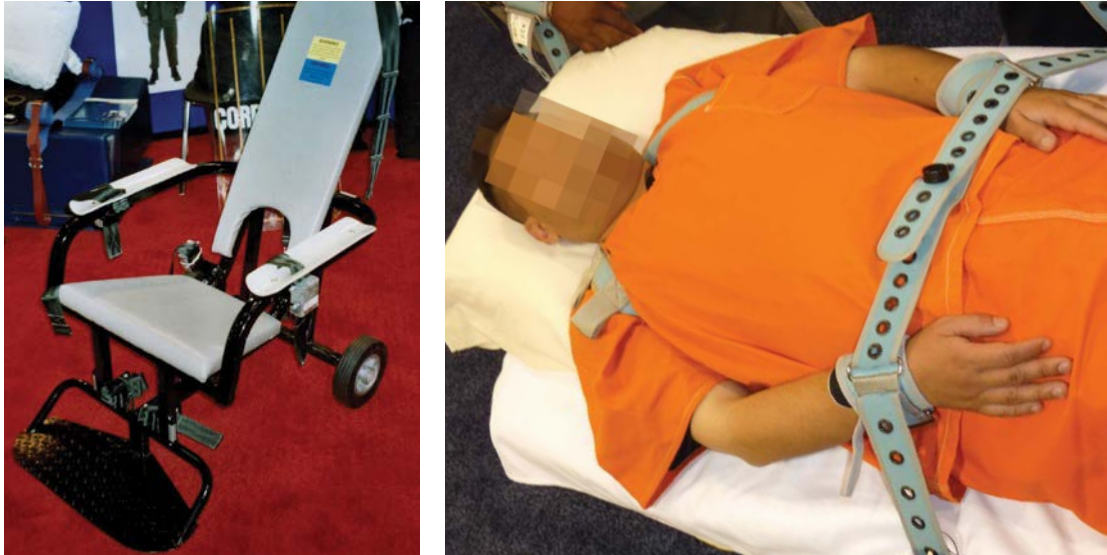
Images of restraint chair (left) and restraint bed (right) with fabric restraints.

INCLUDING RESTRAINT CHAIRS, SHACKLE BEDS OR SHACKLE BOARDS