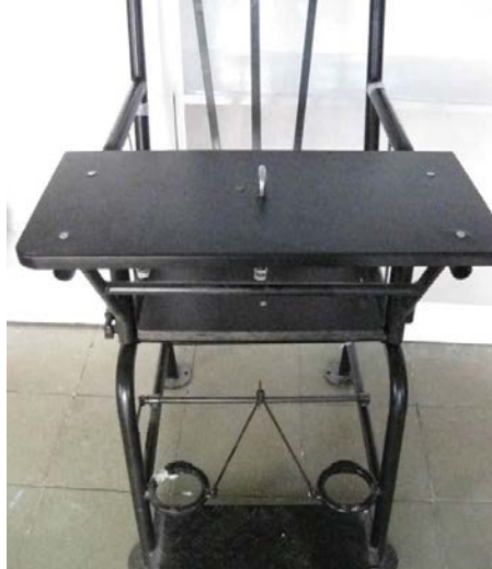
Images of restraint chairs with metal hand and foot restraints (© Robin Ballantyne/Omega Research Foundation).

Amnesty International and the Omega Research Foundation have documented the marketing of multi-point restraints, notably restraint or interrogation chairs, incorporating metal hand and foot shackles or other metal restraints. 19 Amnesty International has also documented the employment of similar devices in the torture of prisoners, notably in China. 20 The trade and use of all such inherently abusive equipment should be prohibited.