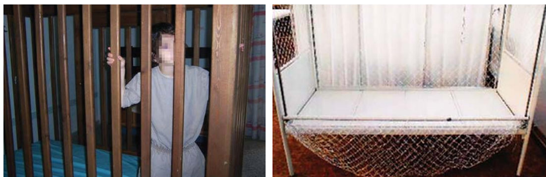
Image of cage bed (left); image of net bed (right).

Cage beds and net beds comprise a cage (four sides and a ceiling) or similar structure enclosing a human being within the confines of a bed, the ceiling or one or more of the sides of which are fitted with metal or other bars (in the case of cage beds) or fabric netting (in the case of net beds), and which can only be opened from outside. The Human Rights Committee, the expert UN body charged with overseeing the implementation of the International Covenant on Civil and Political Rights (ICCPR), has called for a cessation of the use of cage beds, and has stated that their use “is considered an inhuman and degrading treatment of patients confined in psychiatric and related institutions”. 15 The CPT in its revised standard-setting document of 2017 concerning “means of restraint in psychiatric establishments for adults”, stated that “the use of net (or cage) beds should be prohibited under all circumstances.” 16 Certain countries, notably the Czech Republic, have previously employed net beds in psychiatric institutions despite CPT reports 17 expressing serious misgivings about their use and calling for an end to such practices. 18