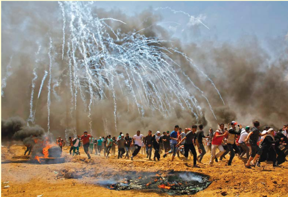
Palestinians run for cover from tear gas during clashes with Israeli security forces near the border between Israel and the Gaza Strip, east of Jabalia on May 14, 2018, as Palestinians protest over the inauguration of the US embassy following its controversial move to Jerusalem.

In response to protest during the “Great March of Return” in the Gaza Strip, from March 2018, Israeli forces employed tear gas, rubber bullets and live fire against the demonstrators resulting in deaths and thousands of injuries, including to children. Some 140 Palestinians, including at least 30 children, two journalists and three paramedics or health workers, have been killed by Israeli snipers and other soldiers during demonstrations in which people demanded their right to return and the end of Israel’s illegal blockade. According to preliminary statistics compiled by UN Office for the Coordination of Humanitarian Affairs, the cumulative number of injuries has exceeded 17,000. Of these, some 9,000 have been hospitalized, including 4,422 (47%) after they were hit with high-velocity military weapons and ammunition. Others have suffered from tear gas inhalation, or injuries caused by rubber-coated bullets. In addition to the use of standard hand-thrown or individual weapon-launched tear gas projectiles, the Israeli forces for the first time employed drones which flew above the crowds dropping tear gas projectiles onto the people below. Video footage of the protests shows how Israeli forces have used drones to fire tear gas cartridges at medical field tents 38 erected hundreds of meters away from the Israel/Gaza fence, journalists covering the protests, and peaceful protesters and crowds of bystanders. 39