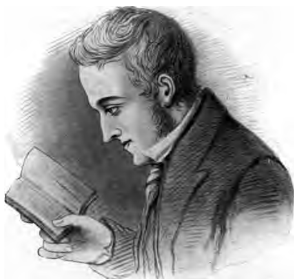
Arthur H. Hallam