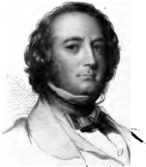
Richard Monckton Milnes