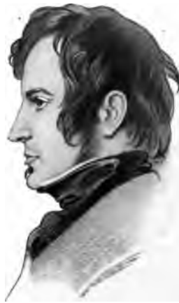
John Mitchell Kemble