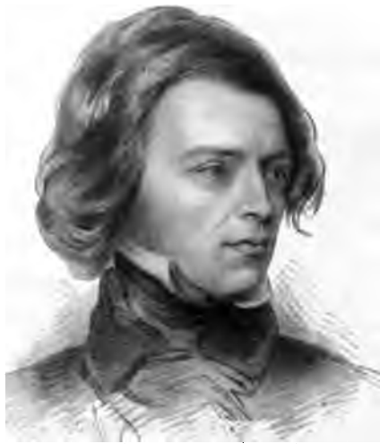
Alfred Tennyson From the portrait by Samuel Laurence