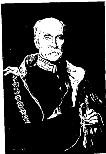
THE MARQUESS OF LANSDOWNE (FROM THE PAINTING BY P. A. DE LASZLO, H.R.B.A.)