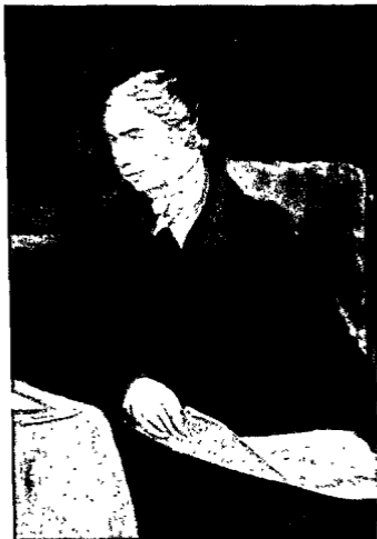
THE EARL OF ABERDLEN

(FROM THE PAINTING BY J. PARTRIDGE IN THE NATIONAL PORTRAIT GALLERY)