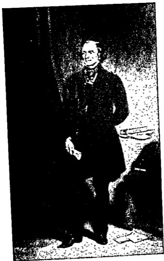
LORD JOHN RUSSELL (FROM THE PAINTING BY F. GRANT, R.A.)