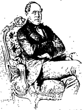
THE EARL OF CLARENDON (FROM THE LITHOGRAPH BY E. DESMAISSONS)