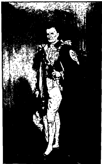
VISCOUNT GREY OF FALLODON (FROM THE PAINTING BY FIDDES WATT, R.S.A.)