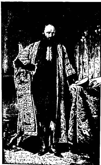
THE MARQUESS OF SALISBURY (FROM THE PAINTING BY GEORGE RICHMOND, R.A.)