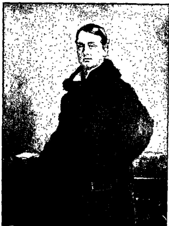
THE EARL OF ROSEBERY

(FROM THE PAINTING BY SIR JOHN EVERETT MILLAIS, F.R.A.)