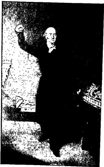
CANNING SPEAKING IN THE HOUSE OF COMMONS 12TH DECEMBER 1826

(FROM THE PORTRAIT BY SIR THOMAS LAWRENCE, P.R.A., IN THE NATIONAL PORTRAIT GALLERY)