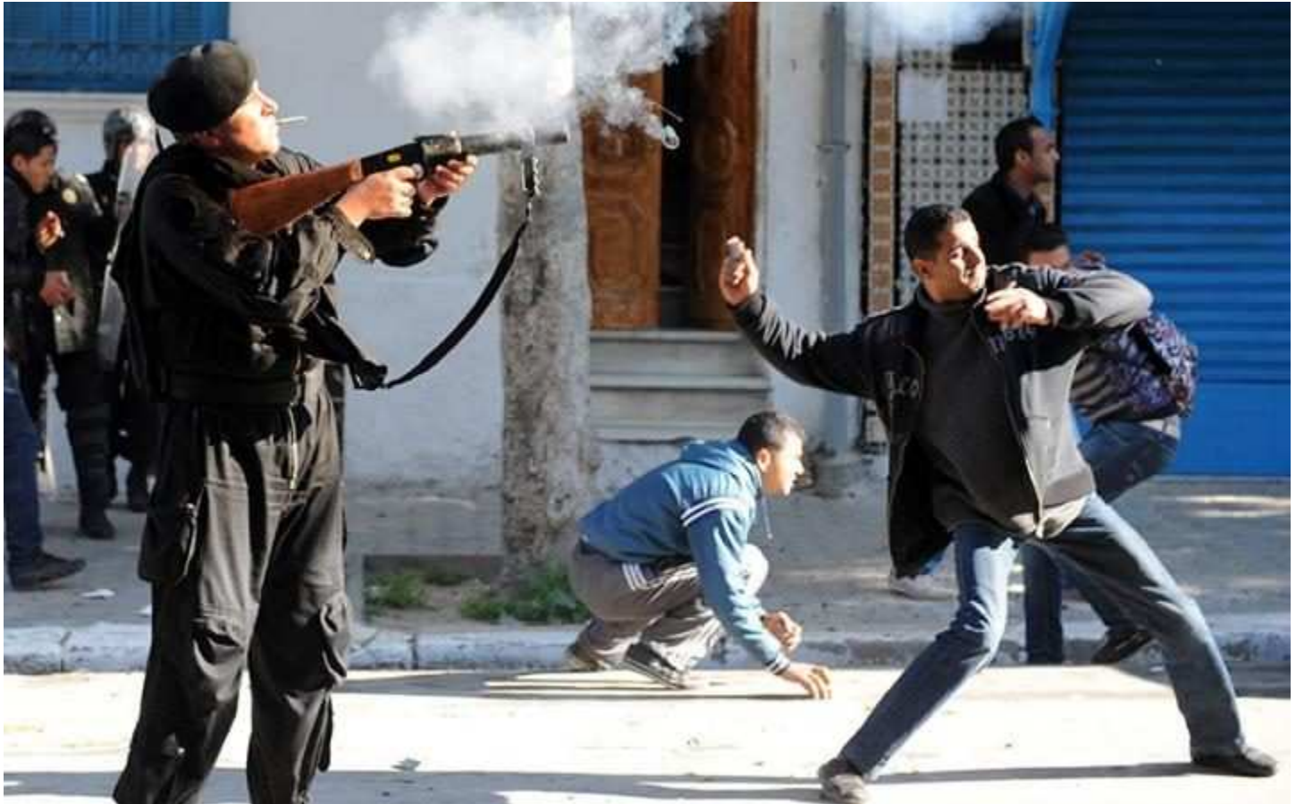
A Tunis resident throws a stone while a police officer shoots tear gas canister at residents from the central Tunisian region of Sidi Bouzid in January 2011