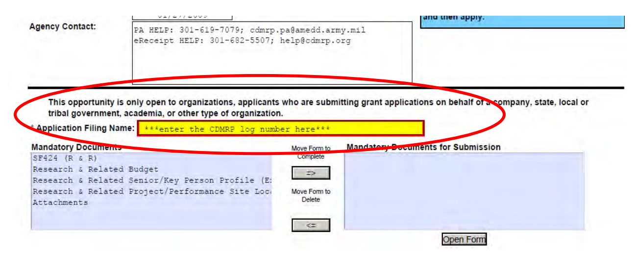
Figure 1. Application Filing Name

Table 1 lists the forms required for this Grants.gov application package. Several documents must be attached to the application forms. Requirements for each attachment are described below and in the specific Program Announcement/Funding Opportunity.