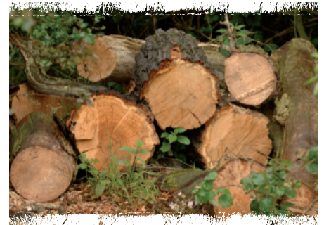
Calorific Value by Species