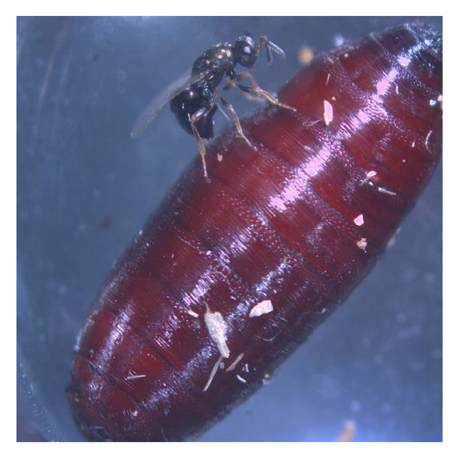
Figure 1. Female Nasonia vitripennis injecting venom into a pupa of the blowfly Calliphora vomitoria ..

Adult females always inject venom prior to oviposition, and the envenomated fly never survives the attack. The venom is highly potent to a wide range of agriculturally important filth flies [1]. The wasp is also of medical importance, since it can be used in biological control of the common house fly, Musca domestica , a major vector of human disease. Furthermore, its venom is very toxic to multiple developmental stages of several mosquitoes that are vectors of such diseases as malaria, encephalitis, yellow fever and West Nile fever [2].