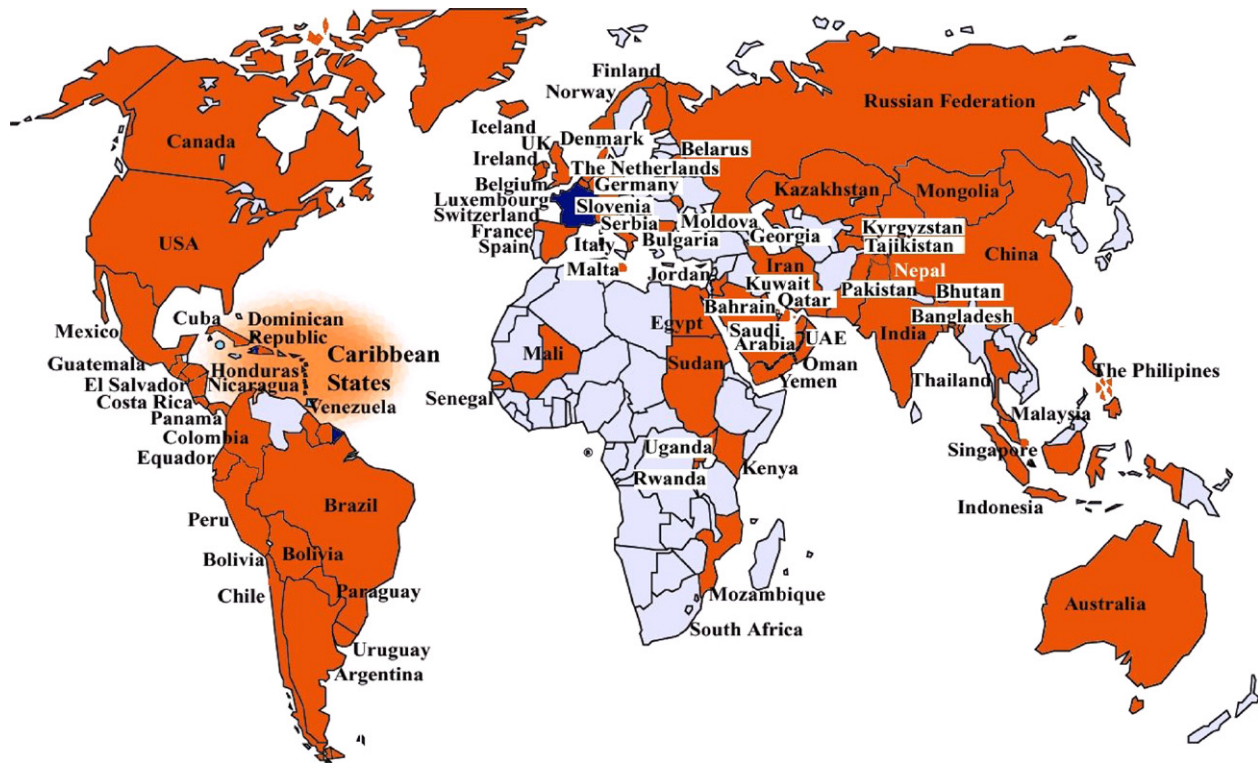
Figure 2 Status of Country Pledges, July 2008.