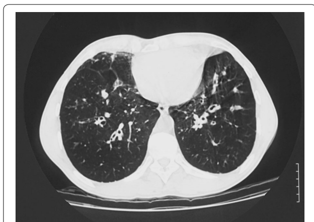
Fig. 1 Bronchiectasis complicating ABPA. Bilateral lower lobe bronchiectasis with marked bronchial wall thickening in most bronchi, but not all. Some distal air trapping and some tree in bud appearances