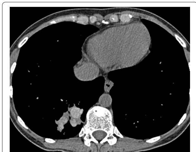
Fig. 2 Hyper-attenuated mucous obstructing distal segments of the right lower lobe in ABPA. Woman with asthma who developed ABPA after exposure to a mouldy house (new renovation that leaked). During pregnancy starting coughing black plugs up and had an episode of pneumonia. CT scan shows rounded opacities posteriorly in the right lung base which are enlarged bronchi full of mucus. On the lung windows, rounded shadows are typical of mucus in bronchi, with some surrounding inflammatory change, on the bone windows (shown here), the mucus in some places appears white than others, consistent with hyper-attenuated mucous (HAM)

the adverse association of Aspergillus colonisation in the airways with asthma disease severity [7–9, 28, 34].