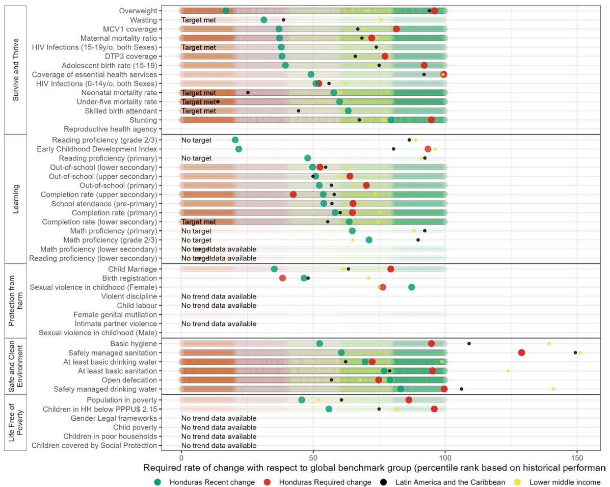
Figure 4. Benchmarking the historical rate of progress and expected rate of progress to meet the 2030 target

Figure 4 can be used to identify where game changers are needed to reach targets. These indicators are identified because the acceleration needed to achieve the target requires an above-average acceleration (more than 15 rank percentiles). Game changers are needed in total in 12 out of 48 child-related SDGs.