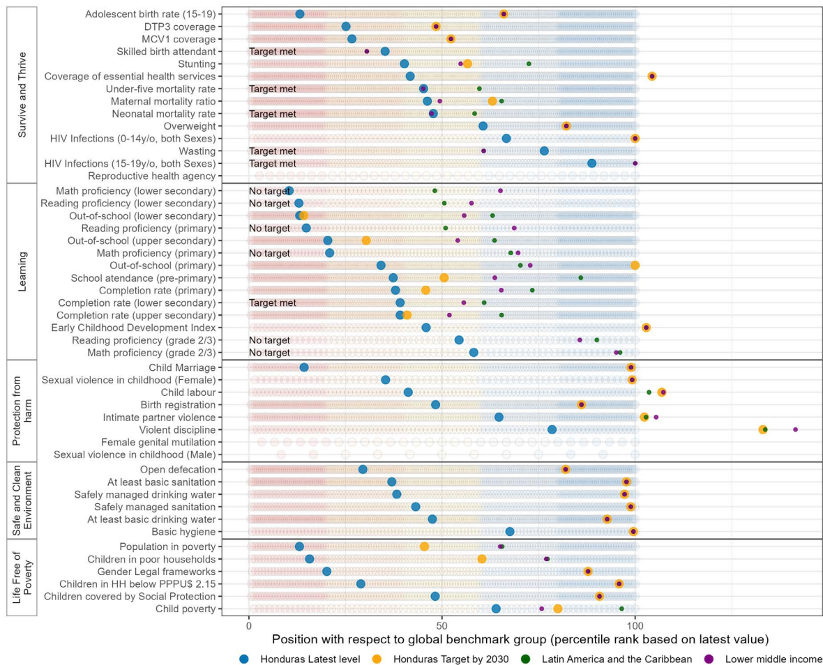
Figure 3. Benchmarking where the country is and where it aims to be by 2030

These findings have broad implications: first, they illustrate that the expected effort is not uniform across outcome areas (and respective indicators). This indicates that certain outcome areas (and specific results) may require more attention, resources, or effective strategies, highlighting the need for differentiated approaches. The point of this exercise is not to question or challenge the targets chosen but to offer a metric that can help inform expectations regarding the actions required to match these targets. This exercise also shows that for some indicators in some cases countries, the expected effort surpasses that in recorded history.