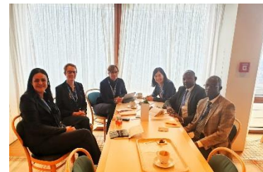
The ECOSOC President meeting with Secretariat staff of the Regional Commissions at the VNR workshop – 19-20 February 2019

The ECOSOC President opened the two-day peer learning event which focused on taking stock of the VNR preparations thus far