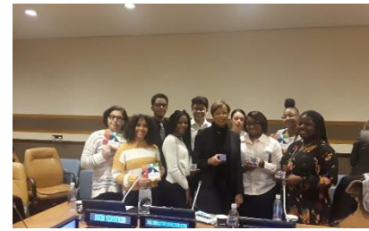
The ECOSOC President meets with students at the Women International Forum – 28 February 2019

On 28 February 2019, the ECOSOC President Inga Rhonda King participated in the Women International Forum. Ambassador King underscored that gender equality is both vital for the achievement of the 2030 Agenda for Sustainable Development, including the Sustainable Development Goals (SDGs).