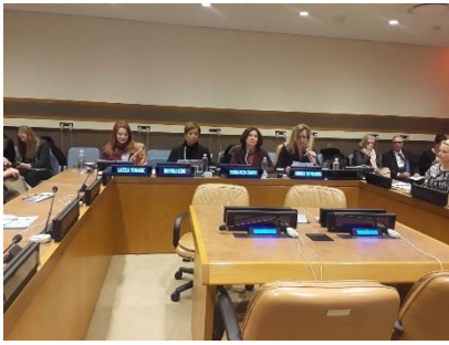
The ECOSOC President at the Women International Forum – 28 February 2019

On 28 February 2019, the ECOSOC President Inga Rhonda King participated in the Women International Forum. Ambassador King underscored that gender equality is both vital for the achievement of the 2030 Agenda for Sustainable Development, including the Sustainable Development Goals (SDGs).