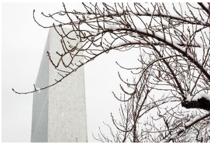
The Committee of the Whole of ECLAC took place at the UN Headquarters in New York

She stressed that gender equality and women’s empowerment are a priority, and that women must have access to and full participation in power structures and decision-making. With the adoption of the 2030 Agenda, Member States at the highest level pledged that no one would be left behind, and they committed to “endeavor to reach the furthest behind first”. Women must have full access to secure decent jobs. Ambassador King called on ending violence against women and to intensify all necessary efforts to overcome gender stereotypes and the negative social norms.