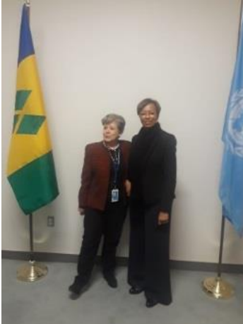
The ECOSOC President meeting with Ms. Alicia Bárcena - 26 February 2019