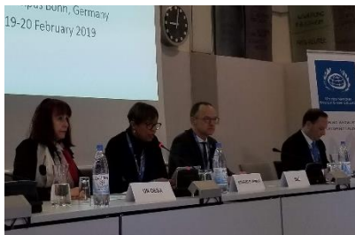
The ECOSOC President opens the Second Global VNR workshop in Bonn, Germany – 19 February 2019

and briefed VNR presenting countries about her vision and expectations for a successful HLPF in July. Participants, including 47 government officials from countries conducting a voluntary national review at the 2019 HLPF, representatives of the UN Regional Commissions, as well as observers from UNDP, UNSSC, the European Commission and the Government of Germany, exchanged best practices and lessons learned in four areas including ownership of the VNR and a whole-of-government approach, data and statistics, stakeholder engagement and resource mobilization for the implementation of the 2030 Agenda.