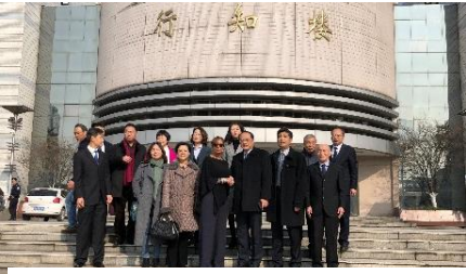
The ECOSOC President meeting with representatives of the Jiangdu International School - 24 February 2019