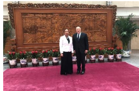
The ECOSOC President meeting with Mr. Zhang Jun - 25 February 2019

They exchanged views on the cooperation between China and ECOSOC, Multilateralism, implementation of the 2030 Agenda for Sustainable Development, High-level Political Forum, climate change and ECOSOC President priorities.