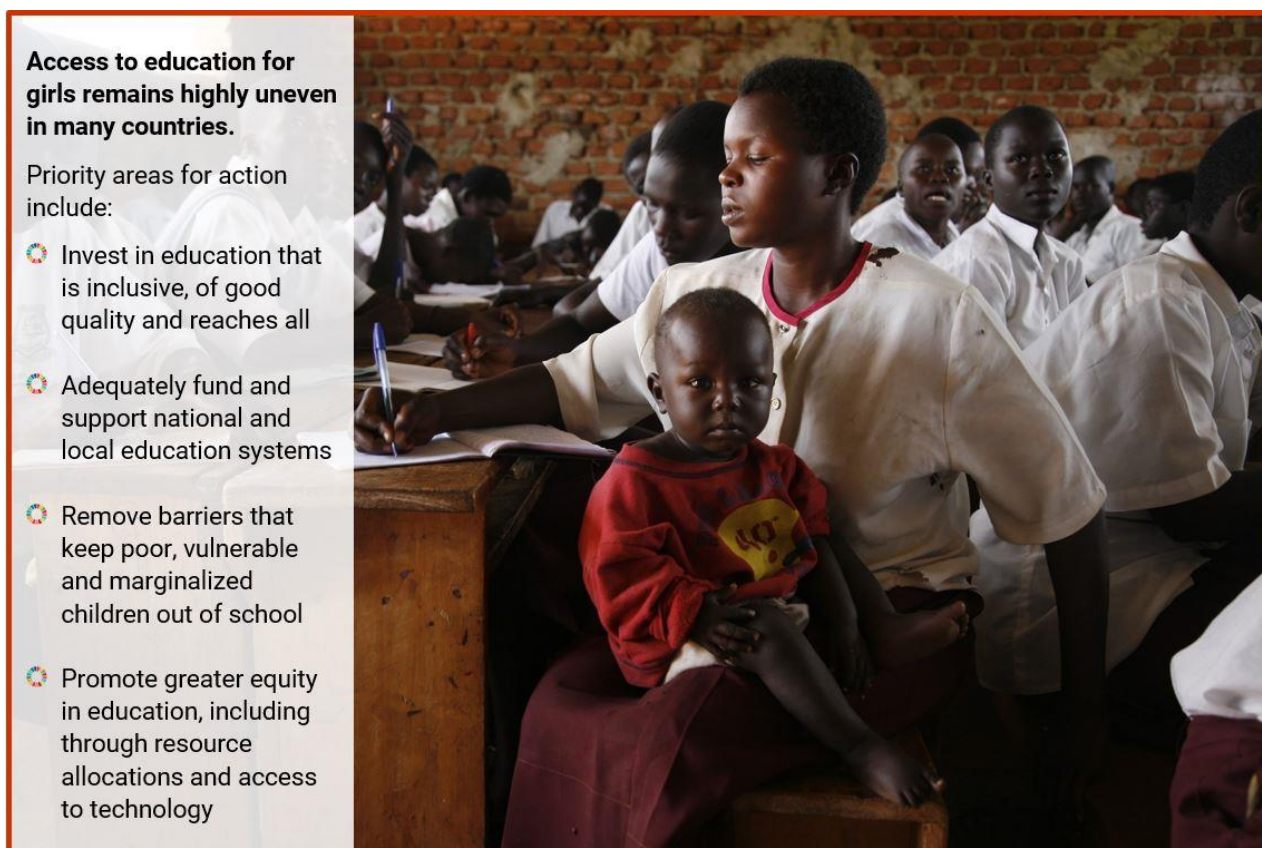
From H.E. Mona Juul's message on the International Day of Education 2020

sustainable development goals. SDG 4, on ensuring inclusive and equitable quality education, is an essential global goal and critical for the realization of the 2030 Agenda as a whole.