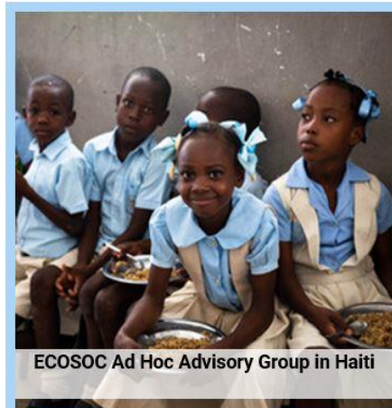
ECOSOC Ad Hoc Advisory Group in Haiti

The Economic and Social Council has developed mechanisms to respond to the problems faced by countries emerging from conflict and enhance the peace and development nexus.