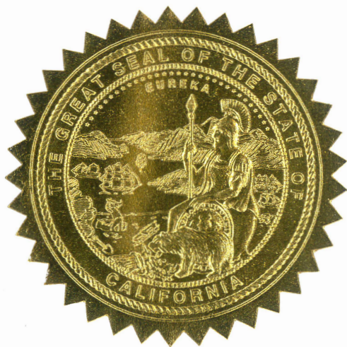
Shirley N. Weber, Ph.D. Secretary of State

A handwritten signature in blue ink, appearing to read 'Shirley N. Weber'.