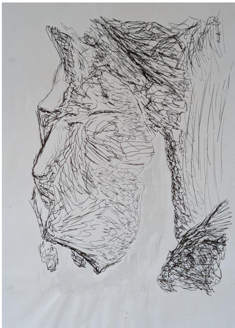
Figure 1. The original title of the drawing is “trollet og sitt hjem”, in English: ‘the troll and his home’.

In Figure 1, the challenge is to correctly classify that sketchy drawing as a whole, one “piece of art”, and its interpretation comprising all aspects together. In a second, complementary, demand, an example AI is challenged to generate a similar image from a description. Some results of “snapshot-experiments” at different times are presented in Appendix A at the end of the paper.