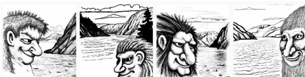
Figure A7. Products of DALL E on 6 June 2023 responding to a more explicit prompt [68].

An attempt of further improving on the prompt by making it more precise: “a drawing in black and white, which shows the head of a troll when the picture is in portrait orientation, and the same picture showing a Norwegian fjord when viewed in landscape orientation” produced some creative solutions by splitting the display, alas, none fitting the description, see Figure A8 [68].