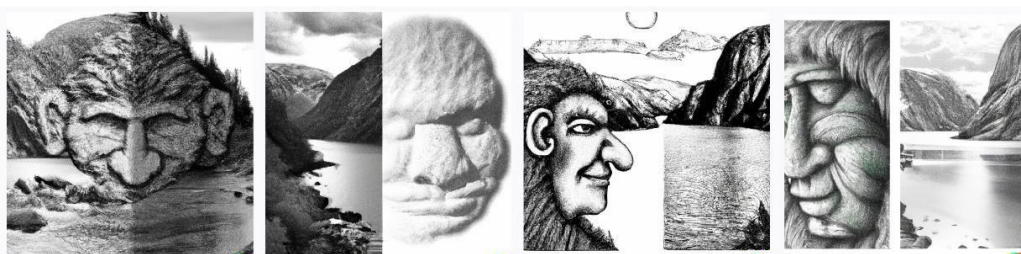
Figure A8. Products of DALL E on 6 June 2023 responding to a still more explicit prompt (“a drawing in black and white, which shows the head of a troll when the picture is in portrait orientation, and the same picture showing a Norwegian fjord when viewed in landscape orientation”) [68].