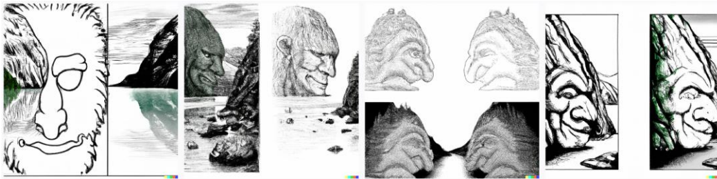
Figure A9. The response of DALL E to same prompt as used four months earlier for Figure A8 [68].

An additional series of a few quick “snap-shot experiment” has been performed in the beginning of November 2023. The classifications for the two orientations were exactly the same as in June [67], see Figure A9.