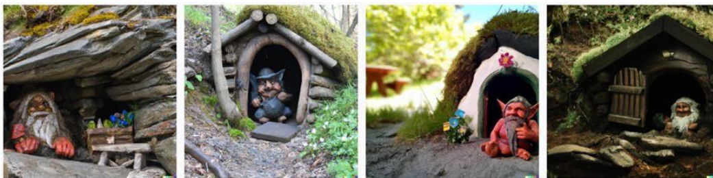
Figure A3. Product of DALL E on 4 March 2023: “the troll and his home” [68].