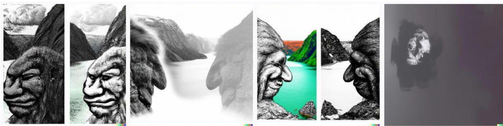
Figure A10. The response of DALL E2 to same prompt as used earlier for Figures 9 and 10 [68].

While the outputs have changed superficially, they demonstrate the same not-understanding as earlier in June. Another twist was delivered by DALL E2 on November 5 [68]. The last proposal in Figure A10 depicts something abstract, similarly fitting or not-fitting the specification.