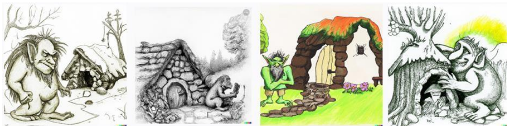
Figure A4. Once more: “drawing, the troll and his home” [68].

These cursory experiments, of course, do not give anything but a very superficial snapshot at a certain time in early 2023, albeit arguably a representative one. All of the results are undoubtedly impressive; the one of ChatGPT even more so than what google lens or DALL E came up with. Many humans would be happy if they could write or draw at that demonstrated level.