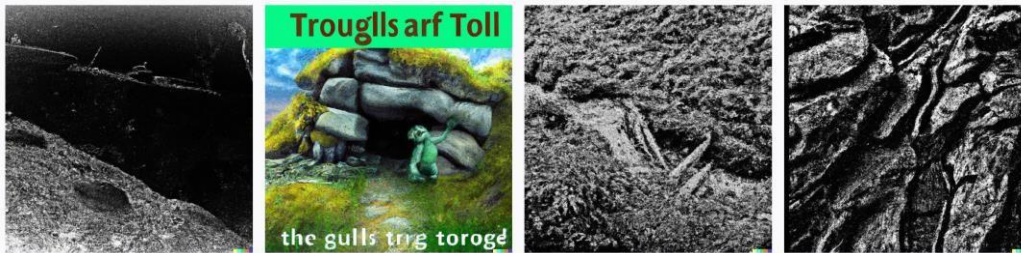
Figure A6. Products of DALL E on 6 June 2023 prompted with the same text provided by ChatGPT as in Figure 3 [68].

On the production side, again using the AI drawing-app DALL E, first the same prompt was used as for Figure A2. The output turned out to be somewhat different than at the initial attempt, see Figure A6 [68].