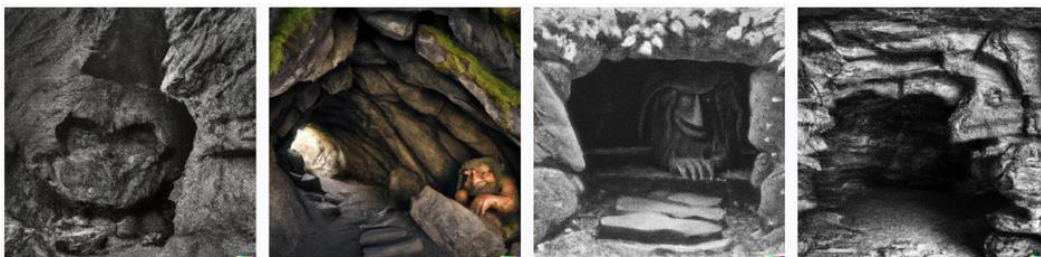
Figure A2. Products of DALL E on 3 March 2023 from the above text provided by ChatGPT [68].

The AI drawing-app DALL E by the same company, OpenAI, produced the pictures in Figure A2, when fed with the prescription given by ChatGPT description; see Appendix B [68]. A clear mismatch between the exhibited levels of verbal description and drawing production is evident. In this sense, the AI is not self-consistent (which is not necessarily distinguishing it from humans).