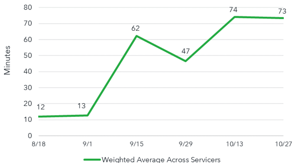
FIGURE 1: AVERAGE AGGREGATE CALL WAIT TIME (AUG-OCT 2023)

Extended call wait times were not limited to peak call periods and seem to be reasonably consistent across call center operating hours. For example, over the latest reporting period, no matter when they called, most borrowers encountered potential wait times longer than 45 minutes when they tried to reach a customer service representative. 12 One consumer reportedly waited 565 minutes to speak with a customer service representative.