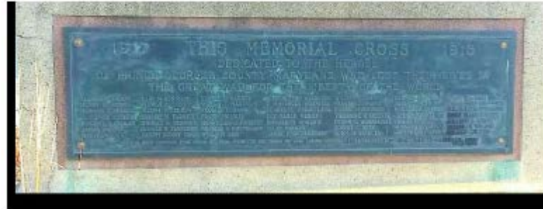
(J.A. 1891) 22