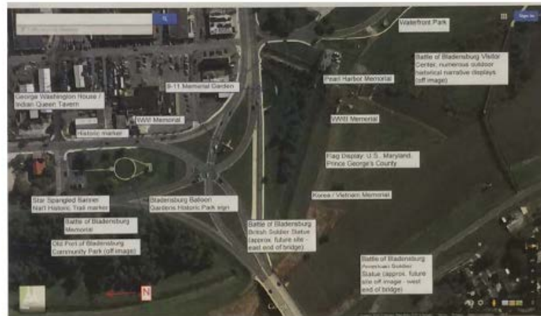
(Supp. J.A. 2) 23