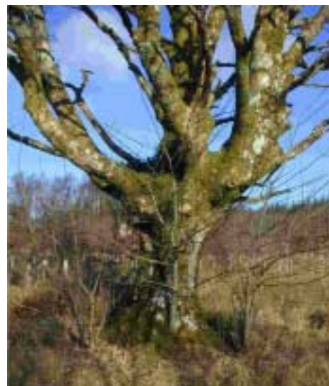
Classic sycamore pollard in the remains of a former 19 th C park attached to Kilmory Castle, Lochgilphead

Analogy with the built heritage can actually be a useful way of looking at wood pasture. So early wooden hunting-lodges were superseded by medieval towers, then by more comfortable castles, then converted to stately homes. Sometimes parts of the earlier built structures are still visible, and this is the same with ancient wooded landscapes. In the case of both designed landscapes and ancient woodlands we are looking at a series of overlain features (historians call this a palimpsest ), accumulated over a thousand years. The lifetime of some of the oldest trees in an ancient park may be more than half a millennium, and so this puts a very historic context to wood pasture.