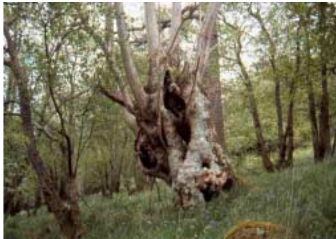
r: massive hollow ash at Inversnaid