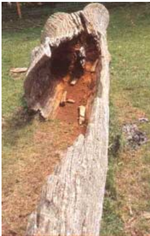
l: rotting fallen oak log, Dalkeith parkland