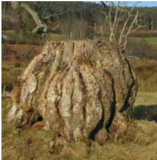
basal swell on what is left of an old ash tree in Golspie park!

To a lesser extent burring in the stem is also a characteristic feature of at least some open grown trees.