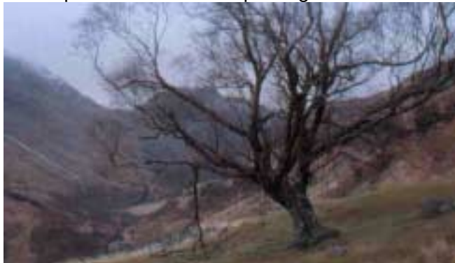
veteran birch beside a man-made platform, N-facing side of upper Glen Nevis

A feature of the second two types, but not the first, is that the wood pastures seem to survive best in areas which are somewhat remote, even by rural standards. So they are often on the shady north facing side of a glen or loch (eg Loch Tay, Loch Earn), and in places where the improving hand of our forefathers has touched but lightly.