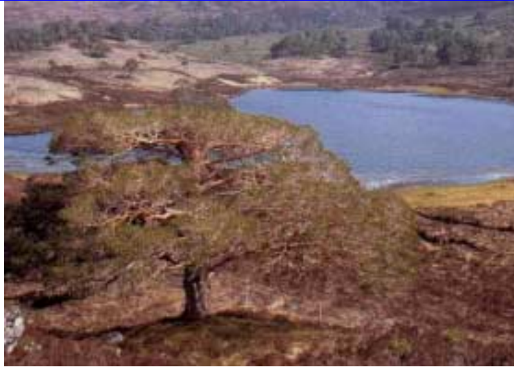
rounded open grown pine in a wood pasture situation, Glen Affric