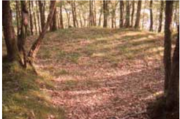
Charcoal hearth, Wood of Cree

livestock, at least for the first 4 or 5 years, often by well built stone walls or at least by turf dykes, wooden palings and brush fences, to allow the coppice shoots to re-grow. The problems that occurred when these works were not done properly were discussed above.