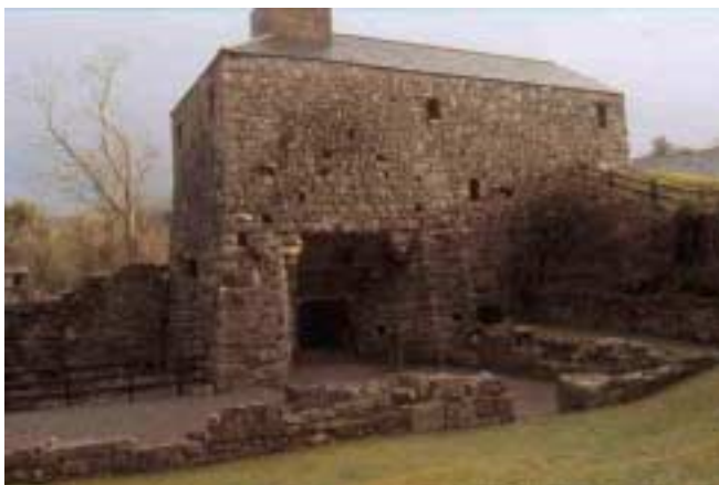
Bonawe furnace, Loch Etive

We discussed above how some wood pastures are the product of a long history of man's intervention with certain woodland types, not only by grazing, but also by directly managing the trees themselves by pollarding. In modern times we are so used to having plentiful food, as well as materials for building and everyday life that we forget how dominant a factor in people's lives was the growing of food. If crops failed they would probably starve that winter. Similarly it is hard for us to imagine the use of wood for all manner of day to day uses, as well as being the main source of fuel, except in districts where peat was more abundant. We are also used to seeing a relatively well wooded countryside, where in fact timber is now a rather low priced commodity. During the few hundred years before the 20 th C, there were very low levels of woodland cover in Scotland. Apart from areas of planted conifers on the lower lying land of the main tree planting Dukes of Atholl, Argyll, Buccleugh etc, the bulk of any woodland that existed was of native species and mainly on ancient woodland sites.