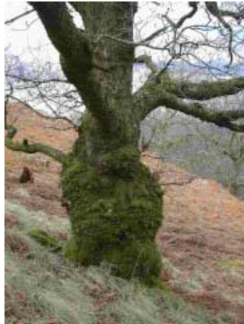
Burry oak in wood pasture at Glen Liver, Loch Etive

To a lesser extent burring in the stem is also a characteristic feature of at least some open grown trees.