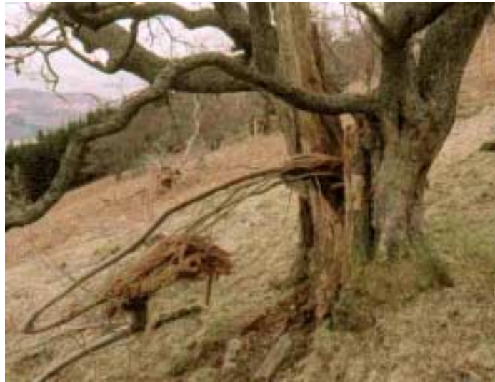
l: successful rowan air tree in birch, Midgeholme burn, r: less successful rowan in alder, Loch Earn

A further type of multi-stem tree, more common in lowland parks, or at least where visible from a mansion house, is the ' bundle planted ' tree. These derive from planting of a bundle of up to 10 plants in the same hole. This was a recognised 19 th C landscaping technique (see Debois, 1997). The effect today is very like a coppice stool, only the stems are fused together and do not have a hollow centre.