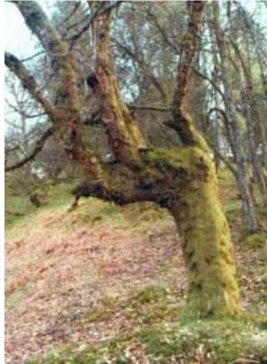
r: comb oak in wood pasture, Glen Artney