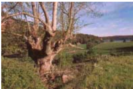
ash pollard at Farnborg, Aland Islands, Finland

It is appropriate at this point to draw comparisons between the old Norse traditions in the Lakes, and very similar traditions in western Norway (Austad, 1989), southern Sweden, Finland, and the Aland Islands (Haeggstrom, 1998).