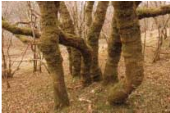
l: ancient coppice stool in Drimnin hazelwood

The other main type of 'historic shape' is the multi-stemmed tree . Not all multi-stemmed trees have been coppiced, as the same effect can come about through release of browsed shoots after a period of heavy grazing. That may account for a lot of the multi-stemmed hazel, alder and birch in pasture woodlands, but probably most multi-stem oak have indeed been coppiced in the past.