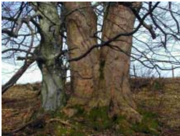
beech and sycamore double tree - a simple mixture of species close together such as this can occur by natural seeding

Let's look a bit more at hollows in trees, another key feature of veteran trees, particularly those in wood pastures. The cause of the hollowness is decay of heartwood, but this does not always make the tree weaker. Far from it, as the hollowing, combined with pollarding to lower the centre of gravity, can give the tree lightness, strength in its tubular structure, and thus stability in winds. These are all adaptations which allow pollarded and hollow veteran trees to live a long life, especially in the open situation of a wood pasture.