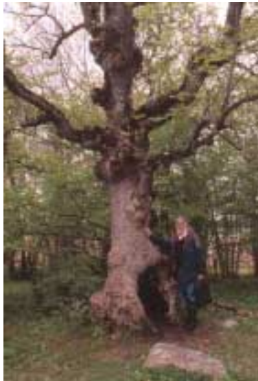
veteran trees and wood pasture!