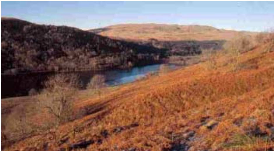
very open parkland at Glen Shira with scattered ash and sycamore with some oak and sweet-chestnut. A top rate lichen site

Some sites show quite clearly that given respite from grazing for a prolonged period, wood pastures will seed from the older trees and regenerate. Achnatra Wood on Loch Fyne is one such place, and the scattered veteran ash are still visible on adjacent land to show the sort of open wood pasture the site may have been, before a stock fence erected several decades ago allowed recovery. The open wood pasture in the adjacent Glen Shira is in fact one of the best habitats for old growth lichens in Scotland.