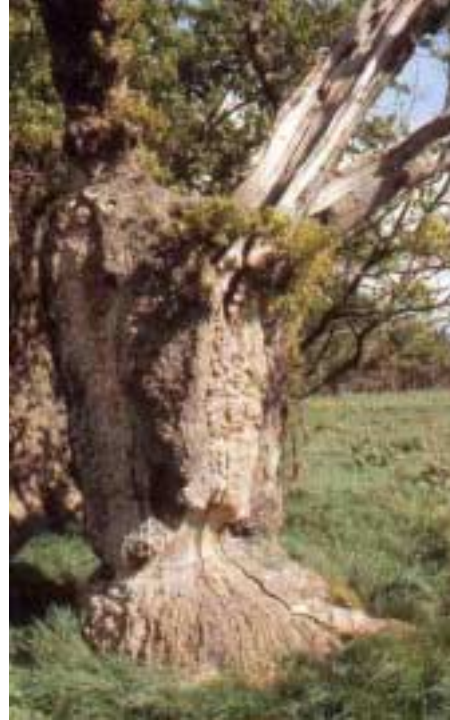
l: basal swell on alder, Glenfinglas (+rowan airtree), r: swelling on massive veteran oak, Cadzow