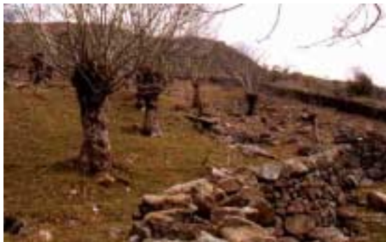
ash fodder pollards in Watendlath, and . . .

The second set of wood pastures are those which are not part of designed landscapes, but have evolved over the centuries through the interaction of ordinary country folk -engaged in nothing more glamorous than eeking a living from the land. The practice of pollarding long predates the cosmetic treatment of parkland trees in the early 19 th C. Even at that time there must have been a folk memory of a much older practice which in many districts was part of farming life itself: the cutting of branches and leaves for feeding to domestic livestock. This fodder pollarding is known to be the cause of the characteristic pollards which are frequent in the Lake District valleys of Borrowdale and Langdale, and may also be seen in the hedgerows and open wood pastures of other upland areas in north England.