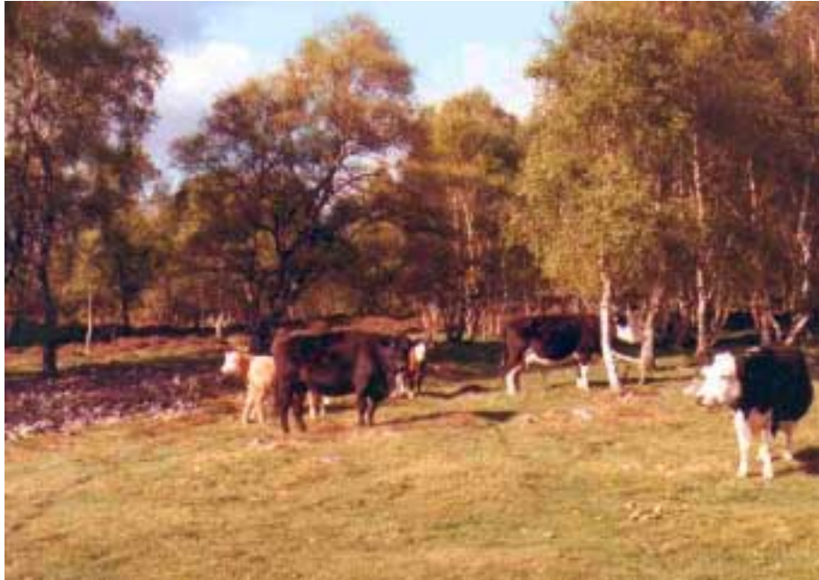
Cattle grazing in birch wood pasture on Muir o'Dinnet

Since grassland is a normal part of wood pasture, does that mean that grazing by animals is a normal part of the wood pasture scene? Yes very much so! More than that, without the grazing animals there would be no wood pasture. In other words grazing animals are part and parcel of a wood pasture system. Wood pasture is in effect a grazing maintained habitat, just like old flower-rich hay meadows.