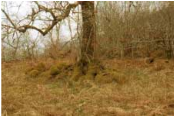
l: ash on stone dump, Rassal r: non-pollarded but burry old oak on edge of terrace

Once the system was abandoned, the trees would grow on, seed into gaps, and become a sort of woodland.