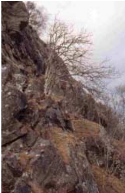
Rock Whitebeam ( Sorbus rupicola ) on woodland crag refugium at Creag Dubh, Laggan

It is common to find that woodlands in gullies and on crags contain a number of rare species of plants, trees and shrubs. Indeed they are often the only places in that district that these species are found. This is good evidence that the woodland containing them is of natural origin, and probably has a very long continuity, possibly stretching right back to the post-glacial wildwood. It is not easy to prove that to be true, except by palaeo-botanical techniques, which are not usually possible at the scale of a single gully. The survival of ancient woodland indicator species and other rarities is good evidence in itself.