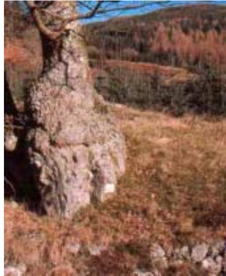
Strathyre: two massive old wood pasture relicts, previously coppiced, then grazed in a wood pasture, then afforested on the hill behind. One seems to be flowing over the rock..

Neither were veteran trees and open wood pastures tolerated during 19thC farming and estate improvements, unless they could be included as an ornamental feature within the designed landscape. Indeed the heart of agricultural improvement at that time was to enclose and improve land that had previously been unenclosed grazings. In some ways the wood pastures that remain today escaped that process, or survived, but somewhat as anachronisms. Shielings and other settlement ruins abandoned at that time are now almost a feature of wood pasture, as we shall illustrate later.