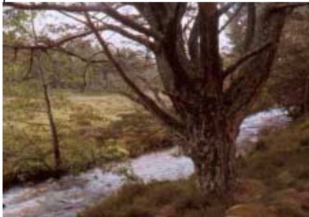
open grown riverside pine in Rothiemurchus Forest

Even areas containing major pine forests such as Abernethy, Rothiemurchus and Mar were once medieval hunting forests (Gilbert, 1979). Many native pinewoods are not only of wood pasture structure, but also merge into true broadleaved wood pasture on their flanks.