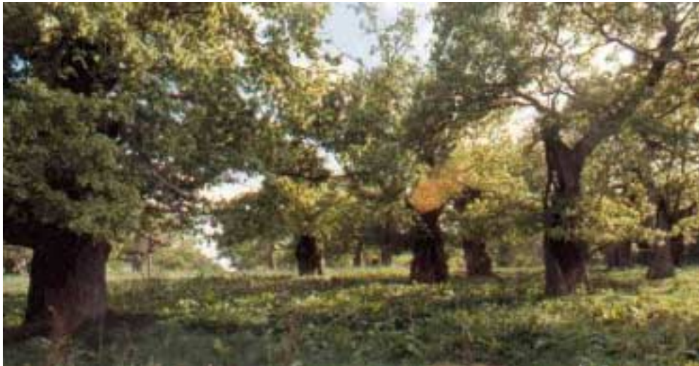
the Cadzow oaks, after grazing has ceased in part of this lowland wood pasture

The simplest type to explain is probably the lowland park type of wood pasture, where a park of scattered trees has been planted and allowed to grow very old. The veteran trees are almost a backcloth to the use of the park for hunting of deer and game over the centuries, and for grazing by livestock. One of the best lowland wood pastures in Scotland is known as the Cadzow Oaks , (and also as Hamilton High Parks).