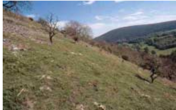
hawthorn pasture at The Nest

Blackthorn on the other hand, while common in wood pastures, seems to have strength in numbers, and regenerates more as small clumps, rather than as individual shrubs as does hawthorn.