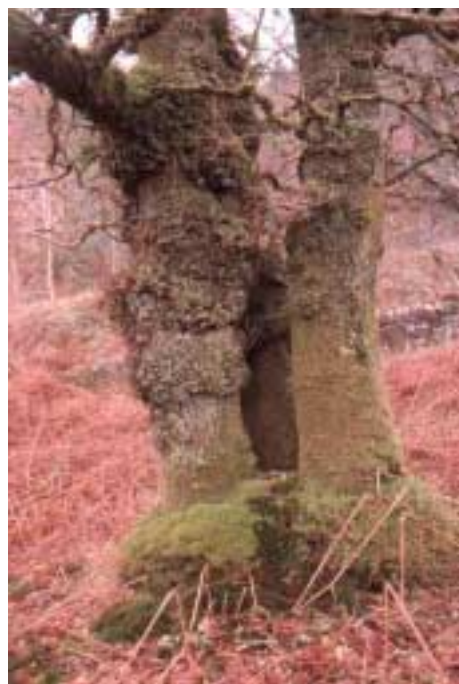
l: strange effects in hazel, Glenfinglas, with old coppice stems fusing and crossing over r: fused oak coppice in wood pasture, Stonefield