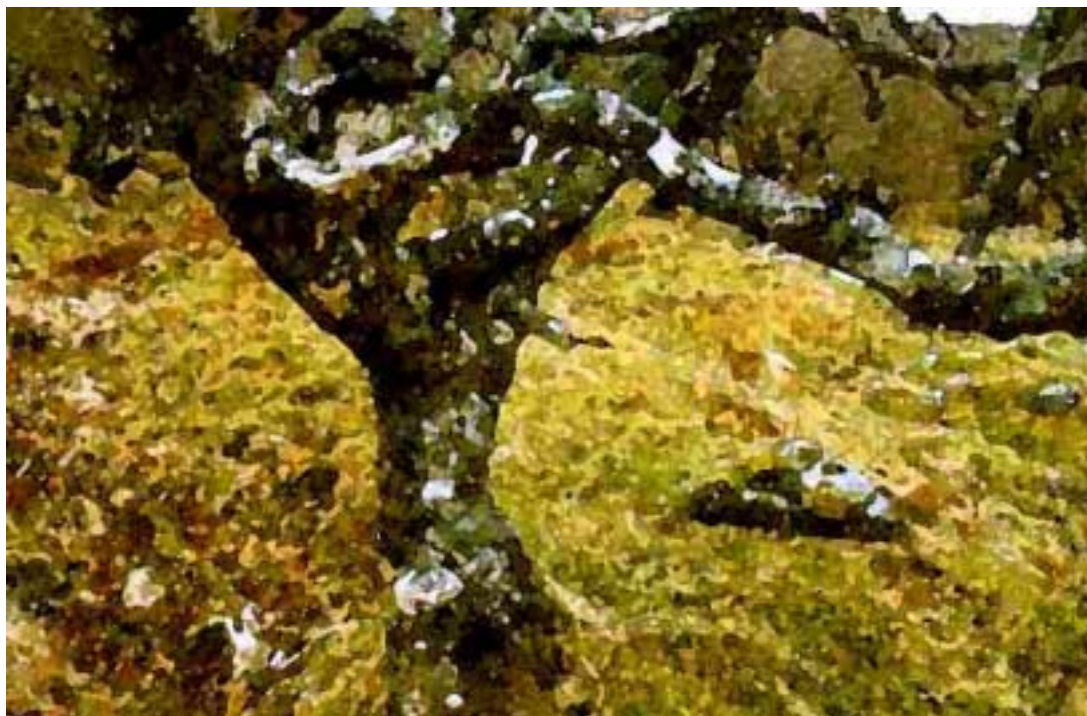
hazel pollard at Glenfinglas wood pasture

NATIVE WOODLAND ADVISER FORESTRY COMMISSION, NATIONAL OFFICE FOR SCOTLAND