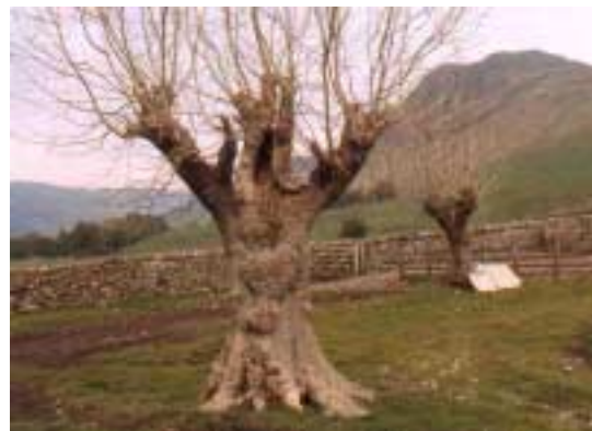
Langdale, Lake District