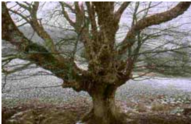
l: sycamore pollard, Lochgilphead r: ash pollard near Luss

One piece of evidence that constantly crops up in Scottish wood pastures is that while many of the surviving trees do not show strong evidence of previous pollarding, if you look at the very oldest trees on site, eg veteran ash of over 300 years age, these can indeed have a strong pollard form, though now of course grown-out. This can result in the classic old pollard candelabra shape (see Kilmory pollard photo above – sycamore holds the candelabra shape better than most species). Even when a pollard has blown over and regrown vertically to some extent, it still holds that shape as evidence for decades to come (good example of fallen ash pollard in Glenfinglas).