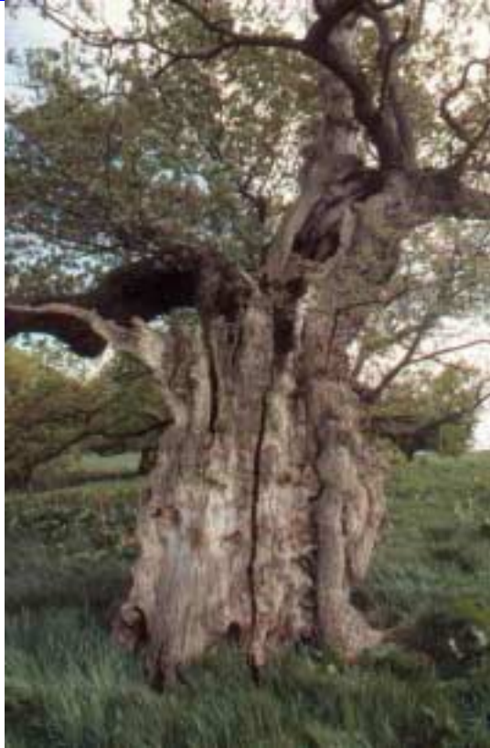
l: hollow veteran oak, Cadzow