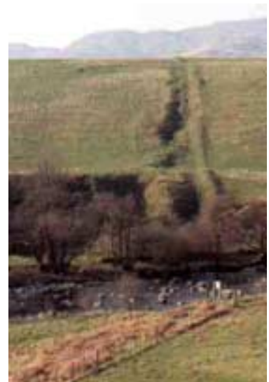
r: massive earth dyke at Glenartney

Woodland protection dykes come in all shapes and sizes, and are an archaeological study in themselves. Many dykes within wood pastures were designed for enclosing deer for hunting as much as dykes around coppices were designed to keep deer and livestock out. Some old royal hunting forests have the remains of huge old earth banks and dykes associated with them.