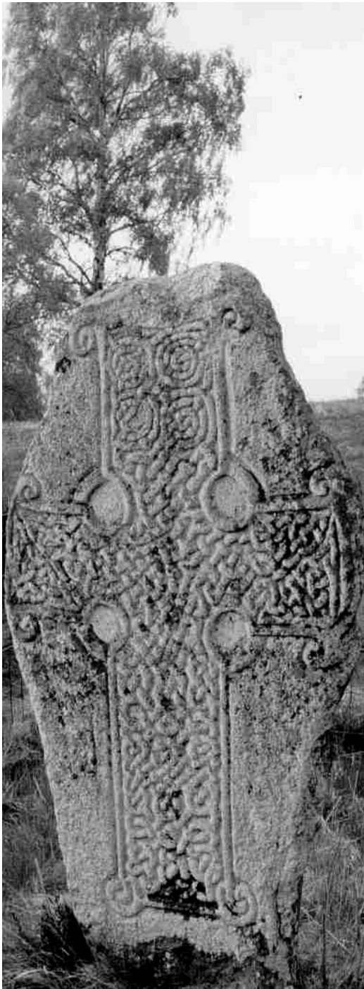
Pictish stone, Muir of Dinnet

perhaps be able to spend more time with the owners of this type of woodland, and achieve some enlightened restoration work on the ground.