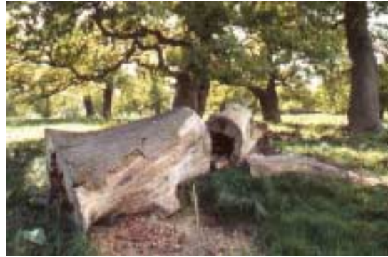
r: hollow logs on the ground, Cadzow