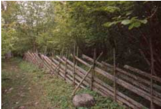
traditional fence in Scandinavia – could this be similar to the old 'stake and rice'?

Woodland protection dykes come in all shapes and sizes, and are an archaeological study in themselves. Many dykes within wood pastures were designed for enclosing deer for hunting as much as dykes around coppices were designed to keep deer and livestock out. Some old royal hunting forests have the remains of huge old earth banks and dykes associated with them.