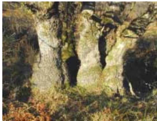
r: burry veteran oak coppice, Golspie park

Because oak can live so long, oak coppice can survive for many centuries after it was last cut. Most oak coppice in Scotland has stems about 150 years old, dating back to the time when it was used for charcoal and tanbark as discussed above. However there are coppice stools which pre-date that era, and they have stems of over 200 years, on an even older stool. The extreme is seen in oak coppices of medieval origin, which have also gone through a long period of grazing in a park. This gives rise to the massive stools in Dalkeith park, and they can also be found in other wood pastures throughout the country.