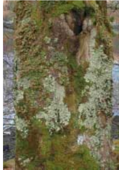
r: Lobaria pulmonaria and L. amplissima on oak