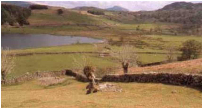
veteran ash fodder pollards in a cultural landscape, Watendlath, Lake District

Finally by being ancient, wood pastures are by definition historic! Indeed they have a real sense of history about them, and maybe that helps explain their popularity. Many of the features of wood pastures that we will be looking at later are of a historic character. Because veteran trees are themselves a kind of living ancient monument, this brings us into the realms of woodland archaeology, but where the ancient living things are of as much interest as the built structures and the earthworks. This too is significant, because wood pastures are not just a natural phenomenon, they have had the hand of man in their making. They are in fact part of the man-made or cultural landscape just as much as they are part of a natural landscape. But when we come to look at naturalness, certain types of wood pastures also excel themselves in being one of the most natural origin woodland types in Britain today!