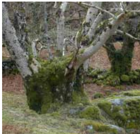
l: excellent example of a low ash pollard, Glen Liver r: ash stub, Glen Liver