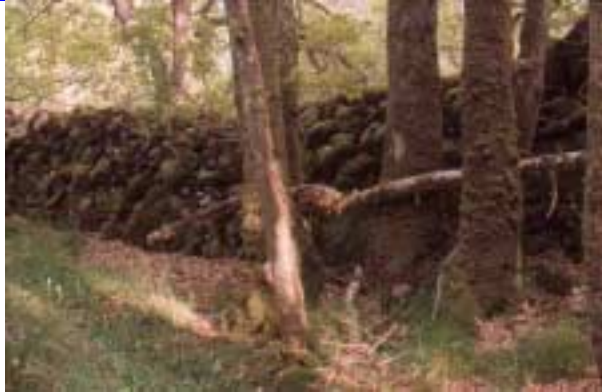
coppice dyke at top of Wood of Cree

'one-sided' woodland protection dyke, Cowal