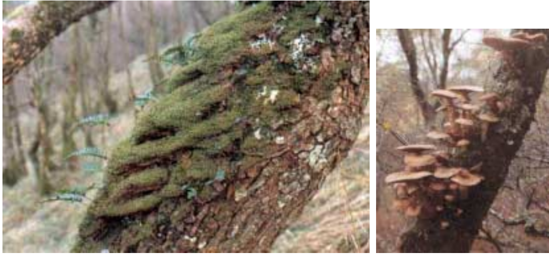
l: layers or 'terraces' of mosses and liverworts are a feature of veteran trees, especially in the western woodlands (also with polypody). r: fungi on old birch

feature of veteran trees – how many photos in this guide have polypody?), and also some flowering plants grow in hollows and niches on the tree.