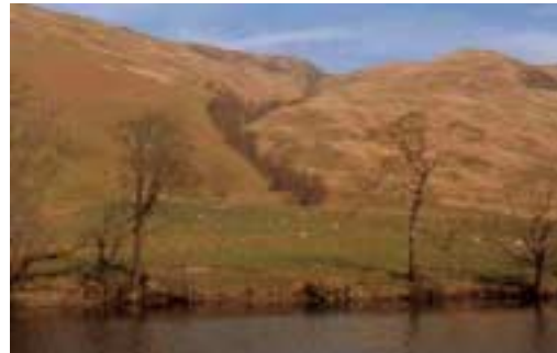
sw Glen Orchy showing (l) wood pasture and crag refugium; (r) a gully refugium just to the north