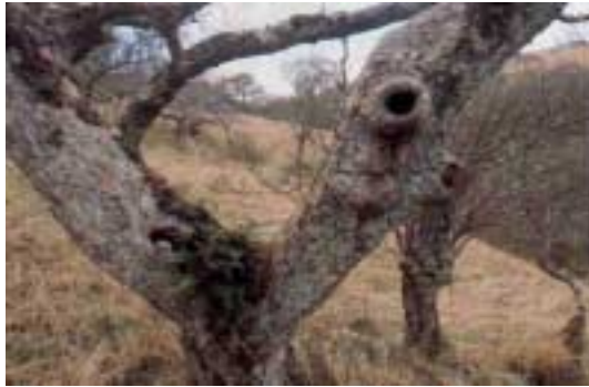
l: hollow branches in alder, Balnabraid Glen

Hollows in veterans can extend right up into the rotted heartwood of branches, where they afford excellent habitat for bats and birds.