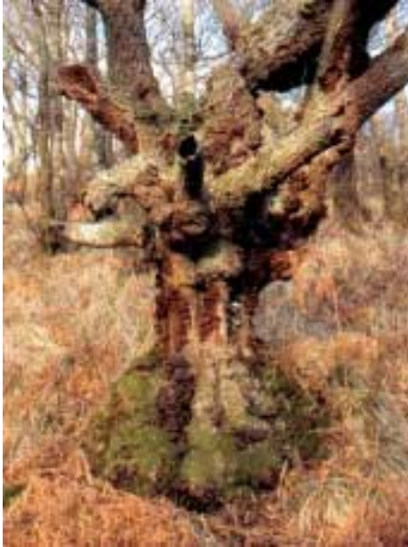
alder pollard at Balnabraid Glen shape

We have seen a number of previously pollarded trees illustrated already, but there are some trees which seem to capture a historic pollard shape even better than the candelabra sycamores. An ancient pollarded alder at Balnabraid Glen, S Kintyre, shown below has been dead for decades, yet retains the classic short stumpy pollard head and swollen base typical of a tree which has been grazed around, and cut for wood or possibly leaf fodder, for most of its long life. That woodland has now mainly infilled with younger alder, but the striking 19 th C pollards remain within it.