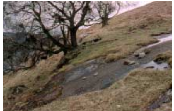
two views of high level wood pasture above Loch Earn

In many wood pastures enormous veteran trees especially alder can occur right at the current tree-line, at well over 300m elevation.