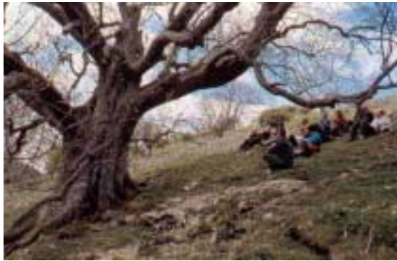
veteran ash at The Nest - ATF meet