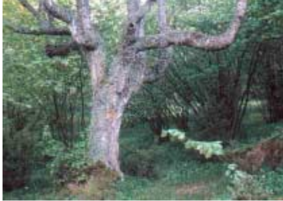
l: 'grown-out' pollard birch in Nato reserve r: the big birch pollard at Glenfinglas, beside old arable

Similarly there are many ancient birch in parts of the western highlands, which closely resemble the old birch fodder pollards of Norway and Sweden, and they seem to be evidence of similar farming traditions. However, unlike the Lake District and the Baltic, the practice seems now to be beyond folk memory in Scotland, and is thus harder to prove.