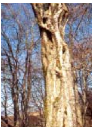
l: birch showing the ropey effect in a straight stem,

Birch trees in old age develop a peculiar ropey effect on the bark, which is a kind of strengthening mechanism. This feature only develops in old age, especially on the large horizontal branches of ex-pollard birches but also on main stems of open grown birch. Also as birch ages, deeply blocked bark develops, which is a niche habitat for many specialist species of lichen and invertebrates.