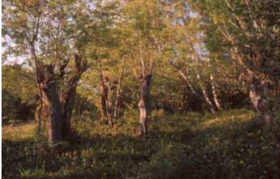
pollard meadow at Nato nature reserve, near Mariehamn, Aland Islands, Finland

All these areas carried on a classic tree leaf-fodder pollarding system, in a number of native broadleaved species, but especially in ash, elm, birch, and goat willow. Over a long time this process results in a particular shape of tree, which is retained for at least a century after the pollarding stopped. In these countries too, a certain amount of pollard restoration is being done to preserve flower rich ' pollard meadow ' habitats, and also as part of the restoration of traditionally farmed cultural landscapes.