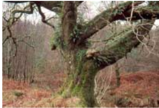
veteran pollarded oak at Stonefield, Argyll

Finally by being ancient, wood pastures are by definition historic! Indeed they have a real sense of history about them, and maybe that helps explain their popularity. Many of the features of wood pastures that we will be looking at later are of a historic character. Because veteran trees are themselves a kind of living ancient monument, this brings us into the realms of woodland archaeology, but where the ancient living things are of as much interest as the built structures and the earthworks. This too is significant, because wood pastures are not just a natural phenomenon, they have had the hand of man in their making. They are in fact part of the man-made or cultural landscape just as much as they are part of a natural landscape. But when we come to look at naturalness, certain types of wood pastures also excel themselves in being one of the most natural origin woodland types in Britain today!