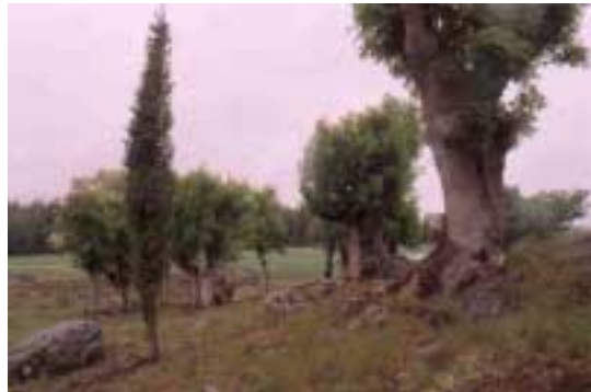
recent re-pollarding at Borsa Isle, Sweden