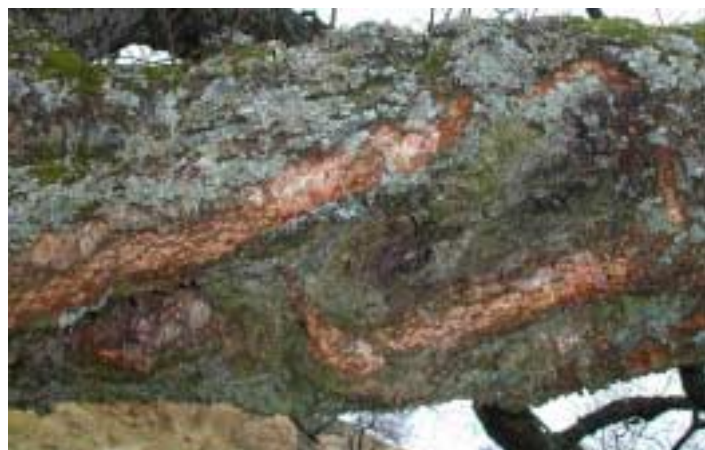
r: close up of a ropey branch