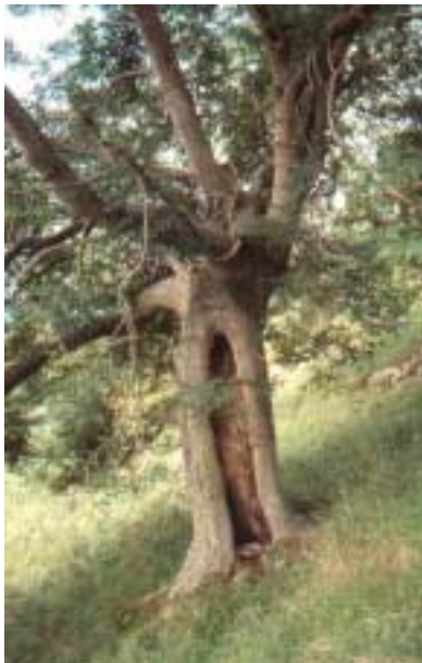
X l: hollow ash pollard at Myreton ,