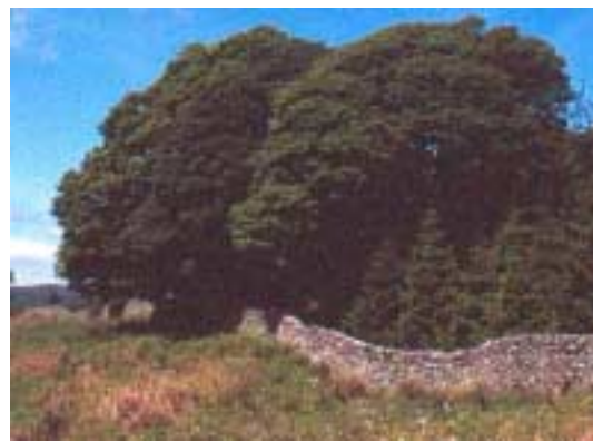
two views of the enclosing high wall to Cumloden Deer Park, Galloway