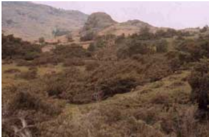
Juniper scrub pasture, Langdale

Another relict woodland type that may be similar in origins to wood pasture in the uplands is juniper scrub . It is of a similar open structure, sometimes with a few emergent trees growing from it, and usually heavily grazed. Juniper may also be a component of a native pine and birch wood, as is common in Speyside and less so elsewhere ( pinewoods as wood pasture are described below ).