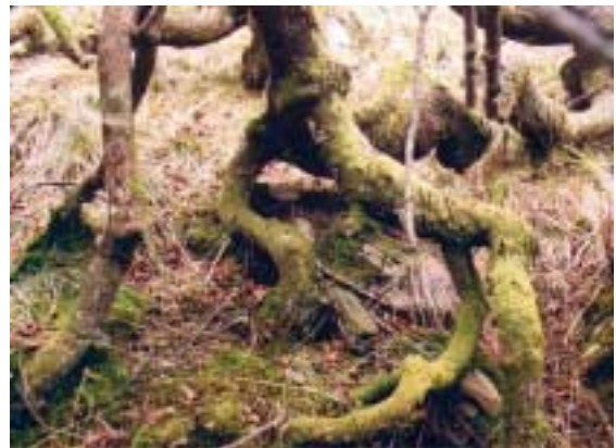
layered branches of bird cherry