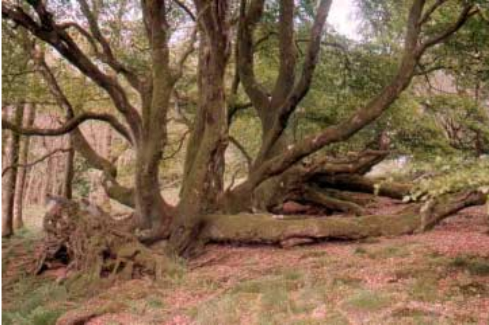
magnificent 'phoenix bundle planted beech' at Carstramon wood!

pollarded at perhaps 2m from the ground, leaving a very strange effect indeed. One exists close to the public road near Luss ( no image available ).