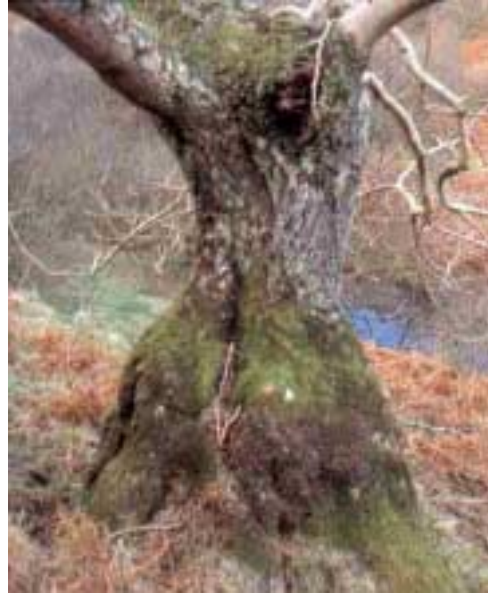
ash pollard at Balnabraid, with similar

Notice that both these classic pollards have a distinctly bulbous basal swelling , caused by myriad adventitious shoots at the base of the stem being constantly grazed by livestock, and the tree responding by building up burr tissue. This feature is a very reliable indicator of a wood pasture history, even when such a tree is now found within a current woodland. It is unlikely to be found in a tree of less than say 150 years old, and more likely in those of 200+ years.