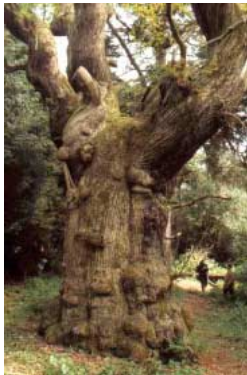
l: two stages of pollarding, oak at Rydalwater, r: sweet chestnut veteran pollard in Roslin Glen