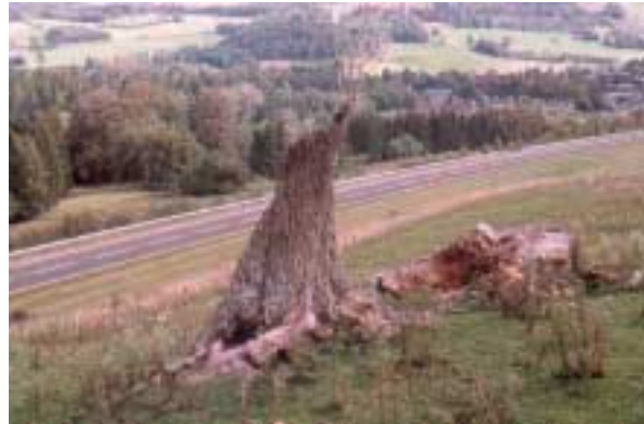
r: the ultimate fate of hollow veteran trees in

Even after falling, the hollow veteran can however sustain fungal growth and act as a habitat for deadwood (saproxylic) beetles and their larvae for many more decades while it rots slowly.