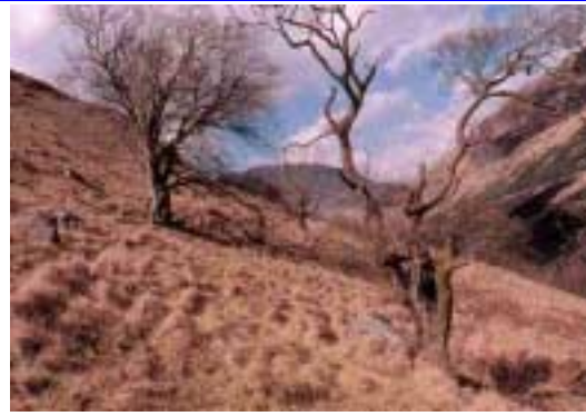
huge veteran alder along with birch, rowan and hazel at the top of Inverchorachan wood, Glen Fyne