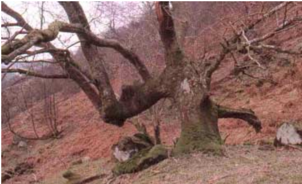
comb oak beside ruined building, in wood pasture on west Loch Lomond