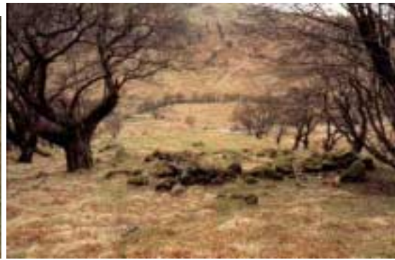
l: Limekiln, Ardtornish ashwood, r: ruined dwelling (summer shieling?) in Glenfinglas wood pasture