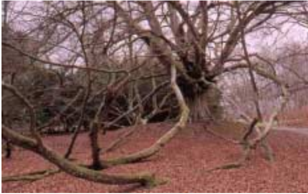
layered beech tree in Kilravock park