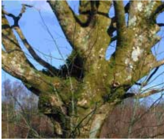
l: sycamore bolting r: big oak pollard at Balfron church showing flat topped bolting

The classic shape of pollard has a distinctly flat bolting at the point where its main stem was cut, at between one and three metres from the ground. From this point many branches or stems emerge in a sort of 'Medusa's head'.