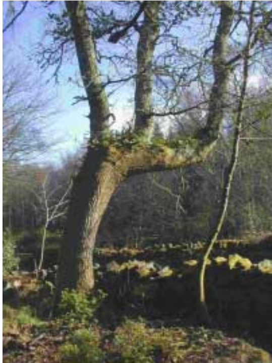
l: comb oak at Kilmory, Lochgilphead

A variant on the classic pollard is when there is no flat bolling as such, but the stem takes a horizontal turn after being cut, then resumes vertical growth on more than one subsidiary branches. The result is a sort of 'cock's comb'. It can occur naturally after a tree has been truncated in the wind, but most of the best examples of a comb tree are right beside buildings or other artefacts in the rural landscape. Obviously, this severe pruning effect is usually a sign of a previously man-influenced tree.