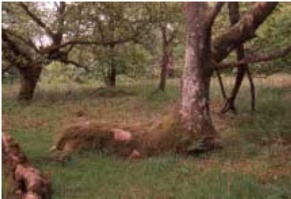
Old phoenix oak in wood pasture, Carstramon wood

An aspect of woodland refugia is that they allow trees to perpetuate vegetatively, ie without seeding. It is quite common to find say a rowan tree on a crag or in a rocky gully to have fallen over, even been knocked over in a landslip, and then to be re-growing from the stump, or the branches putting on new shoots, or just turning up to the vertical in a curve from the tip. When a tree does this we call it a ' phoenix tree ', in that it has risen again!