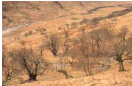
two views of slope-alder wood pasture at Glenfinglas. Massive alder on left also has a rowan 'air-tree' growing inside, a common feature in veteran hollow alders

I would go so far as to hypothesise that many of today's poorest condition upland wood pastures are simply the long-suffering remnants of natural-origin, unenclosed, black-woods. These remnants may therefore be some of the most natural woodlands in the landscape, especially if they include undisturbed woodland refugia in deep gorges and on crags.