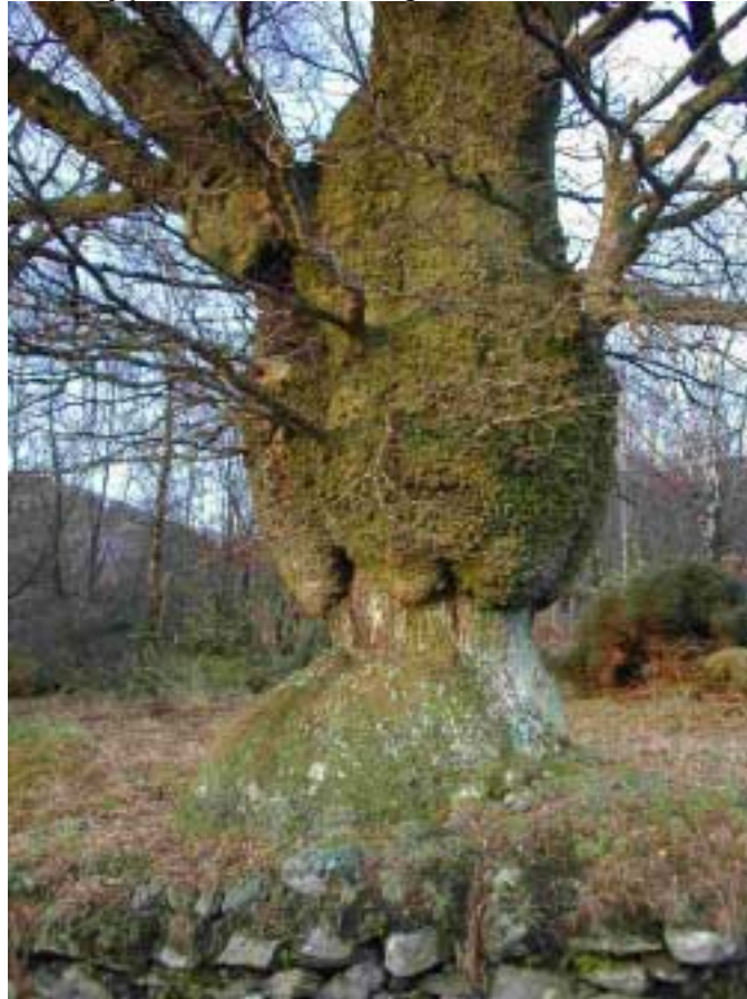
Magnificent burry pollard oak at Inverbeg, Loch Lomond, with basal swelling

Birch trees in old age develop a peculiar ropey effect on the bark, which is a kind of strengthening mechanism. This feature only develops in old age, especially on the large horizontal branches of ex-pollard birches but also on main stems of open grown birch. Also as birch ages, deeply blocked bark develops, which is a niche habitat for many specialist species of lichen and invertebrates.