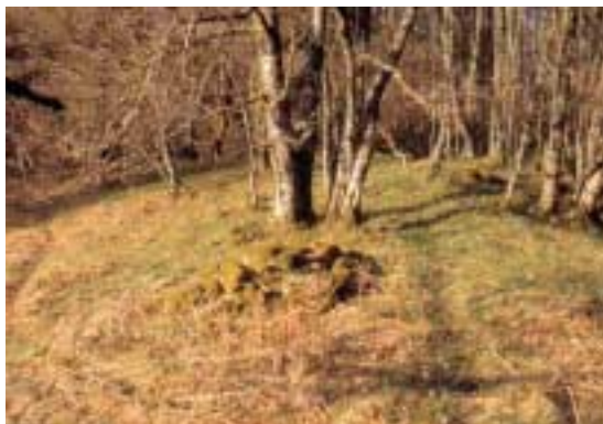
l: field clearance cairn in wood pasture Glenartney

People also used to live in wood pastures ( it does seem more likely than living within dense woodland? ). There are now ruins of settlements, shielings, crofts, and byres within ancient wood pasture, as well as cultivation terraces, cailyards, old tracks and drove roads. Thus there are domestic and settlement features within wood pasture, as well as relicts of industrial archaeology. A separate and full guide to archaeological features within woodlands and wood pastures would therefore be useful for field observers.