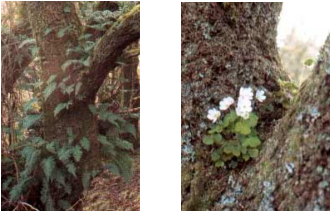
epiphytic plants on veteran alders l: polypody fern, r: wood sorrel

Even the 'air trees' described above are really a type of epiphyte. Ivy occurs on veteran trees in wood pasture, but it is hardly a typical plant of wood pasture, probably because the grazing pressure itself prevents ivy from taking hold. Similarly honeysuckle is at low levels in wood pasture compared to less grazed woodland situations.