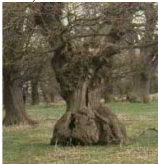
big swelling on oak, dalkeith