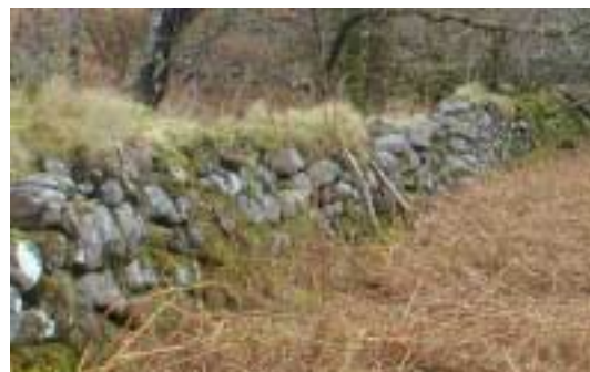
r: Woodland enclosure dyke, Glen Liver