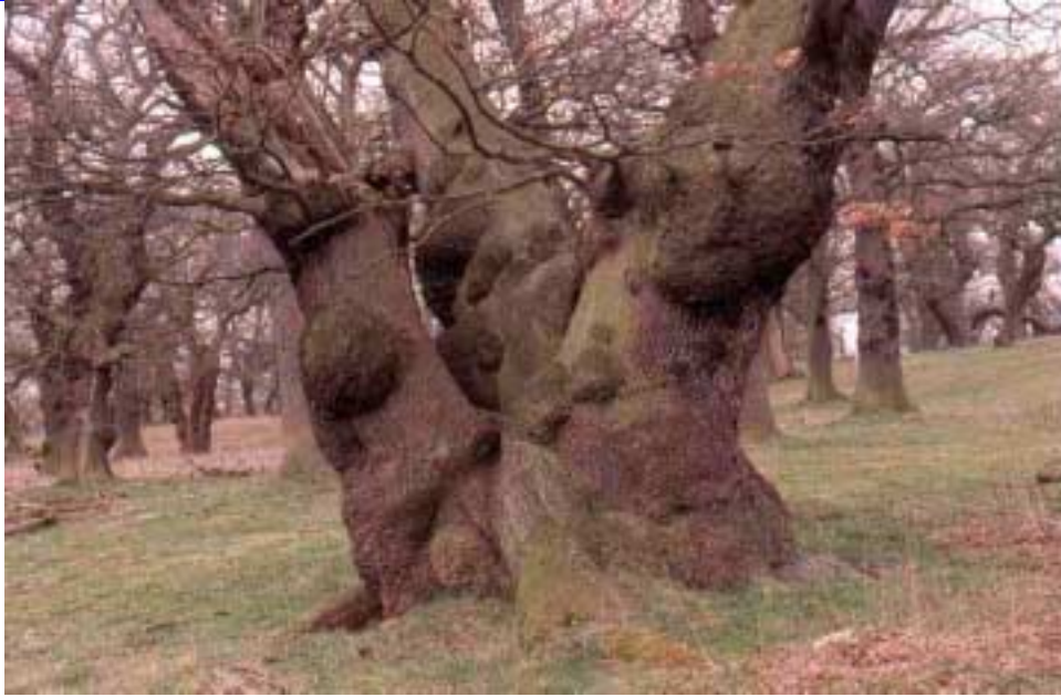
massive coppice oak , Dalkeith park

After a long period growing in the open conditions of wood pasture, old coppice stems on the same stool can merge and fuse to create odd effects. The same can happen on a smaller scale with hazel stems, which can fuse to form a sort of hollow tube. This can look similar to a hollow old stem due to internal rot, common in other species like alder.