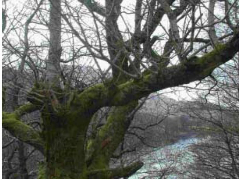
decapitated oak on shores of Loch Etive showing the comb-effect in the making

The other main type of 'historic shape' is the multi-stemmed tree . Not all multi-stemmed trees have been coppiced, as the same effect can come about through release of browsed shoots after a period of heavy grazing. That may account for a lot of the multi-stemmed hazel, alder and birch in pasture woodlands, but probably most multi-stem oak have indeed been coppiced in the past.