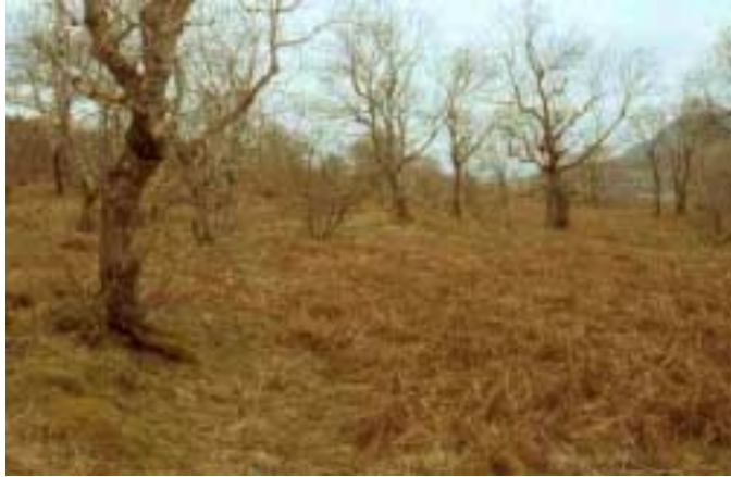
un-wooded terrace in Rassal ashwood

While Rassal ashwood does not contain classic pollards, it does have a lot of other features pointing the way to it being a cultural landscape artefact rather than a purely natural woodland. The main feature is the way that the oldest trees are sited on old limestone banks between flat smooth terraces, edged by what seem like stone clearance cairns, or short dykes. If trees are growing on some of these terraces, they are usually young, and never of the older age classes.