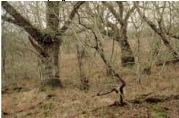
Ash and oak open-grown veterans within Achnatra