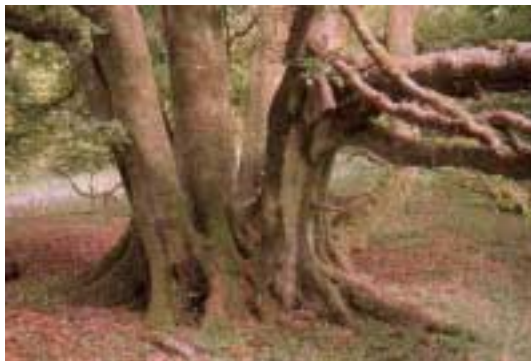
bundle planted beech at Carstramon wood

A further type of multi-stem tree, more common in lowland parks, or at least where visible from a mansion house, is the ' bundle planted ' tree. These derive from planting of a bundle of up to 10 plants in the same hole. This was a recognised 19 th C landscaping technique (see Debois, 1997). The effect today is very like a coppice stool, only the stems are fused together and do not have a hollow centre.