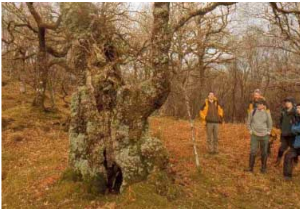
foresters contemplating one of the huge veteran oak pollards at Ardery, Sunart

Surprisingly perhaps, ancient wood pastures are a doorway that opens onto to a very wide breadth of knowledge. Even at the top levels of understanding at our universities and research institutes, it is noticeable how this topic has brought together people from a very wide range of disciplines and specialist fields. An interest, and sometimes passion, for the subject is shown by practical people such as farmers wishing to manage this habitat, or from tree surgeons interested in the work of pollarding, to grassland botanical surveyors, scientists who may be invertebrate specialists, lichenologists, mycologists, historians, archivists, archaeologists, and to those who just like big old trees! The list is actually much longer, including the poor forester who is asked to manage, or pay grants towards managing, a type of woodland which in his heart he probably believes is not a real woodland at all!