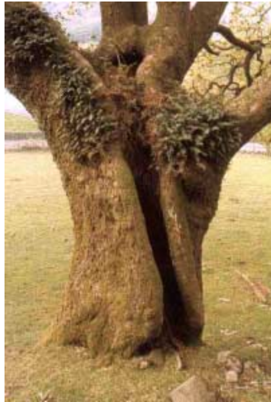
r: hollow oak pollard at Rydalwater (with polypody fern)