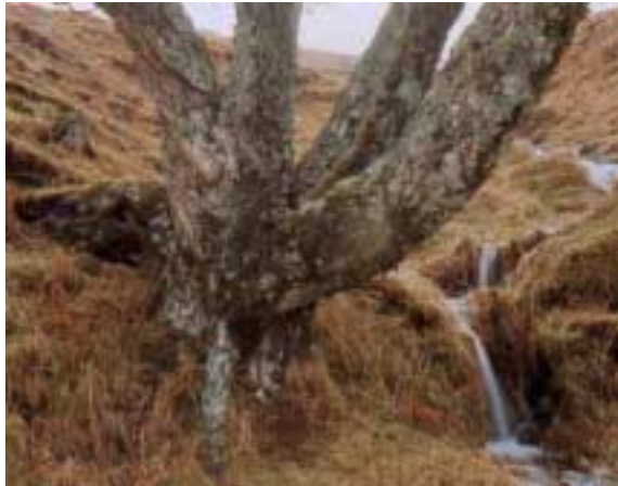
ancient multi-stem birch, Nevis

There is not yet a national inventory of either wood pastures or veteran trees in Scotland. Some local or regional surveys have been done, and SNH are now beginning to compile an outline inventory. It is also expected that land-use surveys will in future recognise wood pasture as a distinct habitat type, and so survey and map it as such. In the meantime, we need to be able to recognise a wood pasture when we see it, and the main purpose of this guide is to give enough information on the typical features of wood pasture so that anyone can do just that. Here are just two examples: huge old isolated trees in upland hill pastures, and interesting rot fungi inside veteran trees.