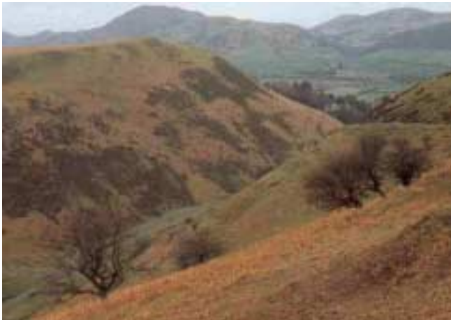
hawthorn pasture in the Shropshire hills

Blackthorn on the other hand, while common in wood pastures, seems to have strength in numbers, and regenerates more as small clumps, rather than as individual shrubs as does hawthorn.