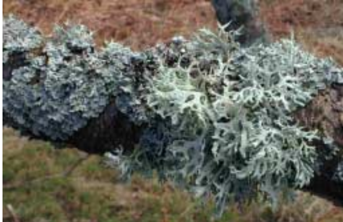
l: lichens of acid bark on birch.

A special mention should be made of epiphytic lichens , both the very obvious foliose and fruticose lichens, and the crustose and pinhead lichens on bark and deadwood. Wood pastures are a very special habitat for these organisms, many species of which are only found in ancient woodlands and wood pastures.