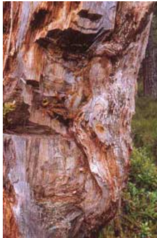
candle-fir pine, Abernethy

As we have seen, the landscape itself in ancient woodland and wood pastures is packed with archaeological and cultural interest. Even at the single tree level this is true. Perhaps the most obvious way of seeing people's past intervention with natural trees in wood pastures is through their pollarding and coppicing. However there are a few other effects of people on trees that can be seen today, such as the ancient folk-life uses of wood , like cutting candle-fir wood, or resin tapping ( not yet seen in Scotland, but known to have been a regular practice in the past ). Resinous heartwood in old native pines was often cut out by axe for 'candle-fir' cottage lighting (Grant 1995). In the example shown here, after cutting out the heart of a veteran pine in a pine/alder wood pasture stand in Abernethy Forest the wound was overgrown by the tree, then the sapwood partially rotted away, but the evidence of this past use persists.