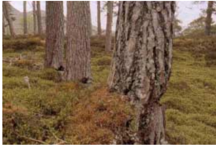
resin tapped Scots Pine (in Poland!)

r: old pine on Braulen estate, Glen Strathfarrar, with axed 'sinks' cut ready for cross-cut sawing by fellers during the second world war, who evidently never came back to these trees to finish the job!